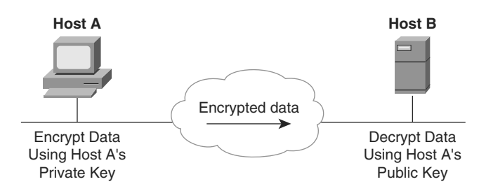
Figure 8-2 Public/Private Key System for Sending a Digital Signature

You can encrypt your document or a part of your document with your private key, resulting in what is known as a digital signature . The IRS can decrypt the document, using your public key, as shown in Figure 8-2. If the decryption is successful, the document came from you because nobody else should have your private key.