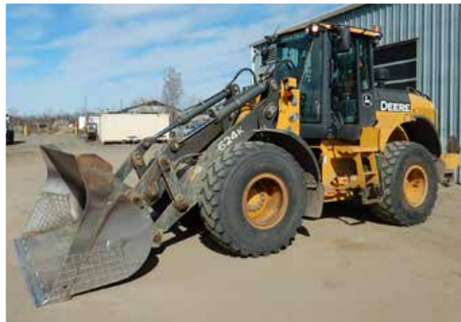
2012 John Deere 624K