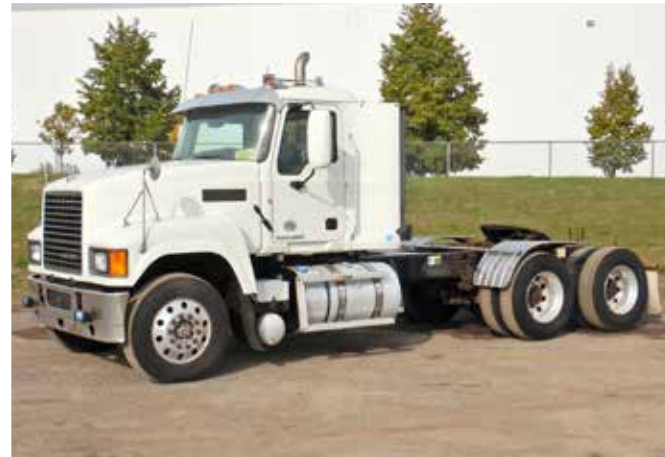
2014 Mack CXU613 Pinnacle Heavy Haul