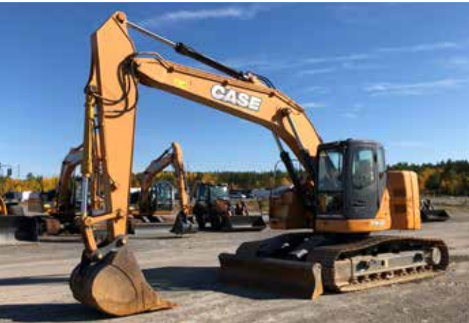
2014 Case CX225SR