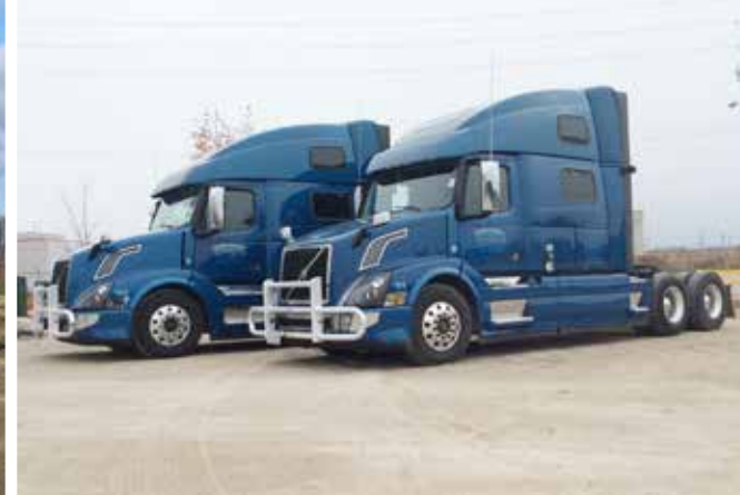
2015 & 2016 Volvo VNL 780