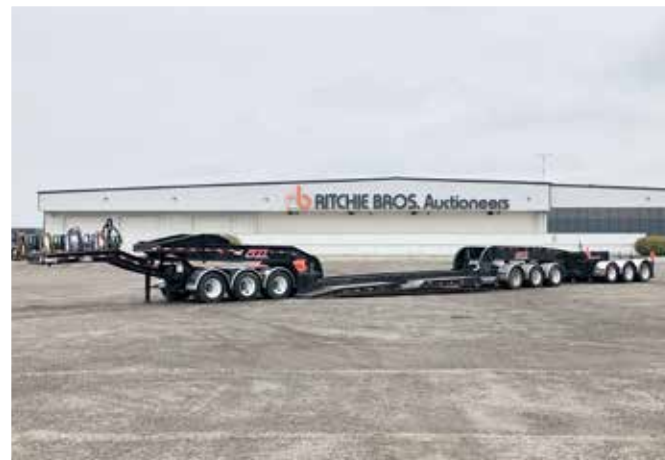
JC Trailers 100 Ton 3+3+3