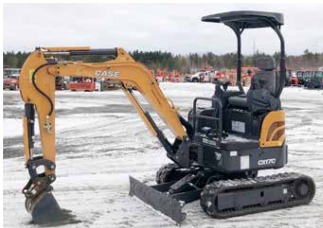
Unused – 2018 Case CX17C