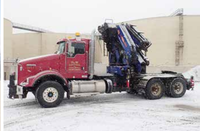
2014 Kenworth T800 w/PM 53SP