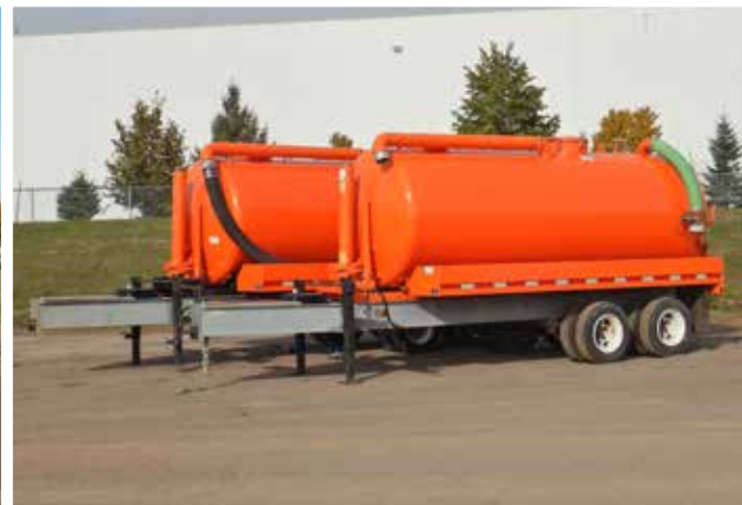
2 of 4 - 2017 Transway Systems 2800 Gallon