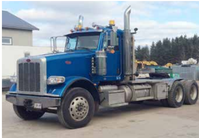
2015 Peterbilt 367 Heavy Haul