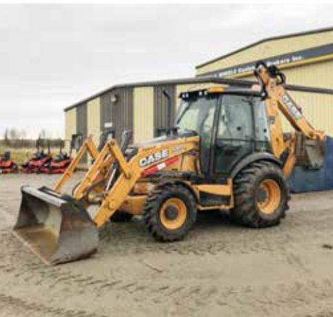
1 of 2 – Late Model Case 580 SN WT 4x4