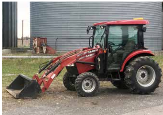
2010 Case DX50 MFWD