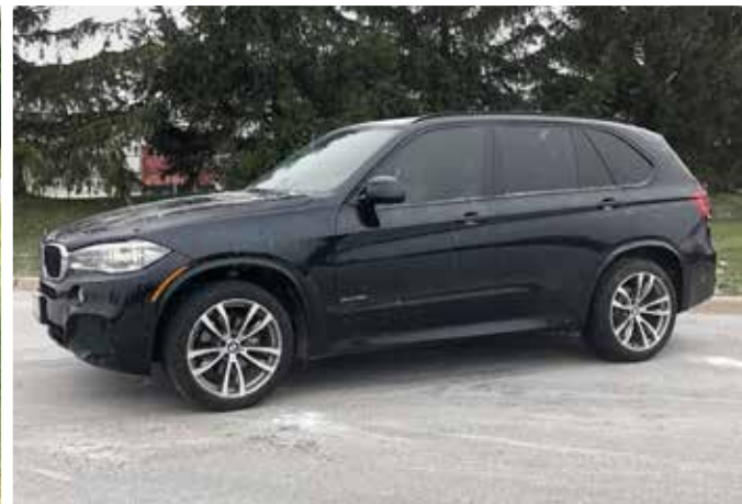
2016 BMW X5 35i X Drive