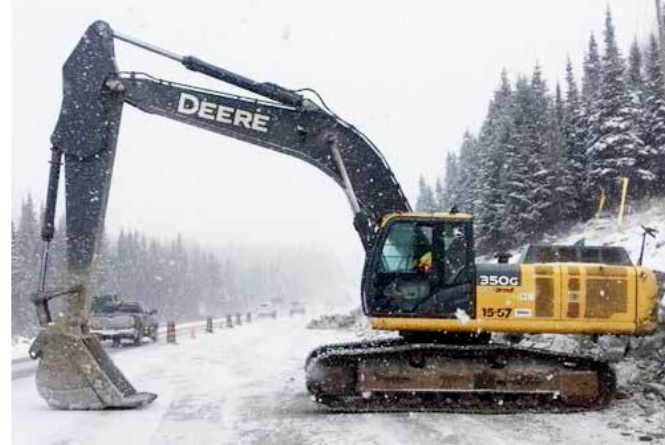
2014 John Deere 350G LC