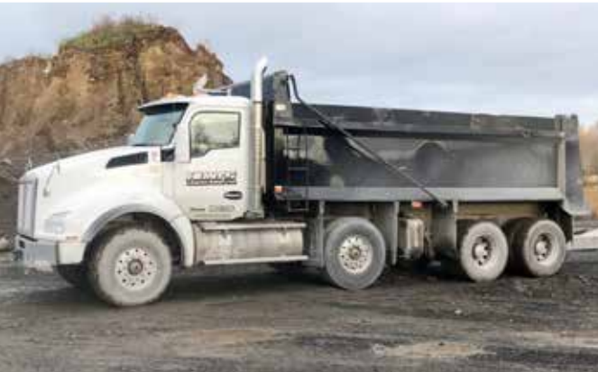
2017 Kenworth T880