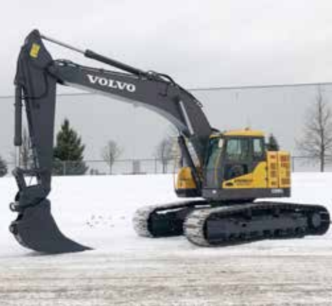
2016 Volvo ECR305CL