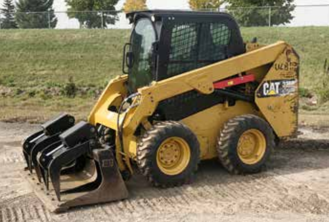
1 of 2 – 2015 Caterpillar 236DLRC