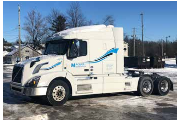
2016 Volvo VNL630 Heavy Haul