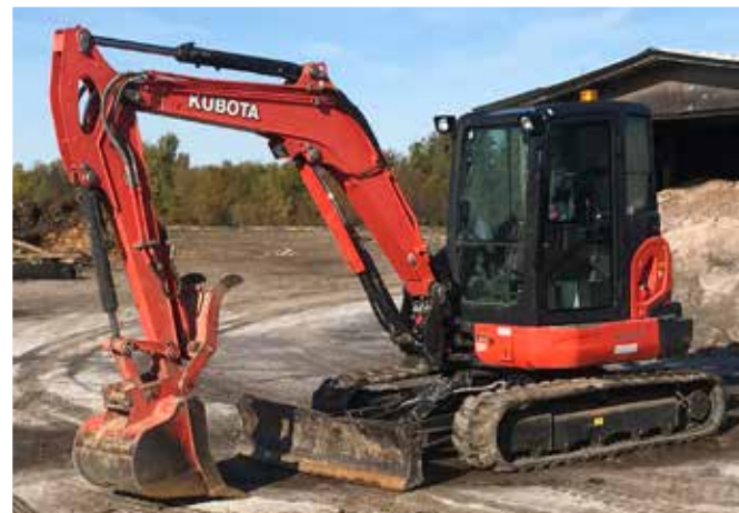
2015 Kubota KX057-4