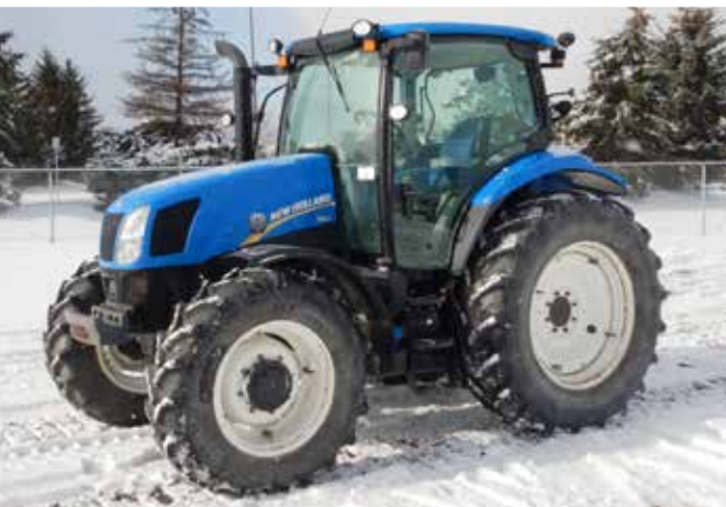
2013 New Holland T6.160