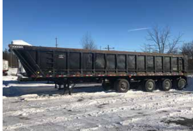
2012 Manac 42 Ft