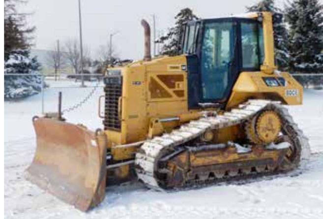
Caterpillar D6N XL