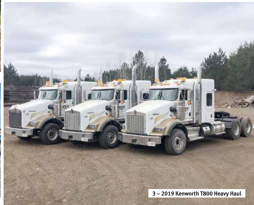
3 – 2019 Kenworth T800 Heavy Haul