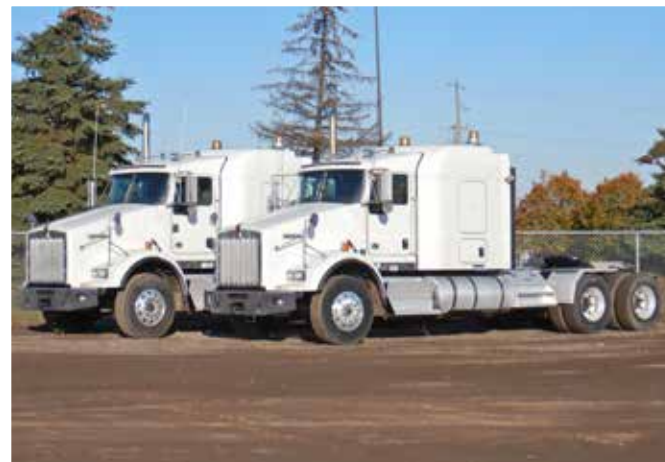
2 of 3 – 2012 Kenworth T800 Heavy Haul