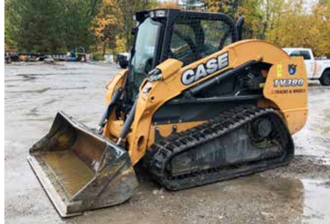
2014 Case TV380