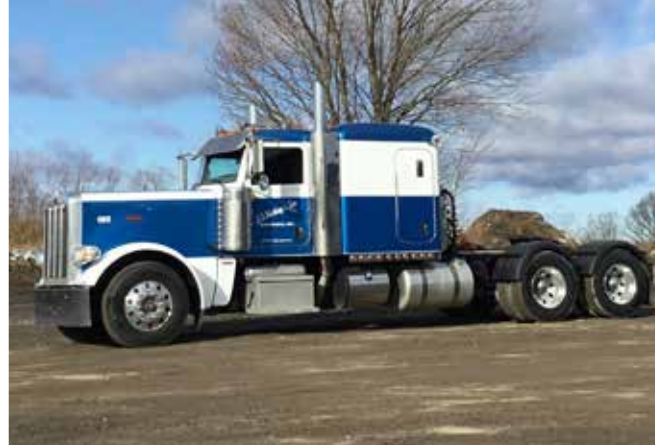
2013 Peterbilt 389