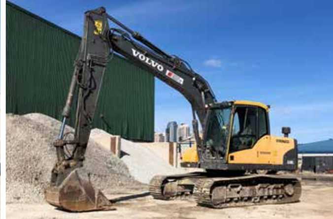
2011 Volvo EC140CL