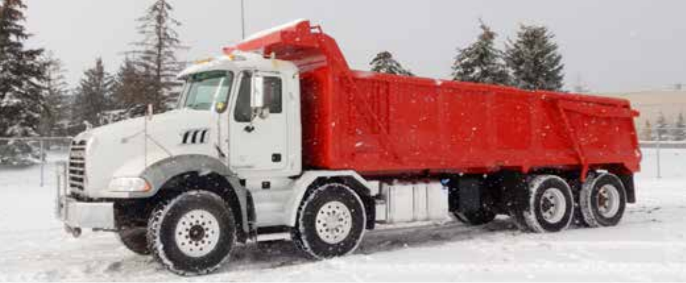
2014 Mack GU813 Granite