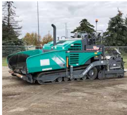
2013 Voegle Vision 5200-2i