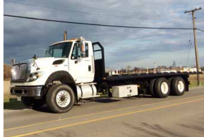
2012 International 7600 WorkStar