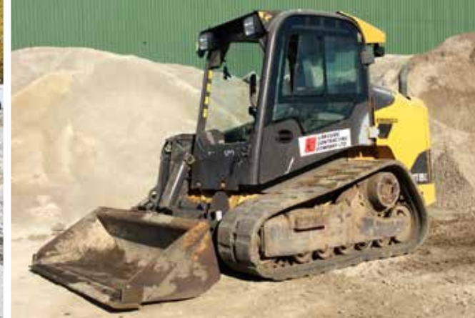
2014 Volvo MCT135C 2 Spd High Flow