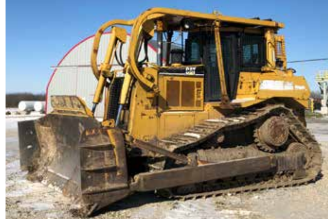
1 of 2 – Caterpillar D7R XR Series II