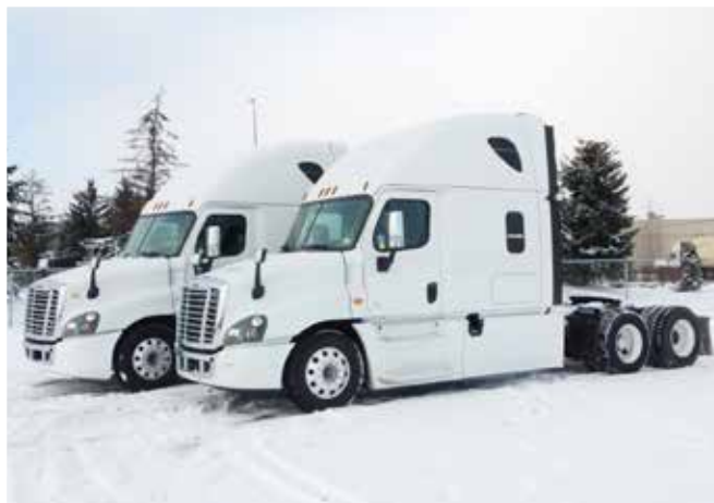
2 of 17 – 2016 Freightliner CA125SLP Cascadia