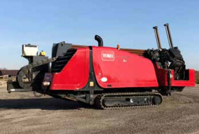
1 of 2 – 2013 Toro DD2024