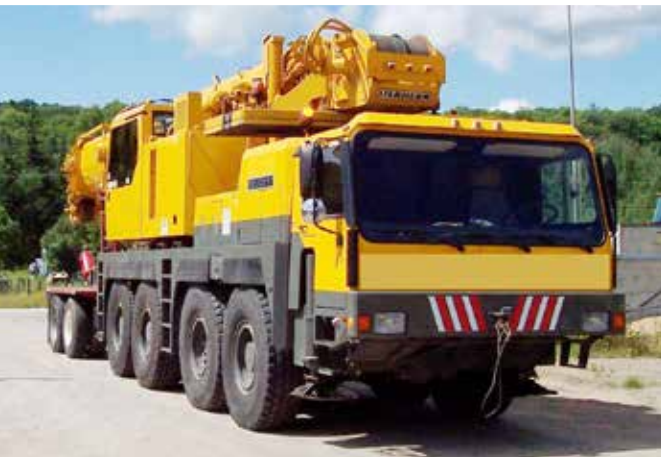
Liebherr LTM1090-2 110 Ton