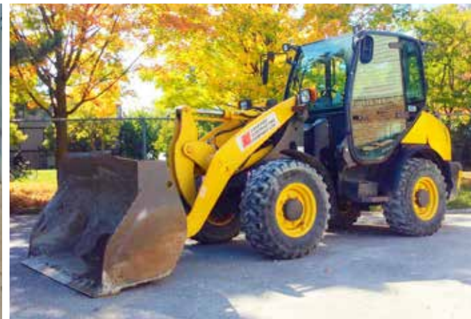
2012 Komatsu WA70-6