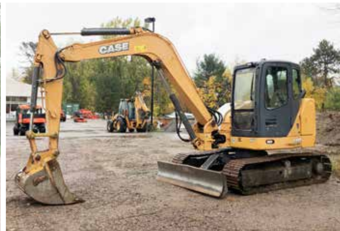
2012 Case CX80