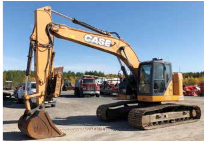
2013 Case CX235C