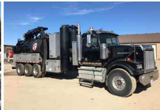
Western Star 4900SF w/Vector