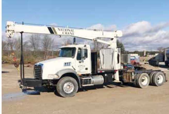
Mack Granite w/National Crane 400B