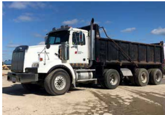
1 of 2 – Western Star 4900SA