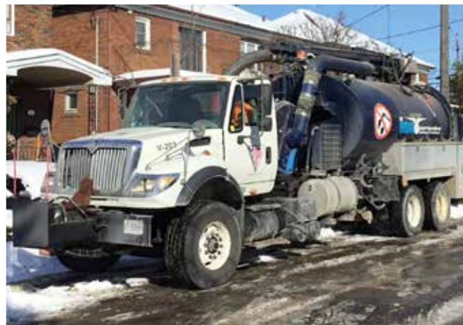
International 7600 WorkStar w/Vector 2112HXX