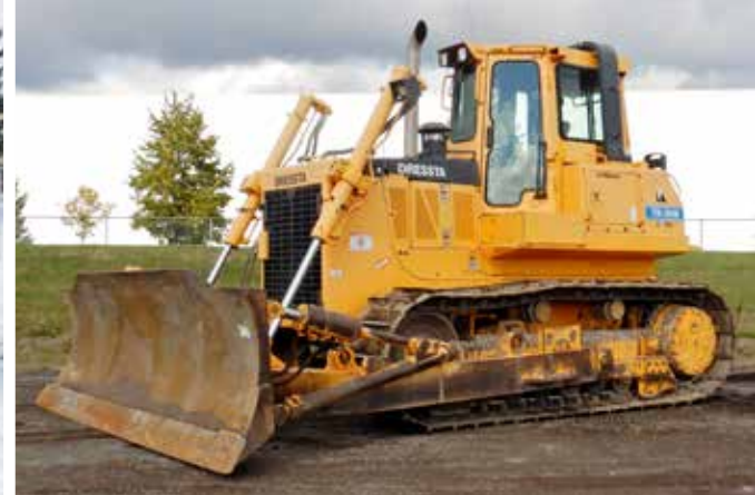
2012 Dressta TD20M Xtra LT