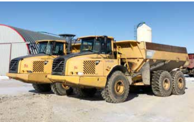
2 of 3 – Volvo A25D 6x6