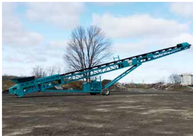
2016 Powerscreen MS8036 36 In. x 80 Ft