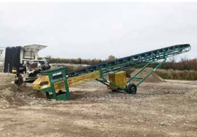
2012 Laprade RS-65 30 In. x 65 Ft