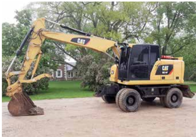
2016 Caterpillar M314F 4x4