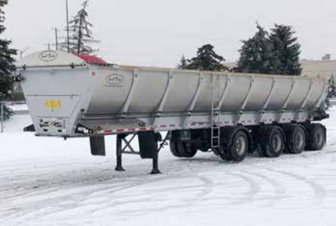
2016 Trout River 48 Ft