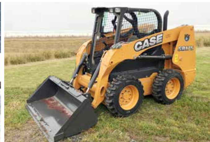
Unused – 2016 Case SR175