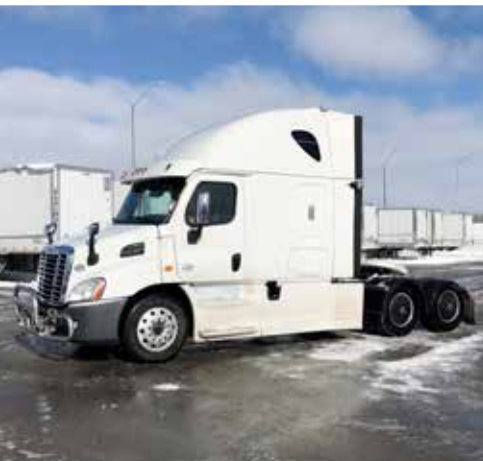
1 of 4 – 2017 Freightliner CA113SLP Cascadia