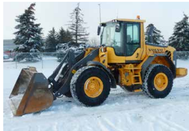
2010 Volvo L60F