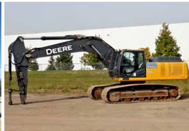
2016 John Deere 350G LC