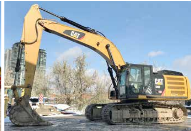
2013 Caterpillar 336EL