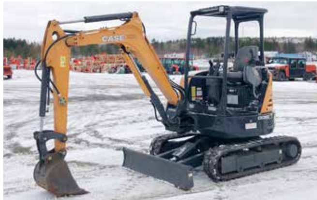
Unused – 2018 Case CX26C