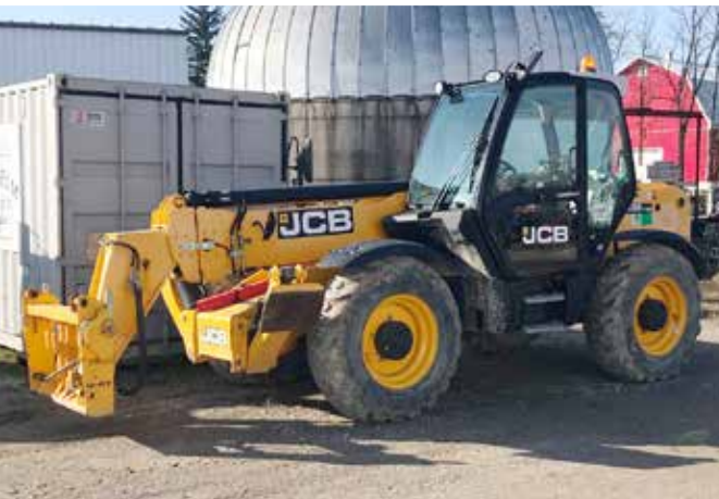
2013 JCB 535-140 4x4x4