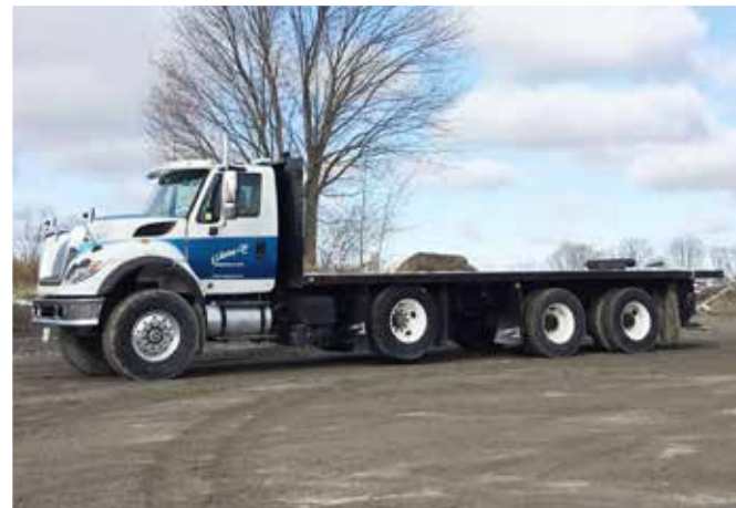
International 7600 SBA WorkStar