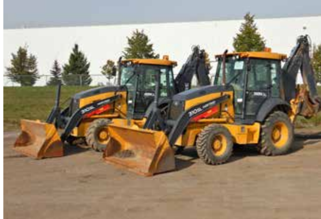
2 – 2016 John Deere 310SL 4x4