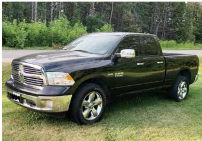
2016 Ram 1500 Big Horn 4x4