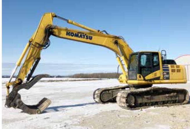
2012 Komatsu PC290LC-10