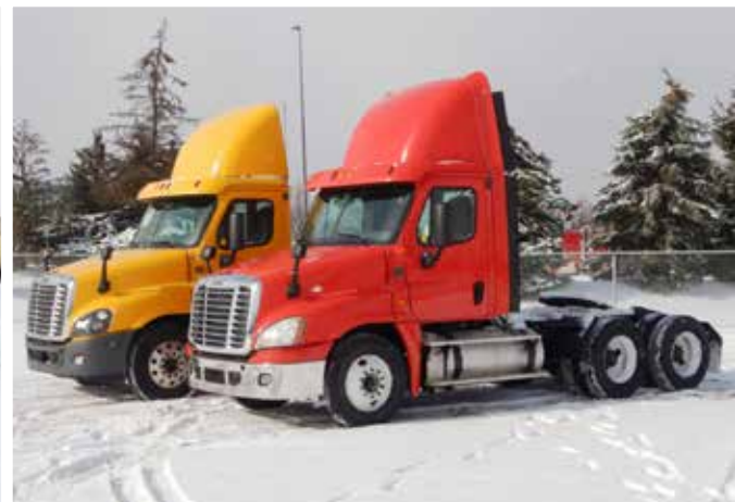
1 of 4 – 2012 and 1 of 6 – 2013 Freightliner CA125DC Cascadia