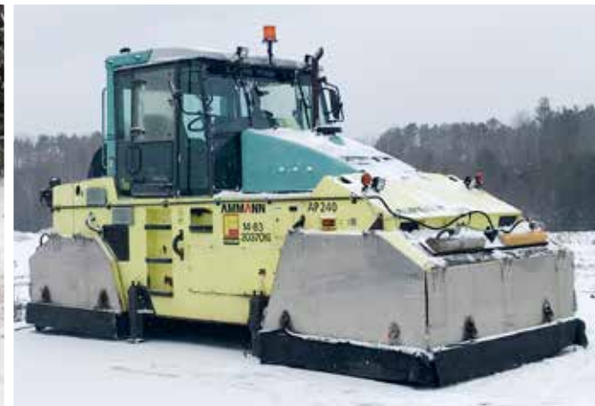
2010 Ammann AP240