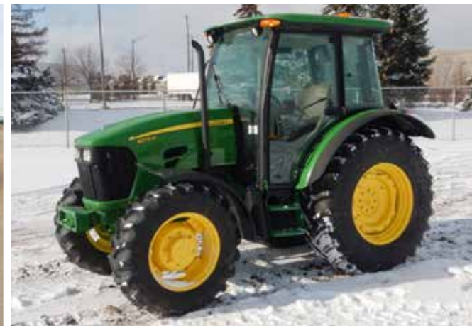
John Deere 5075M