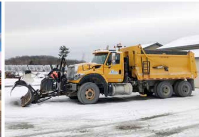
2015 International 7600 WorkStar w/N13