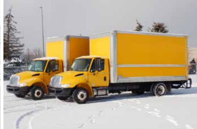
2 of 19 - 2013 International 4300 DuraStar