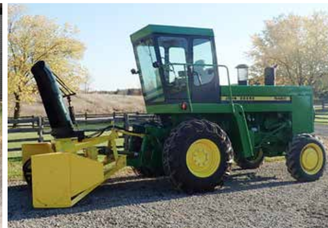
John Deere 5460