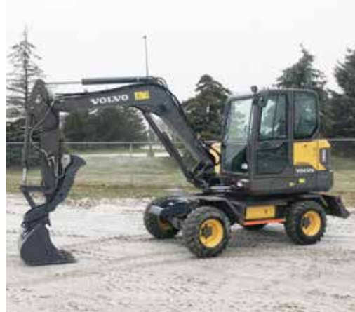
2017 Volvo EW60E 4x4