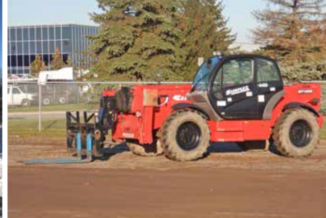
2011 Manitou MT1840EP 4x4x4