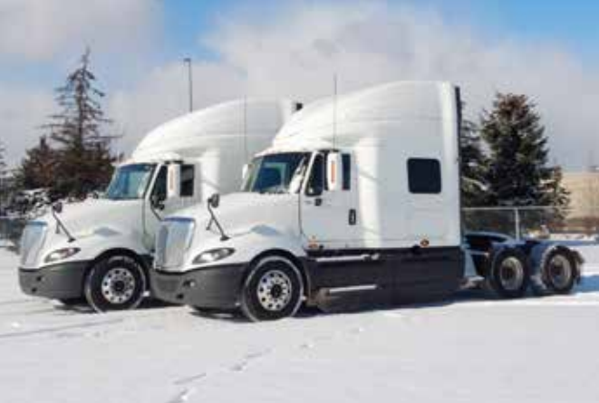
2 of 13 – 2017 International ProStar+ w/N13