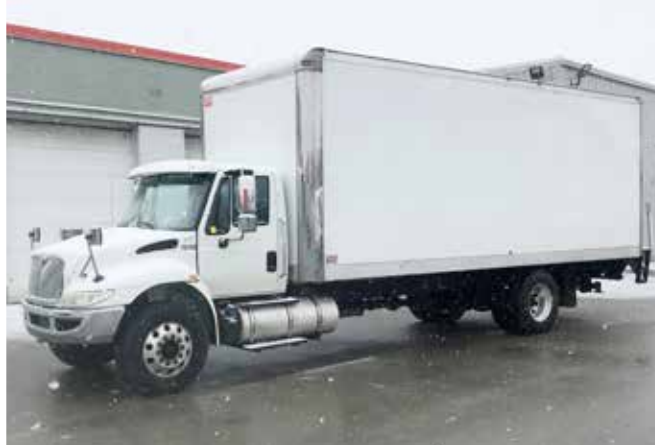
2016 International 4300 DuraStar