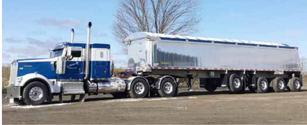
2014 Kenworth W900 & 2013 Stargate 44 Ft