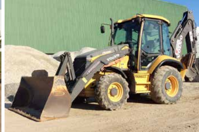
2014 Volvo BL70B 4x4