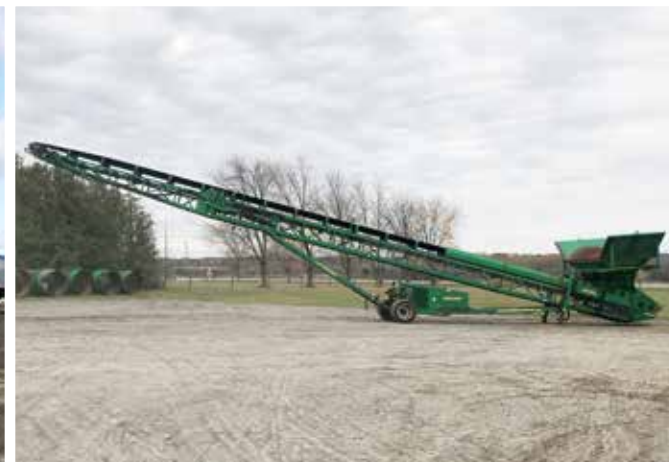
2013 McCloskey ST80 36 In. x 80 Ft