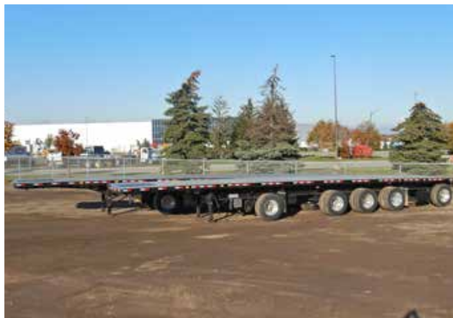
2 - Unused - 2019 BWS 50HFSX 50 Ft