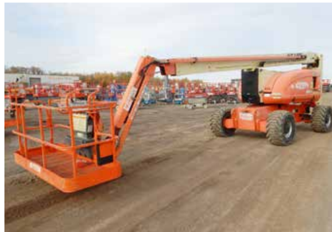
1 of 6 – JLG 800AJ 4x4