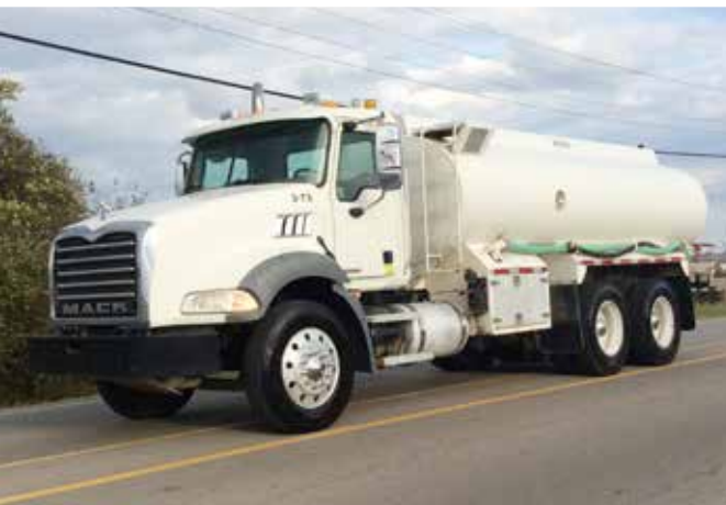
Mack CT713 Granite 15900 Litres