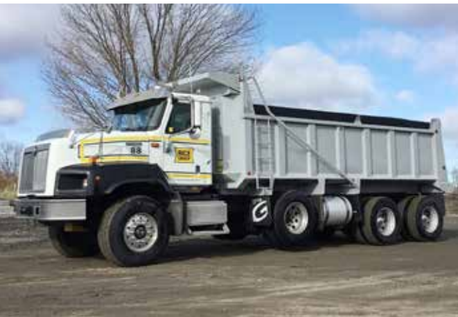
International 5600i PayStar