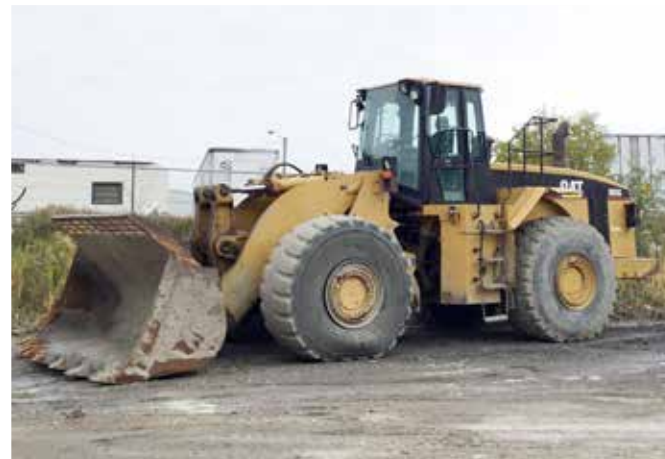
1 of 2 – Caterpillar 980G