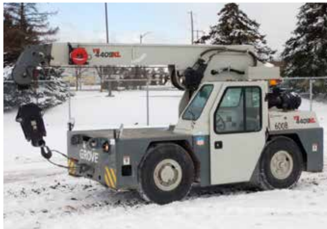
Grove YB4409XL 8.5 Ton 4x2x4