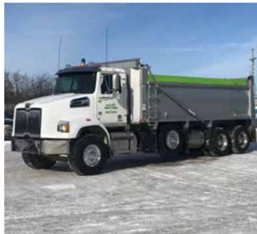
2018 Western Star 4700SB