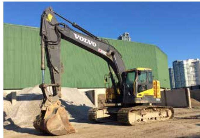
2015 Volvo ECR235DL