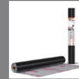
Deck Defense® Synthetic Underlayment