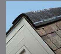
VentSure® Ridge Ventilation