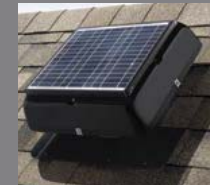
VentSure® Solar Attic Exhaust Fan