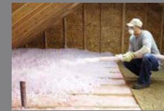
AttiCat® Expanding Blown-In Insulation System