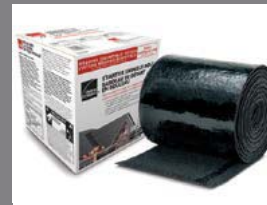
Starter Shingle Roll