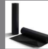
FIBERGLAS™ Reinforced Felt Underlayment