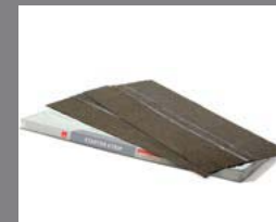
Starter Strip Shingle