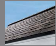
VentSure® InFlow® Vent