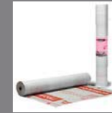
ProArmor® Synthetic Underlayment