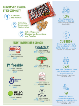
An updated brochure demonstrating the strength of the food processing industry was printed in May, highlighting the traditions, innovation, and logistics that contribute to the industry's success in Georgia.