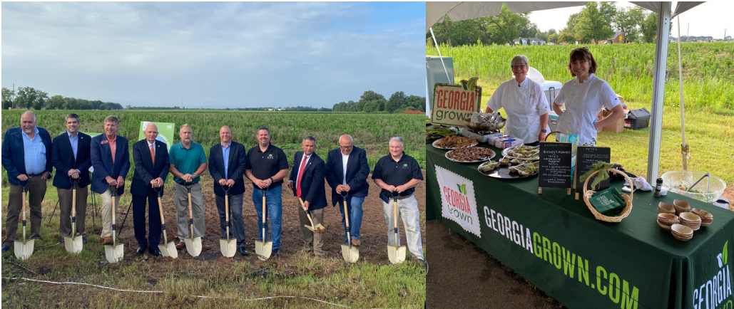
Center of Innovation first introduced Pete's, an indoor agriculture/vertical farming grower, to Georgia in 2017. The state announced its location in Peach County, and a groundbreaking was held for the new Georgia Grown company during the fourth quarter of FY21.