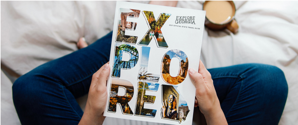
On May 3, Explore Georgia unveiled the 2021 Explore Georgia Official State Travel Guide and launched a new marketing campaign, Ready. Set. Georgia.