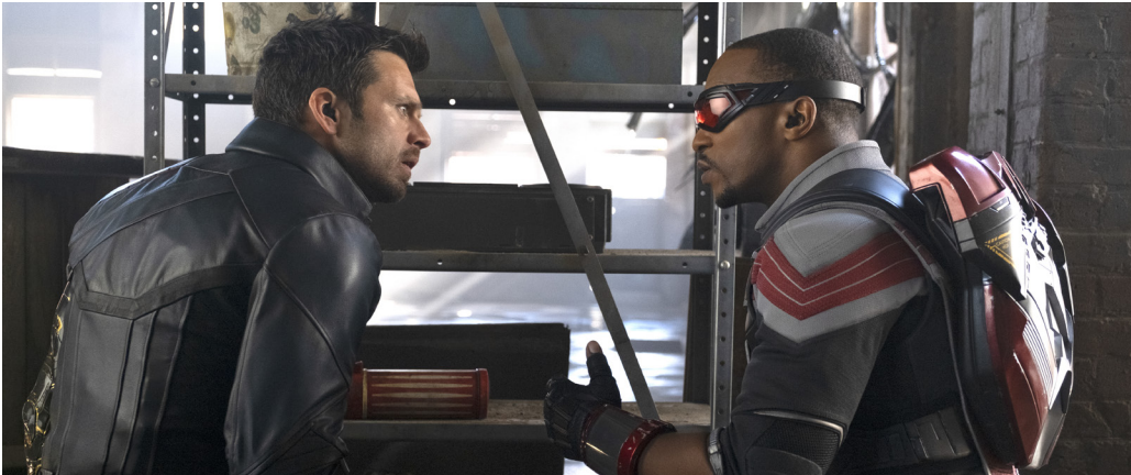
Marvel Studios' "The Falcon and The Winter Soldier" was one of the many Georgia-lensed productions to earn a 2021 Emmy® Award nomination. Filming occurred in multiple locations around metro Atlanta.