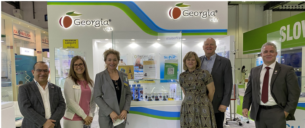
Georgia co-exhibited at Arab Health 2021, in Dubai, UAE. This was the first in-person international trade show for GDEcD since the onset of the pandemic.