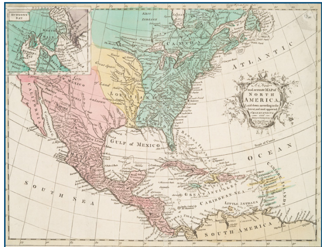
1763 map of European claims to North America. Courtesy of the Lionel Pincus and Princess Firyal Map Division, The New York Public Library (483704). To access a digital image of this map, go to https://digitalcollections.nypl.org/items/510d47db-c2e5-a3d9-e040-e00a18064a99 .

These new regulations annoyed some colonists more than others. For example, in 1763, the British government proclaimed that British colonists could not claim land west of the Appalachian Mountains. This Proclamation line attempted to reduce violence between colonists and the hundreds of Indigenous nations who lived in North America. When the British government argued that colonial settlement in the west was illegal, it frustrated trans-Appalachian speculators, such as George Washington, who wished to sell land legally to other European settlers. Nonetheless, colonial squatters simply took the land, in defiance of both the wealthy proprietors who claimed it and the British army that was supposed to enforce the ban.