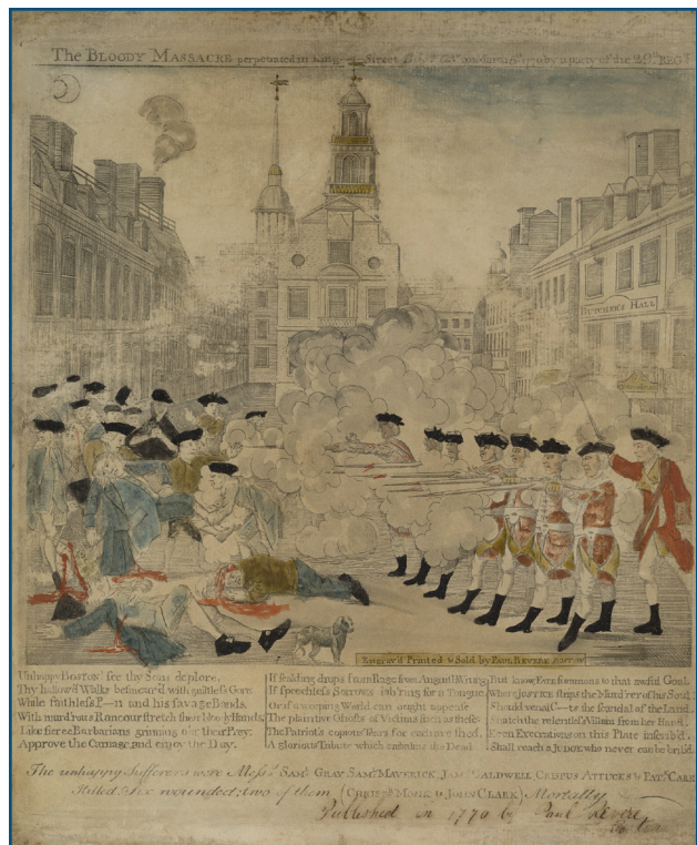
This engraving by Paul Revere, showing a line of disciplined soldiers mowing down unarmed civilians, depicts the oppression of a people by the army of their own ruler. To access a digital copy of this image, go to https://www.loc.gov/item/2008661777/.

Colonists again threatened boycotts of tea and insisted that they would ban British ships carrying the imported substance from entering their ports. Some importers in New York, Charleston, and Philadelphia agreed to send back their shipments, but not those in Boston. As a result, in December 1773, a small group of men threw the tea into Boston Harbor.