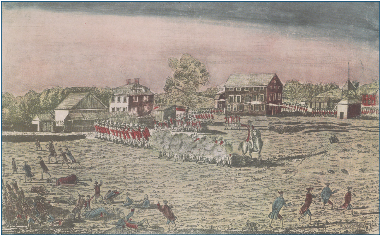
A print of the Battle of Lexington, April 19, 1775. To access a digital copy of this image, go to https://www.loc.gov/item/2015650276/.

The document that Thomas Jefferson drafted, and that the Continental Congress approved, consists of two very different parts. The stirring preamble, asserting the equality of all mankind, sits in an uncomfortable juxtaposition with the long list of specific indictments against King George III, several of which alluded to the racial conflicts of the previous decade. The document included a clear reference to Lord Dunmore's proclamation and gestures angrily toward British attempts to restrain colonial settlement in the west. To Thomas Jefferson's distress, his fiery denunciation of the slave trade was cut from the final version. 8