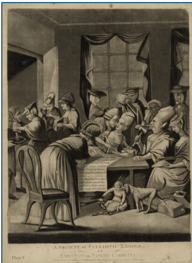
British satirists mocked women’s participation in boycotts. In this image, a non-housebroken dog licks a baby left neglected under the table. Courtesy of the Library of Congress (96511606). To access a digital copy of this image, go to https://www.loc.gov/item/96511606/ .

Nonetheless, the decision to separate from Great Britain did not come easily. Although many local governments wrote their own declarations of independence, it was clear to the Second Continental Congress that doing so created a new set of problems: fierce conflicts between the colonies about their claims to American Indian nations’ lands west of the Appalachian Mountains, a weak negotiating position with other European powers, and especially the necessity of creating new state governments. Some colonies expressly told their delegates not to vote for independence precisely because it invalidated their colonial charters.