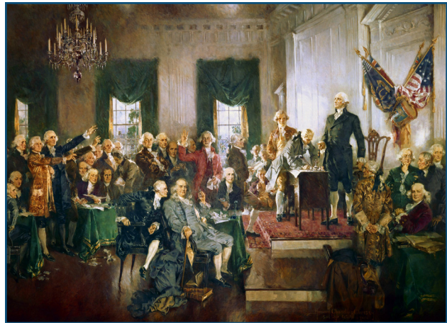
Howard Chandler Christy's 1940 painting, Scene at the Signing of the Constitution of the United States , hangs in the East Stairway of the House Wing of the U.S. Capitol Building in Washington, D.C. To learn more about the painting, go to https://www.aoc.gov/explore-capitol-campus/art/signing-constitution .

The lessons that follow are stories about people’s attempts to make the nation a more perfect union. Sometimes people understood explicitly that such perfection was their goal. Other times, they pulled on strands of U.S. history such as racial separation, gendered expectations, and suspicion of outsiders. Nor did Americans always realize exactly what they were doing at any given moment. But these ideas—these conflicts—are baked into our history, and show up again with some frequency. “A more perfect union” is at the end of a path that circles around and loops over itself. But no matter where we are on that road, our origins—heroic, shameful, and sometimes downright contradictory—are always with us.