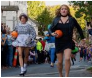
Annual High Heel Drag Race charges through New Hope Oct. 21