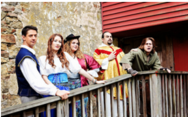
Hunchback of Notre Dame

When given an opportunity to walk about Paris during the Feast of Fools, where the ugly and deformed are cruelly celebrated, Quasimodo goes out into the streets and gets crowned, due to his disfigurement, the “King of Fools.” During the celebration, he gets abused by the throng and is rescued by the beautiful gypsy Esmerelda. What ensues is a love quadrangle between Esmerelda, Quasimodo, Archdeacon Frollo (who is tormented by the lust he feels) and a guard sent to arrest her, Captain Phoebus de Martin. An ongoing theme in the play is how the gypsy immigrants are viewed as undesirables, which makes Frollo’s attraction to Esmerelda inexplicable and damnable according to his values.