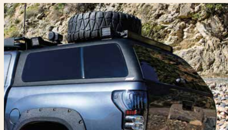
Spray-on protective coating increases strength in high stress areas.

OTR Spray-on Full Protective Coating Off The Road Protection