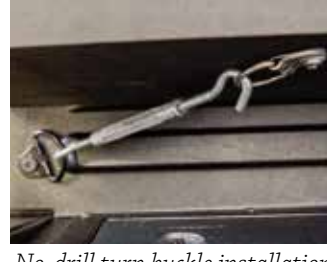
No-drill turn buckle installation