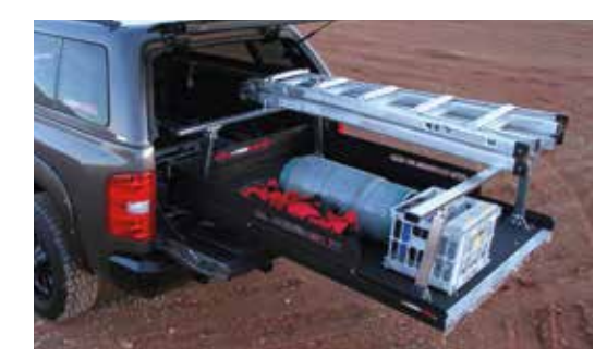
Increase your storage with the optional cargo rack