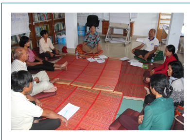
Treatment group practicing relaxation techniques in dealing with chronic pain with