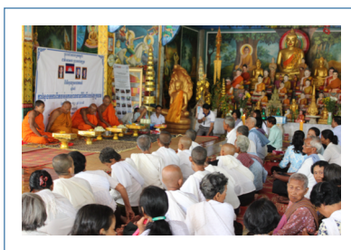
Community-Based Truth-Telling Ceremony at Balang Reangsey pagoda, Krang Leav commune, in Kampong Chhnang province

Through donation from Raksa Koma foundation http://www.raksakoma.org/ and TPO, 200 bright yellow T-shirts were printed and distributed for promoting world mental health day with the youth and inviting the public and other partner organization to join the event. TPO displayed posters, publications and gave away a many brochures and leaflets to all interested participants.