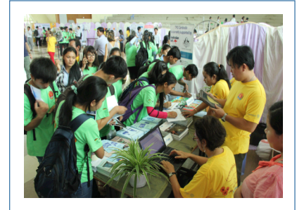
Participants check out the TPO material displayed and take free leaflets at RUPP Youth Mental Health Day

With funding from UN WOMEN http://asiapacific.unwomen.org/en/countries/cambodia 51 civil parties were invited to a one day workshop at Khmer Arts Theatre