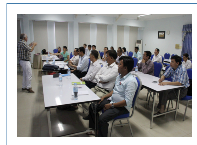
workshop on Bipolar Affective Disorders 26-27 October at TPO HQ