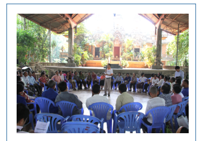
Consultation workshop on 22 October at Khmer Arts Theatre in Thakmao, Kandal Province