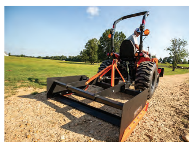
LAND LEVELER/GRADERS: 60°