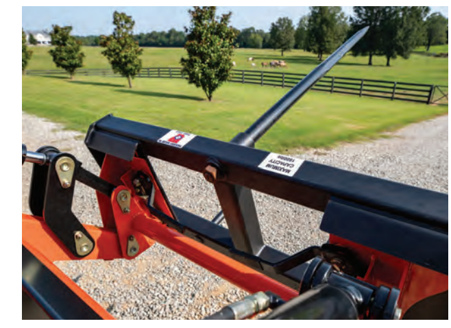
FRONT QUICK-ATTACH HAY SPEAR

Our Rotary Cutters deliver the best value in the industry by making it the perfect match for your hard work—and your tractor. With industry leading standards and build quality second-to-none, the Bad Boy Rotary Cutter performs to the highest standards—and at a price that's even tougher to beat.