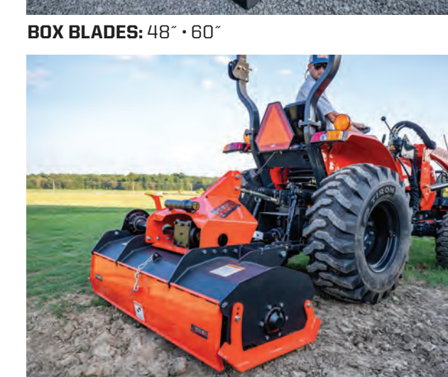
ROTARY TILLERS: 48" • 60"