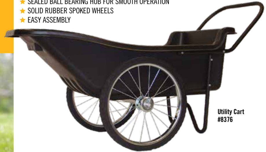
Utility Cart #8376