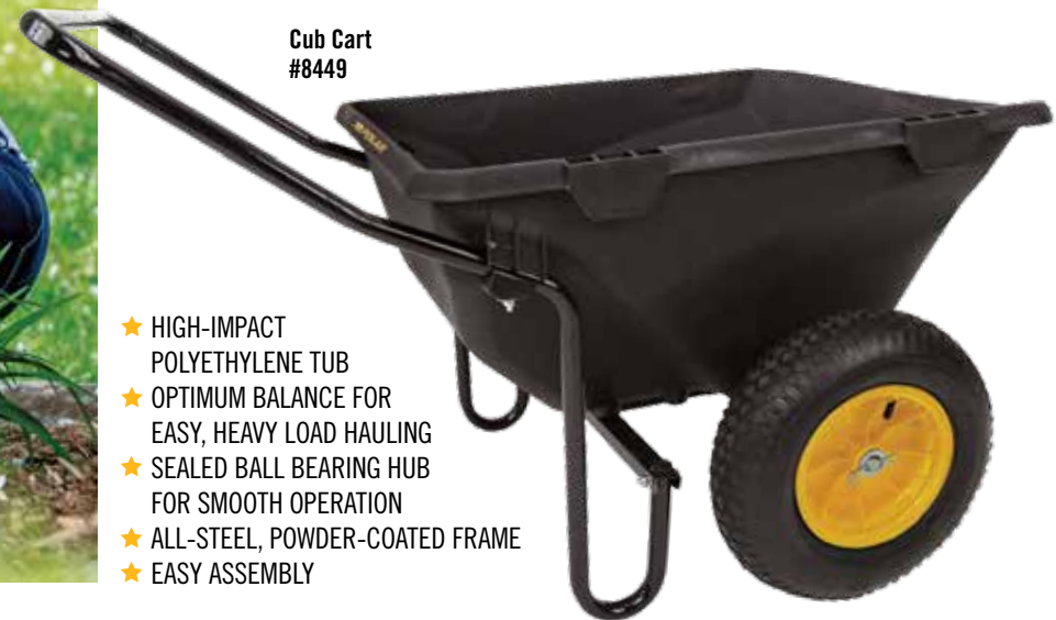
Cub Cart #8449