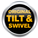
HD 1500 #8233