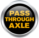
HD 1500 TA #8262