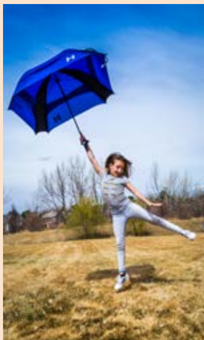
This photo was taken in the Digital Photography for Kids Class

Cooking and Crafting (5-15yrs) - Kids will learn a simple recipe, and create a fun craft in each class. Thu 4:30-6:00p