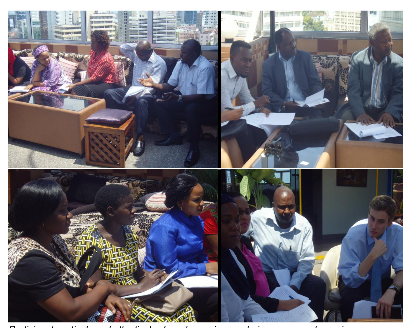
Participants actively and attentively shared experiences during group work sessions

Between 2001 and 2002, an organization known as Land Management Pogramme (LAMP), sponsored Kiteto villages to draw up maps of the land use plan. In 2006, another organization known as Community Research Development (CORDS), owned by a Member of Parliament for Kiteto, conducted a map review which changed the earlier land use plan. Following these measures, there was a shift over the land use in some areas; from agriculture to pasture land or vice versa. That is when many land conflicts started to surface between farmers and pastoralists on one hand, and farmers and the district council on the other. Conflict of interests among leaders, politicians, large scale farmers is reported as well to widen the problem.