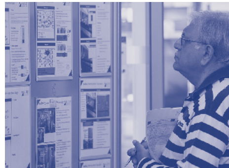
Visual Management in the office – using kanbans, kamishibai cards, obeya room