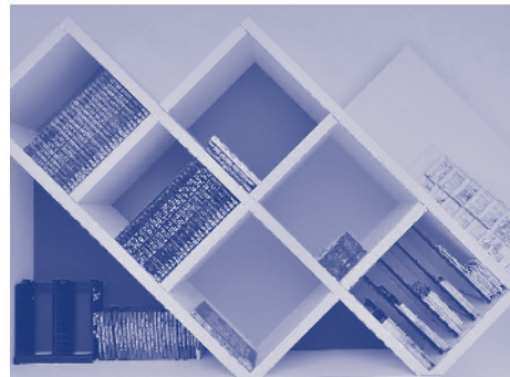
Knowledge Zone (library) for learning organization