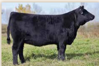
RDE Cat RLP 2C Dam of Lot 57

Looking for an Angus herd sire to put some size into your calves, this is the bull for you! IG is going to mature into a big framed mature bull. He is nice fronted, he's thick topped with a good quarter, his structure is very correct and he has an excellent foot under him. IG's dam 2C is a never miss producing cow who can get bred to any sire and produce a ripper of a calf. IG's maternal sister sold in the 2018 Angus Collection sale for $10,000. Musgrave Sky High prodigy has been very docile in our herd.