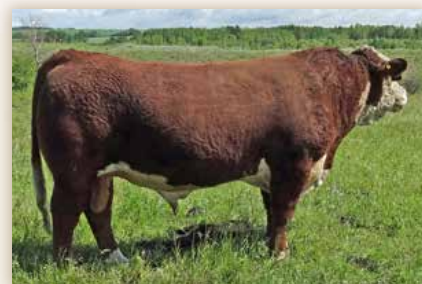
CHSF 16B DYNASTY 3E Sire of Lots 67 & 68