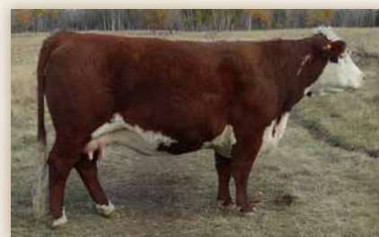
CHSF 18X BRITTANY 37Z Maternal grand dam of Lot 62