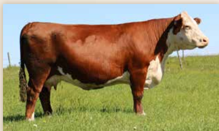
HARVIE MS FIREFLY ET 323Y Dam of Lot 66