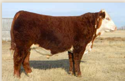
Bar R-Z 37C EVEREST 32E Sire of Lots 60-65