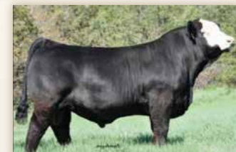
Harvie JDF Splash 108B Sire of Lot 56

Purebred Simmental Bull. Powerful, deep and full of muscle describes 14G. Like his sire this calf will add shape and style to his calves. We purchased his dam out