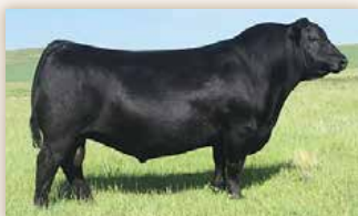
S A V President 6847 Sire of Lot 58

HEIFER BULL 7G is a bomb proof heifer bull, with a low birthweight of 74lbs. He has a nice small head and smooth shoulder, you could sleep soundly at night knowing your first time calving heifers are bred to this guy. 7G was a part of our show string at the Olds Fall Classic in 2019. He caught a lot of attention in the stall for his eye appeal and structure.