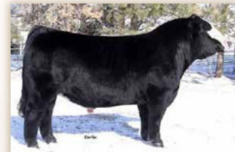
MR HOC Broker Sire of Lot 54

Bring on the performance with this half-blood registered Simmental bull! Out of one of our favorite blaze faced cows, 5G is sure to throw a bit of chrome in his calves. This guy is built to throw weight into steers but also raise big