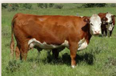
CHSF 100W BRITTANY 20C Dam of Lot 60