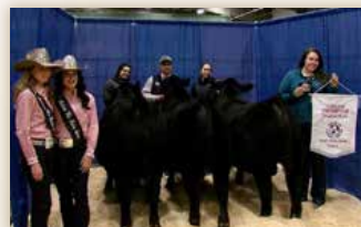
Grand Champion Pen of Bulls, Medicine Hat Pen Show '19