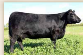
RDE Cheetah RLP 15X Dam of Lot 53

Performance, style and length of body is a guarantee in this bomb proof heifer bull. Another member of our later fall show string, as a March calf 23G was named reserve Grand Champion Junior Bull calf in Lloydminster. Out of our biggest performance tank of a cow this calf will give you peace of mind with first time calving heifers yet produce calves that will tip the scale in the fall.