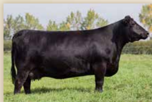
RP Black Licorice RLP 5Y Dam of Lot 51

CONNEALY CONSENSUS BRAZILA OF CONANGA 3991 839A S A V FINAL ANSWER 0035 E A ROSE 738 S A V NET WORTH 4200 CHAMPION HILL GEORGINA 2175 HF TIGER 5T HF LICORICE 19L