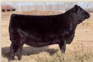
RDE Dolly RLP 12D Dam of Lot 59

HEIFER BULL 20G is a typical Crossfire son who carries the same traits of his sire, low birthweight, unbelievable length of body, smooth shoulders, pretty fronted and big testicular development. 20G is out of a big powerhouse SAV International cow. This is again another bull you can feel safe breeding your first time heifers too.