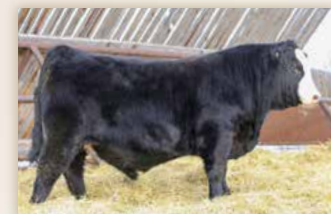
Maternal brother to Lot 55

Baldy alert! 2G is a real eye catcher. This bull is full of natural muscle, thickness and rib. His structure is very correct. The look of a typical Back in Black son, this bull has awesome hair and docility. Back