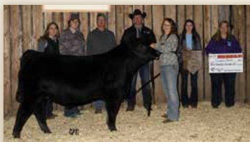
Lot 51 Champion Jackpot Bull Calf, Olds Fall Classic '19