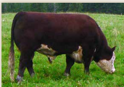
CHSF 52U BRIAN 5Y Sire of Lots 69 & 70