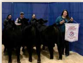
Grand Champion Pen of Bulls, Medicine Hat Pen Show '19

17G just continues to get better everyday. Another big highlight from our 2019 show string, 17G had a few titles to add to his name, he won his division in Armstrong in the Angus Show and was Reserve to 8G in his division at the Olds Fall Classic. He won his class in Lloydminster and was part of the Grand Champion Pen of bulls in Medicine Hat. 17G is very stylish bull, he's big boned, good haired, pretty fronted and good on his feet. Out of a Tiger 5T cow with a big middle and nice udder.