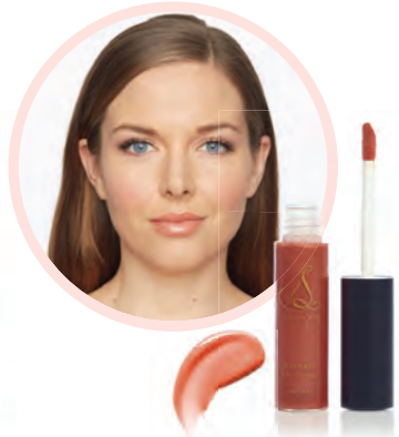
GARNET GLIMMER | SKU# MNG610