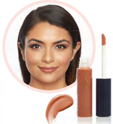
AMBER BEIGE | SKU# MNG606