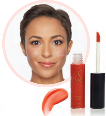
CORAL GLOW | SKU# MNG607