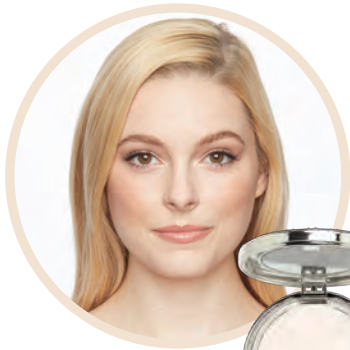
NATURAL IVORY SKU# MPF501

Extremely pale complexions with pink undertones.