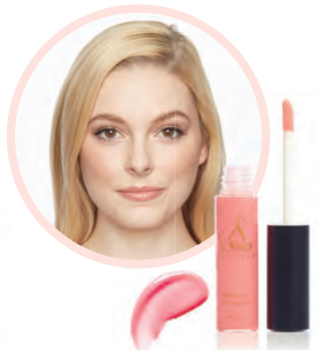
ROSE QUARTZ | SKU# MNG602