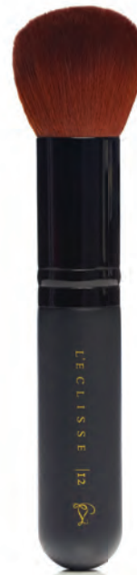
POWDER BRUSH SKU# BB7

Our large-handled flat top brush helps you master intense coverage and meets vegan standards.