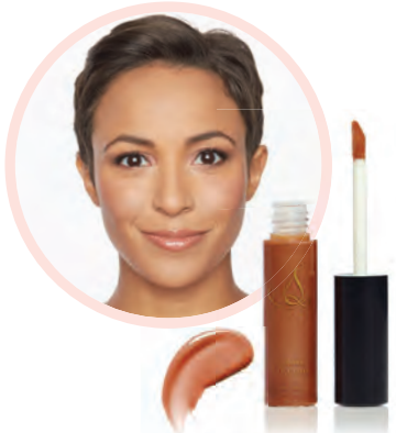
BRONZE SHIMMER | SKU# MNG609