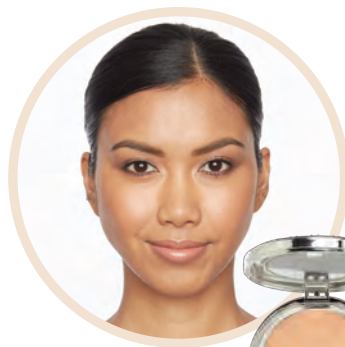
SATIN BRASS SKU# MPF507

Tan or medium dark with golden undertones.