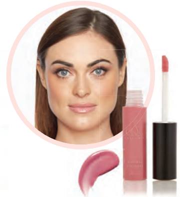
BERYL | SKU# MNG612