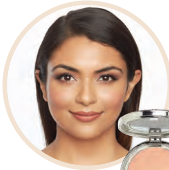
GOLDEN UMBER SKU# MPF508

Medium dark to dark with golden undertones.