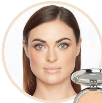
PALE GOLD SKU# MPF506