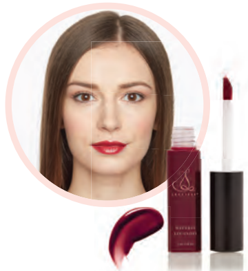
JASPER | SKU# MNG613