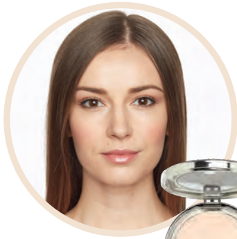
CREAMY PEARL SKU# MPF505

Warm light or warm fair with golden undertones.