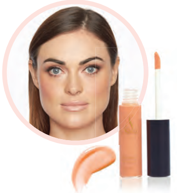
PINK PEARL | SKU# MNG605