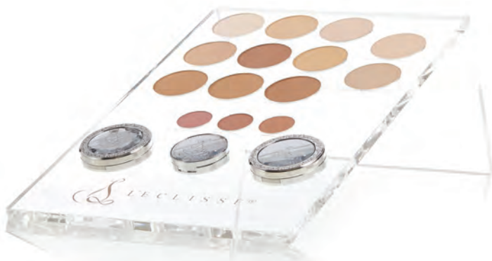
COSMETICS DISPLAY | 12"W X 21"D X 7"H* SKU# MPD901

Please see our order form for details. We welcome you to contact us for more information at info@leclissecosmetic.com .