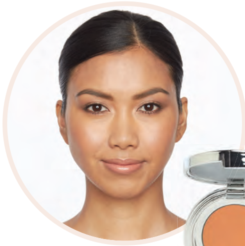
AMBER SKU# MPB801