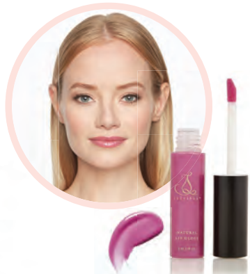
PINK MICA | SKU# MNG614