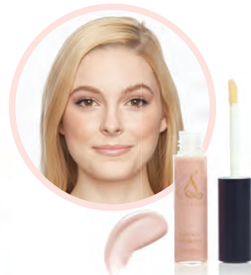
MOONSTONE | SKU# MNG604