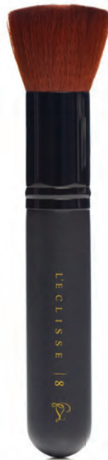
FLAT TOP BRUSH SKU# BB8

Enjoy full coverage and easy handling with this voluminous, long-handled brush.