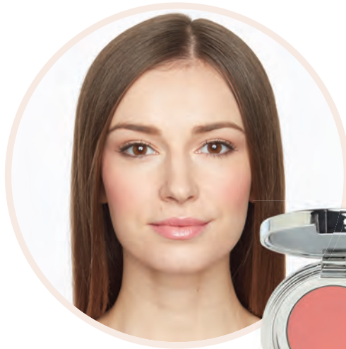
PINK SAPPHIRE SKU# MPB803