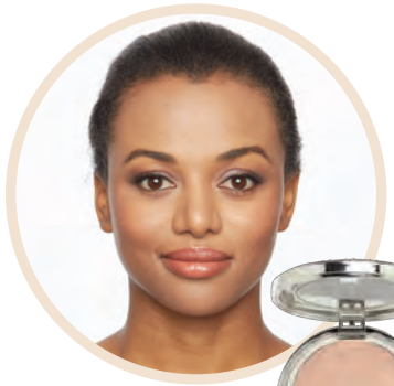
TERRA SKU# MPF504

Tan to darker skin with pink undertone / bronzer for skin with pink undertones