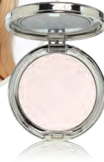
TRANSPARENT LIGHT SKU# MPP701