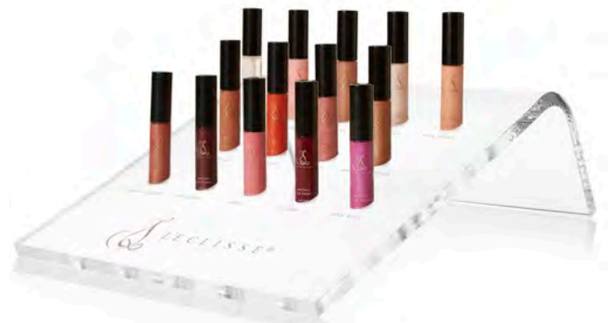
LIP GLOSS DISPLAY | 12"W X 14"D X 4"H* SKU# MPD902