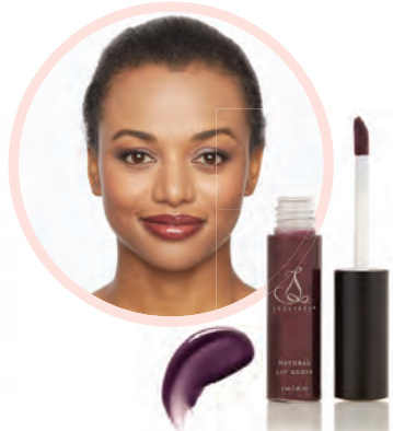
ALMANDINE | SKU# MNG611