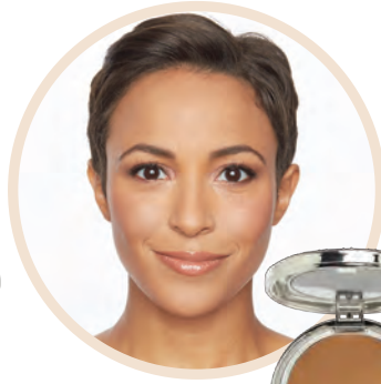
DEEP BRONZE SKU# MPF509

Dark with golden undertones. Ethnic complexions and everyday bronzer for all.