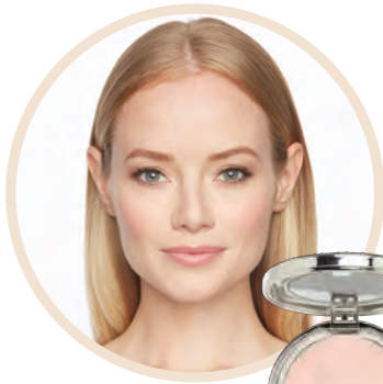
MARBLE ROSÉ SKU# MPF502