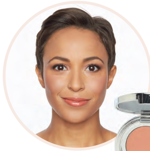
PINK CORAL SKU# MPB802