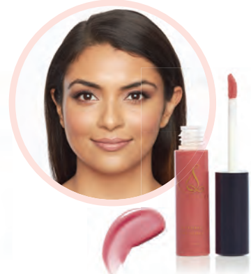
RUBEDO | SKU# MNG608