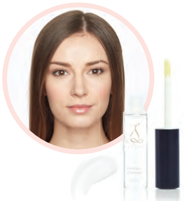
DIAMOND SHIMMER | SKU# MNG601