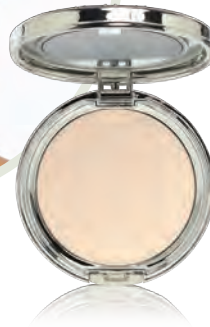
TRANSPARENT MEDIUM/DARK SKU# MPP702