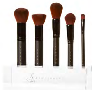
BRUSH DISPLAY | 8.5"W X 4"D X 2H (8.5"H including brushes)* SKU# MPD903