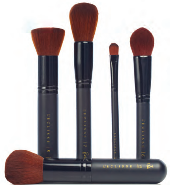
5 BRUSH SET SKU# BBS1

Blend and conceal expertly with our long-handled, flat and tapered vegan brush.