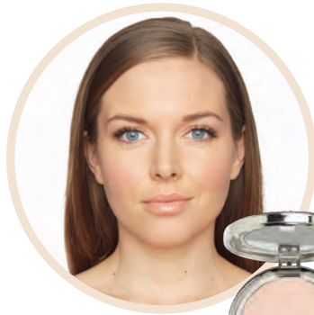
PINK SANDSTONE SKU# MPF503