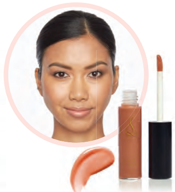
METEORITE | SKU# MNG603