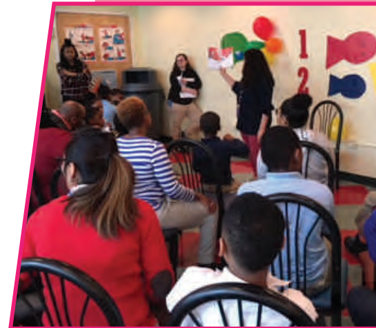
Students celebrate Dr. Seuss's birthday with interactive readings of Dr. Seuss's books.

We kicked off testing season with a spirit week that encouraged students and staff to have fun expressing themselves through different themes ranging from "crazy sock" day to "hero and villain" day. Also, this spring we held a family paint night, participated in a local Walk for Autism and held a music assembly.