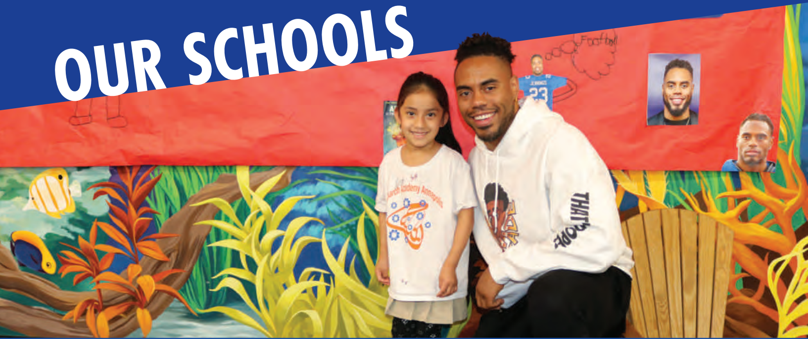
Above: NFL athlete, New York Times best selling author and Dancing with the Stars champion Rashad Jennings visited our schools to speak to students about education and the critical role that it has played in his journey to becoming an author and professional athlete.