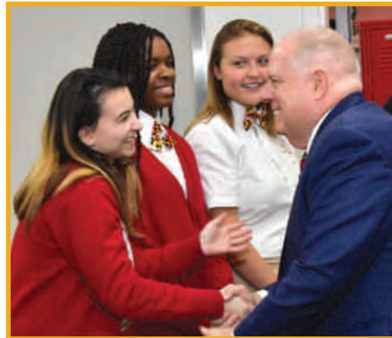
Governor Larry Hogan greets College Park Academy students.

College Park Academy is a highly successful college preparatory public charter school for grades 6-12 in Prince George's County. It serves 650 students, and 35% of its population comes from the College Park catchment area.