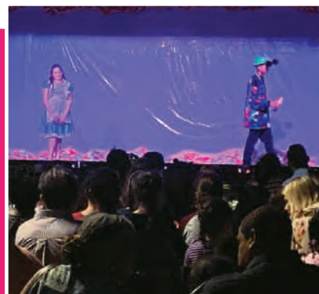
Above: Monarch Academy Glen Burnie students perform "Alice@Wonderland The Musical."

Monarch Academy Glen Burnie students performs "Alice@Wonderland The Musical." The contemporary play imagines Alice as a modern-day girl in the digital era who texts and tweets yet finds herself in the classic Wonderland of Lewis Carroll's original story.