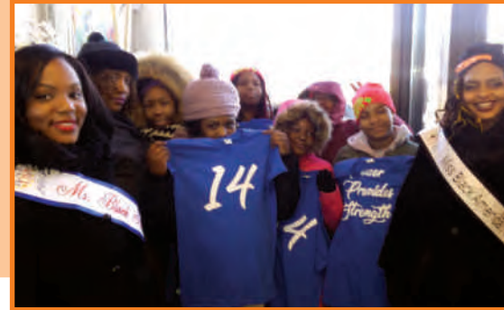
Above: Students meet Ms. and Miss Black America at the Annual Dr. Martin Luther King Jr. Holiday D.C. Parade.

From pumpkin picking to holiday decorations to a visit to an art museum, there are always activities happening at The Children's Guild DC Public Charter School.