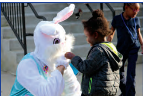
The Easter Bunny was the star of the show at Monarch Academy Annapolis Easter Egg Hunt.