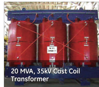
20 MVA, 35kV Cast Coil Transformer