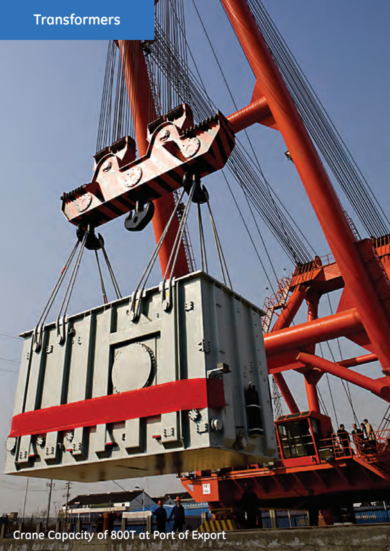
Crane Capacity of 800T at Port of Export