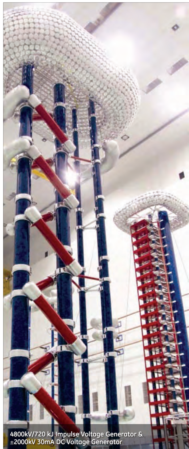
4800kV/720 kJ Impulse Voltage Generator & ±2000kV 30mA DC Voltage Generator