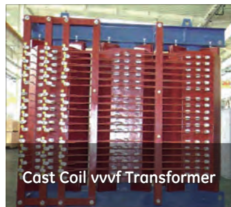
Cast Coil vvvf Transformer

Though standard cast resin dry type transformers can meet the demands of most applications, special designs can be developed for single phase transformers, isolation transformers, rectifier transformers, grounding transformers and transformers with special tapping arrangements.