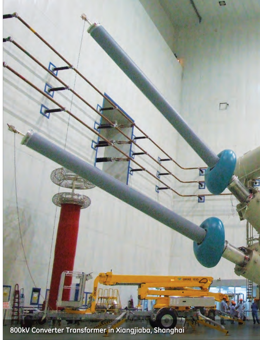
800kV Converter Transformer in Xiangjiaba, Shanghai