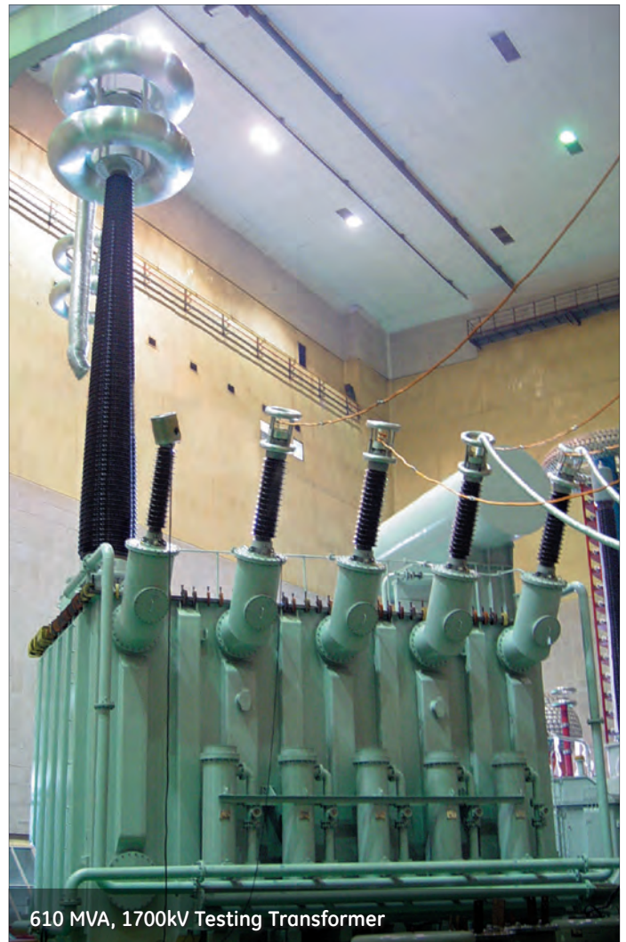
610 MVA, 1700kV Testing Transformer

Shunt reactors are core to XD|GE's portfolio, with more than 600 units installed, at 500kV or higher, in various regions around the world. As part of XD|GE's ongoing initiatives for continual product improvement, extensive research on shunt reactors has resulted in an improved core design. These improvements have reduced the total losses to less than 100kW,