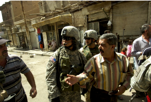
Local ownership of local solutions is one of the watchwords of counterinsurgency doctrine.

or companycommander.com phenomenon at the beginning of the Iraq War, where junior leaders blogged in real time, sharing valuable ideas and lessons learned. Only a handful of irregular warfare enthusiasts are currently aware of the existing program; the center, whatever form it eventually takes, should be actively and aggressively promoted throughout the service academies, civilian universities, the Foreign Service Institute, the intelligence community, and at regular conferences and seminars.