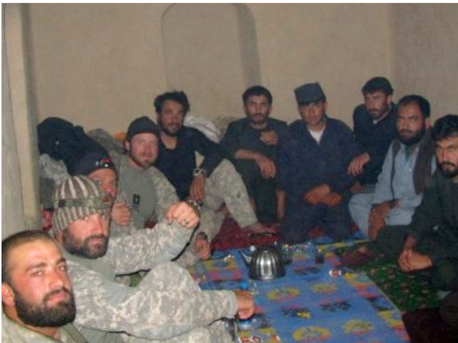
U.S. Special Operations Forces are experts at working by, with, and through the local populace.

Police/ investigative skills: The increasingly destructive potential of proliferated technology in the hands of terrorists is rapidly stripping away any margin of error. Much like the protagonists in the movie Minority Report , our national security professionals are placed in the precarious position of trying to disrupt terrorist plans before they can be executed, rather than gathering evidence after the fact. As a liberal democratic society, the U.S. cannot easily lower the burden of proof in such