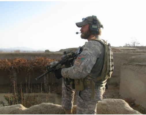
Representatives from myriad national security agencies must be adaptive leaders in today's threat environment.

vice versa. Although the former is necessary in the sprawling bureaucracies of the Departments of Defense (DOD), Homeland Security (DHS), Justice (DOJ), and State (DOS), strategic leadership must permeate these organizations. Leadership does not begin at the Senior Executive Service (SES) level. Rather, leaders with vision, adaptability, and fluency with the interagency process must emerge at all levels. The Marine Corps' successful Strategic Corporal concept is but one example of what can be accomplished when leadership training and the attendant responsibility are pushed to the lowest levels of an organization.