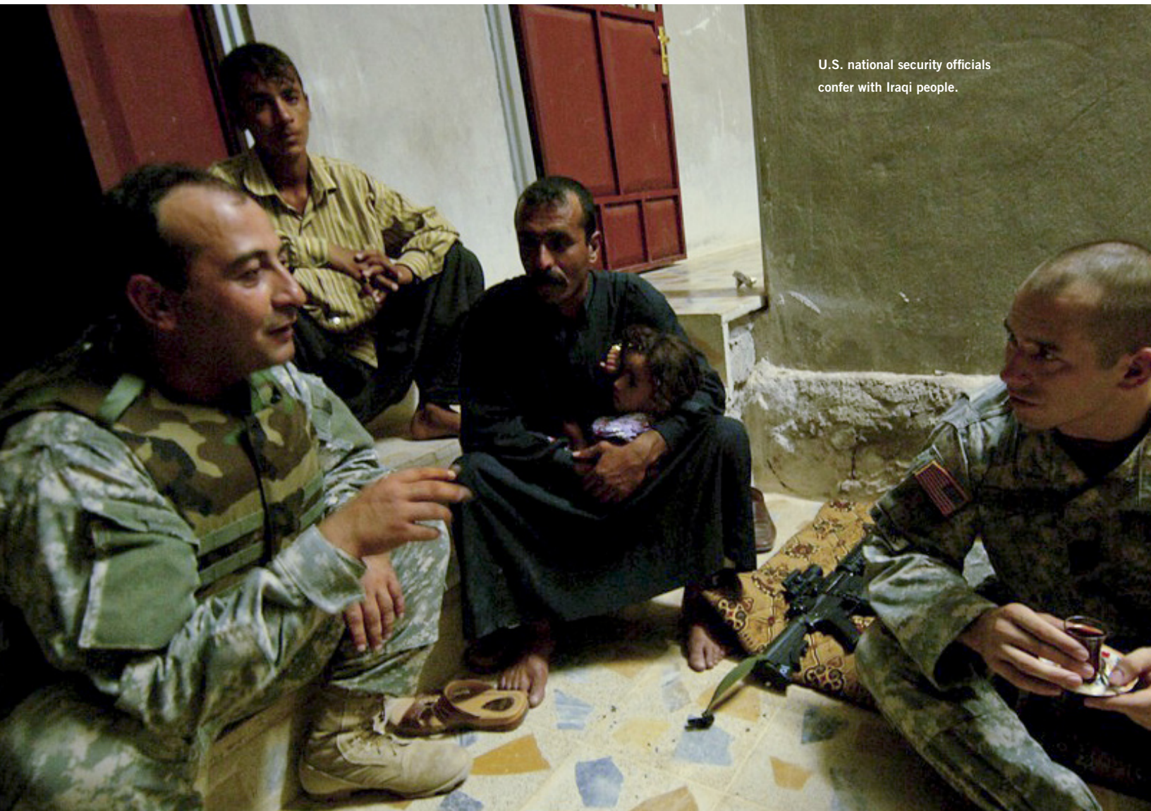
U.S. national security officials confer with Iraqi people.

Irregular warfare is principally a decentralized endeavor. The battlefield, if it can even be called that, is too complex, too heterogeneous for universal plans. Leaders at the lowest level must be trusted to receive strategic guidance—a “mission type order” with minimal details—then determine the best way to proceed and cooperate with their counterparts. Yet this type of leadership does not come easily, and many individuals who might have excelled in a more directed environment will founder in these conditions. Leaders must possess great adaptability, creativity, and the intellectual ability to be a great chess player, overseeing multiple efforts and outcomes. Existing recruiting, training, promotion, and retention regimes do a very poor job of ensuring these types of leaders end up doing the most critical jobs.