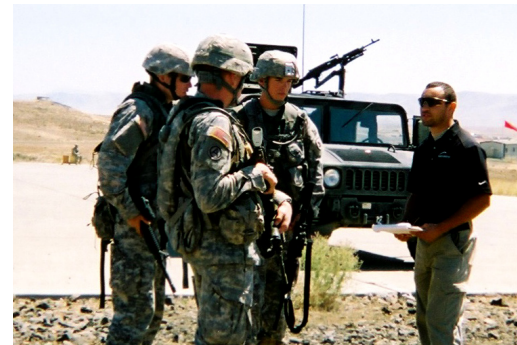
Soldiers and a defense contractor participate in a training exercise.

Center for lessons learned. The Center for Army Lessons Learned model has evolved into a highly effective feedback system that incorporates that latest lessons from the battlefield, synthesizes them, and develops products (handbooks, diagrams, reference cards, etc.) for use throughout the force. The State Department, USAID, and the Department of Defense should have a major role in developing and sharing this mechanism. The newly created Consortium for Complex Operations (CCO) is a positive step, but it is still largely the domain of pure academics, educators, and administrators. A lessons learned mechanism, tied directly to professionals in the field, must be established to keep the information relevant and timely—a program akin to the web blog known as platoon leader.com