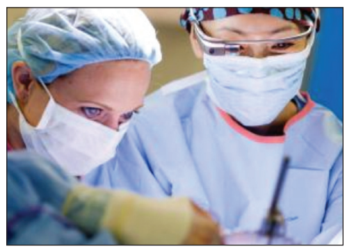
Use of glass technology allows simultaneous projection of surgery to an external monitor and recording of the case for teaching purposes.