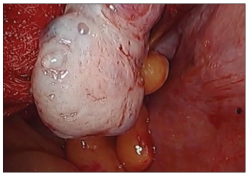
Use of a scope, such as a cystoscope or VITOM Exoscope, provides magnification and illumination deep in the pelvic cavity.

simultaneous projection and recording of the procedure to an external monitor (FIGURE 6). Google Glass is a wearable computer with an optical head-mounted display. The device, similar to eyeglasses, is voice-activated, thereby allowing the surgeon to record the procedure hands-free. Simultaneous projection to an external monitor allows the entire team in the operating room to be aware of the flow of the procedure.