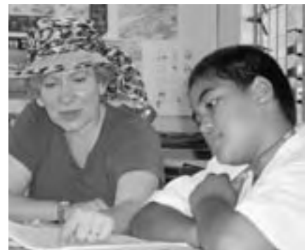
A Global Volunteers senior participating in a Cook Islands literacy project.