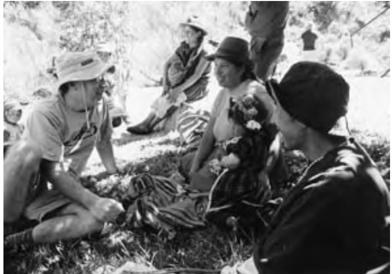
A Culture Xplorers traveler chats with a Quechua villager, after an Earth Offering ceremony.

Just after landing in Luang Prabang I walked along the Mekong river before turning in for a much-needed nap. I brought along my camera looking for atmospheric scenes of river life. When I spotted a wiry, deeply tanned, barefoot man and his wife unloading bundles of firewood from their