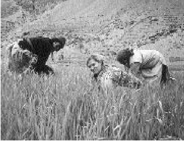
Working with her hosts in Lingshed helped this Crooked Trails traveler deepen her cultural exchange.

transformational adult learning in the high himalayyas