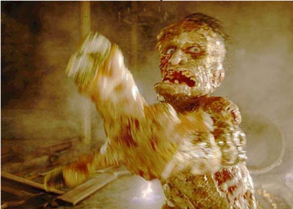
Grendel- a face only a mother could love.

So mankind's enemy continued his crimes, Killing as often as he could, coming Alone, bloodthirsty and horrible. Though he lived In Herot, when the night hid him, he never Dared to touch king Hrothgar's glorious Throne, protected by God—God, Whose love Grendel could not know. But Hrothgar's Heart was bent. The best and most noble Of his council debated remedies, sat In secret sessions, talking of terror And wondering what the bravest of warriors could do. And sometimes they sacrificed to the old stone gods, Made heathen vows, hoping for Hell's Support, the Devil's guidance in driving Their affliction off. That was their way, And the heathen's only hope, Hell Always in their hearts, knowing neither God Nor His passing as He walks through our world, the Lord Of Heaven and earth; their ears could not hear His praise nor know His glory. Let them Beware, those who are thrust into danger, Clutched at by trouble, yet can carry no solace In their hearts, cannot hope to be better! Hail To those who will rise to God, drop off Their dead bodies and seek our Father's peace!