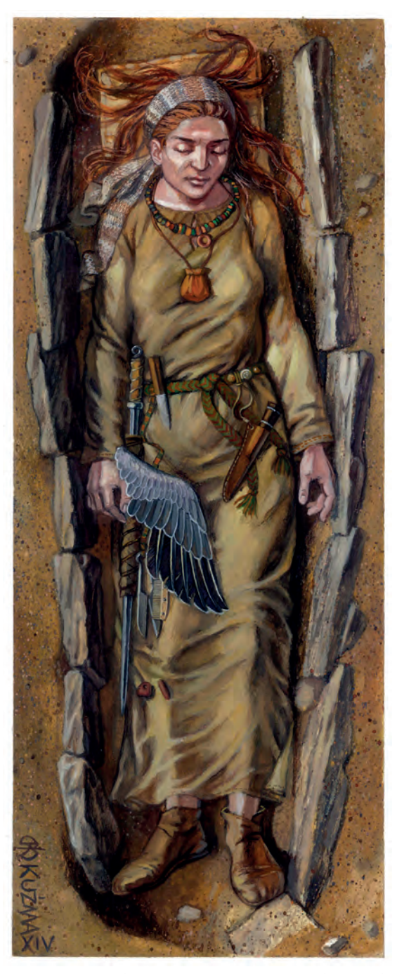
Fig. 11. Artistic reconstruction of the 'Pagan Lady' grave . Drawing by Mirosław Kuźma. © Leszek Gardeła and Mirosław Kuźma.