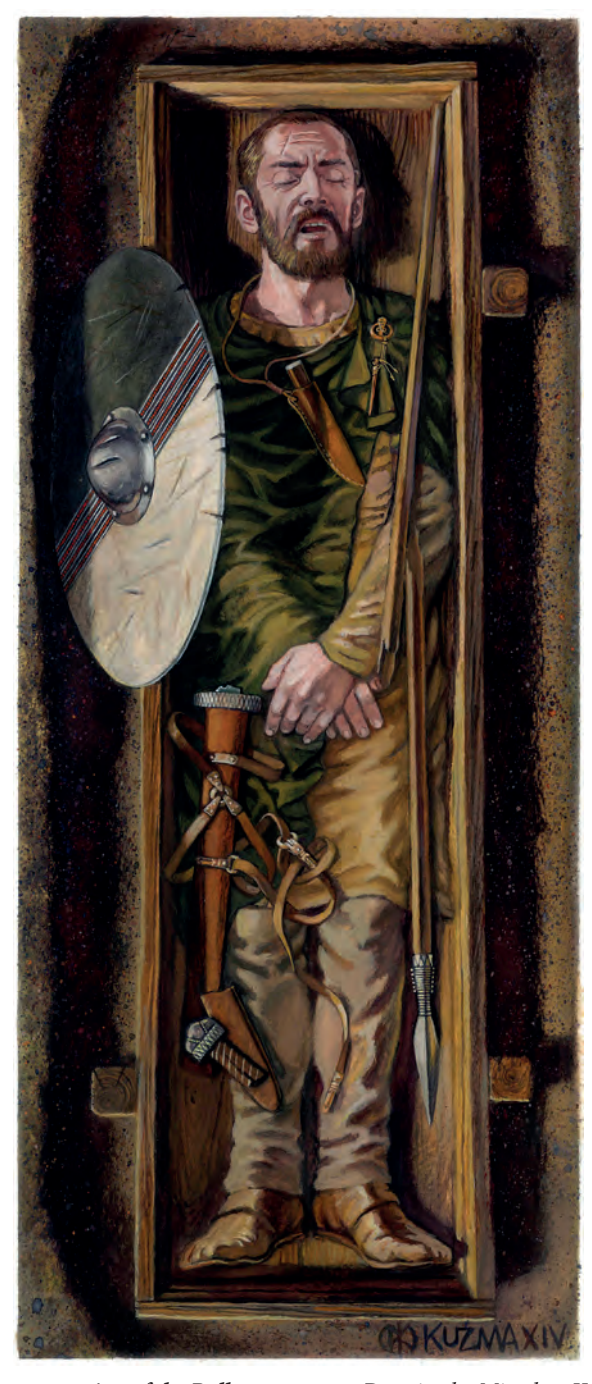
Fig. 10. Artistic reconstruction of the Ballateare grave. Drawing by Mirosław Kuźma.