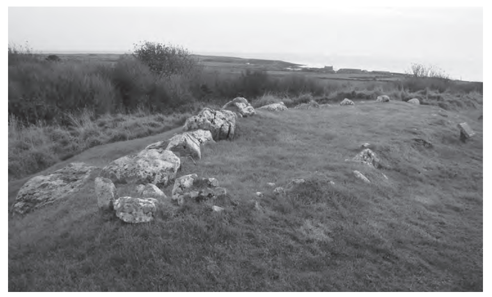
Fig. 3. The Balladoole grave.

dating to the 9<sup>th</sup>-10<sup>th</sup> century was found. The boat was originally around 11m long and contained the body of an adult man accompanied by a wide array of high-status objects (see Chapter 5 for further details). Many of these splendid finds can be seen in the Manx Museum, but the actual site of the burial is well worth visiting as it lies on top of Chapel Hill, occupying a prominent position in the landscape and offering a magnificent view of the Irish Sea coast. Today the exact location of the boat grave has been outlined by stones. Visitors to the site can also see other archaeological features, such as the remains of a Celtic rampart and an early Christian chapel. ( fig. 3 )