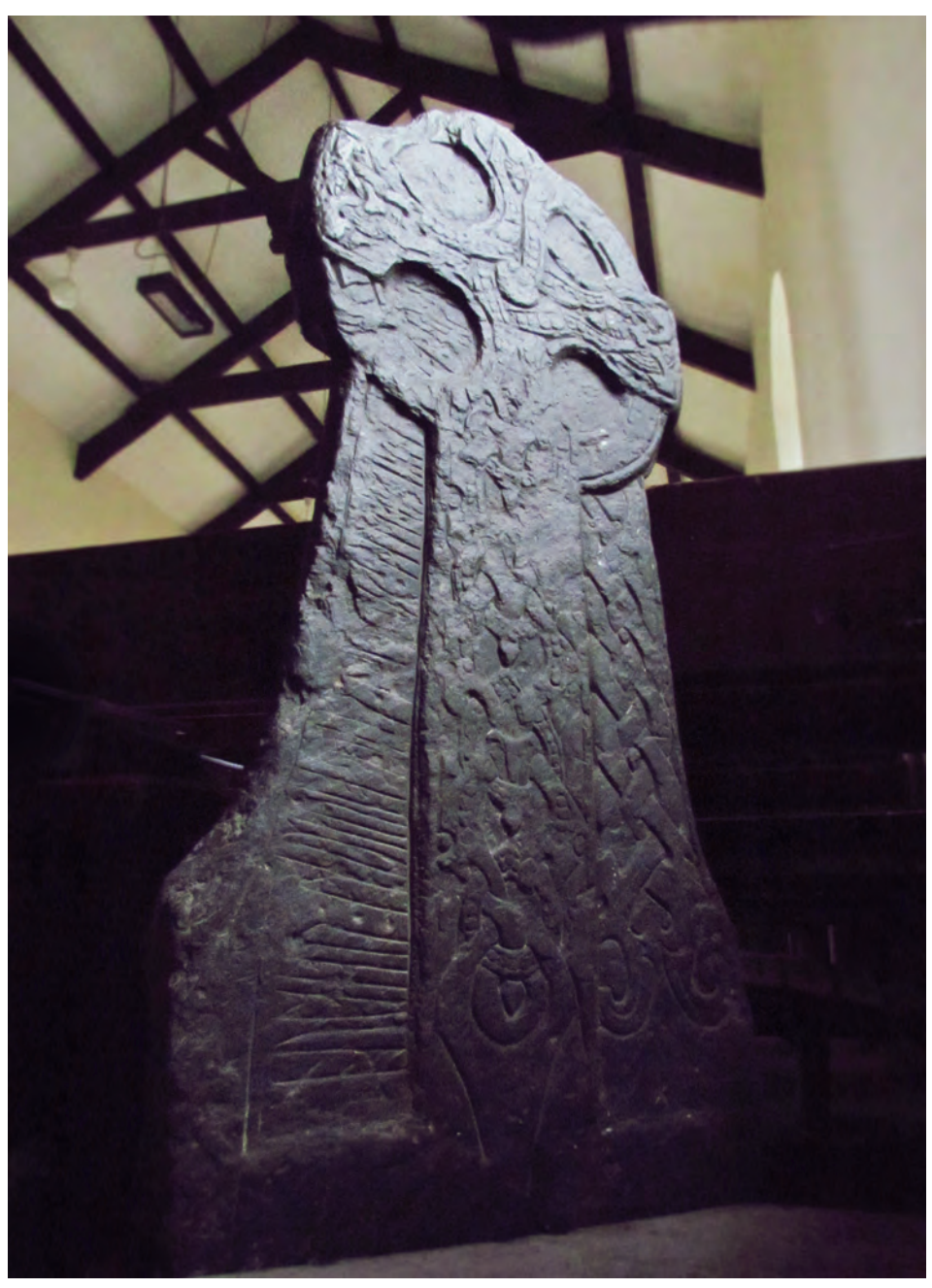
Fig. 4. Ballaugh 106.