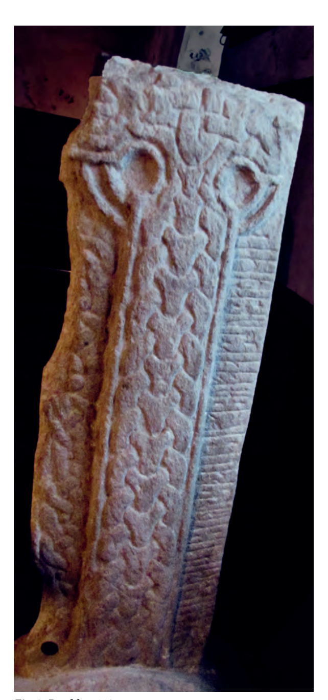
Fig. 2. Braddan 112.