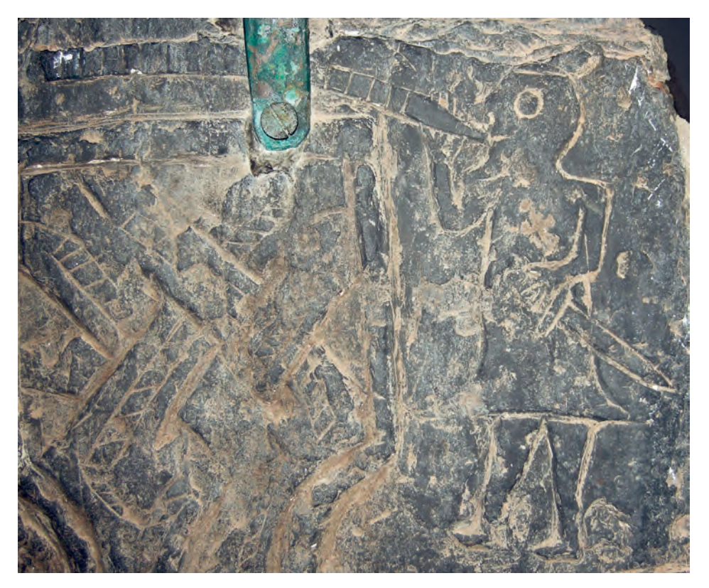
Fig. 7. Jurby 127.

This is also known as 'Thor's Cross'; some researchers have seen various myths involving the god Thor in its ornamentation. On one side of the cross, below the circle to the right, a man with a beard and a belt is depicted who might be Thor, the redbearded god. Thor is the son of Odin and Jord (Earth), the guardian of the gods, and