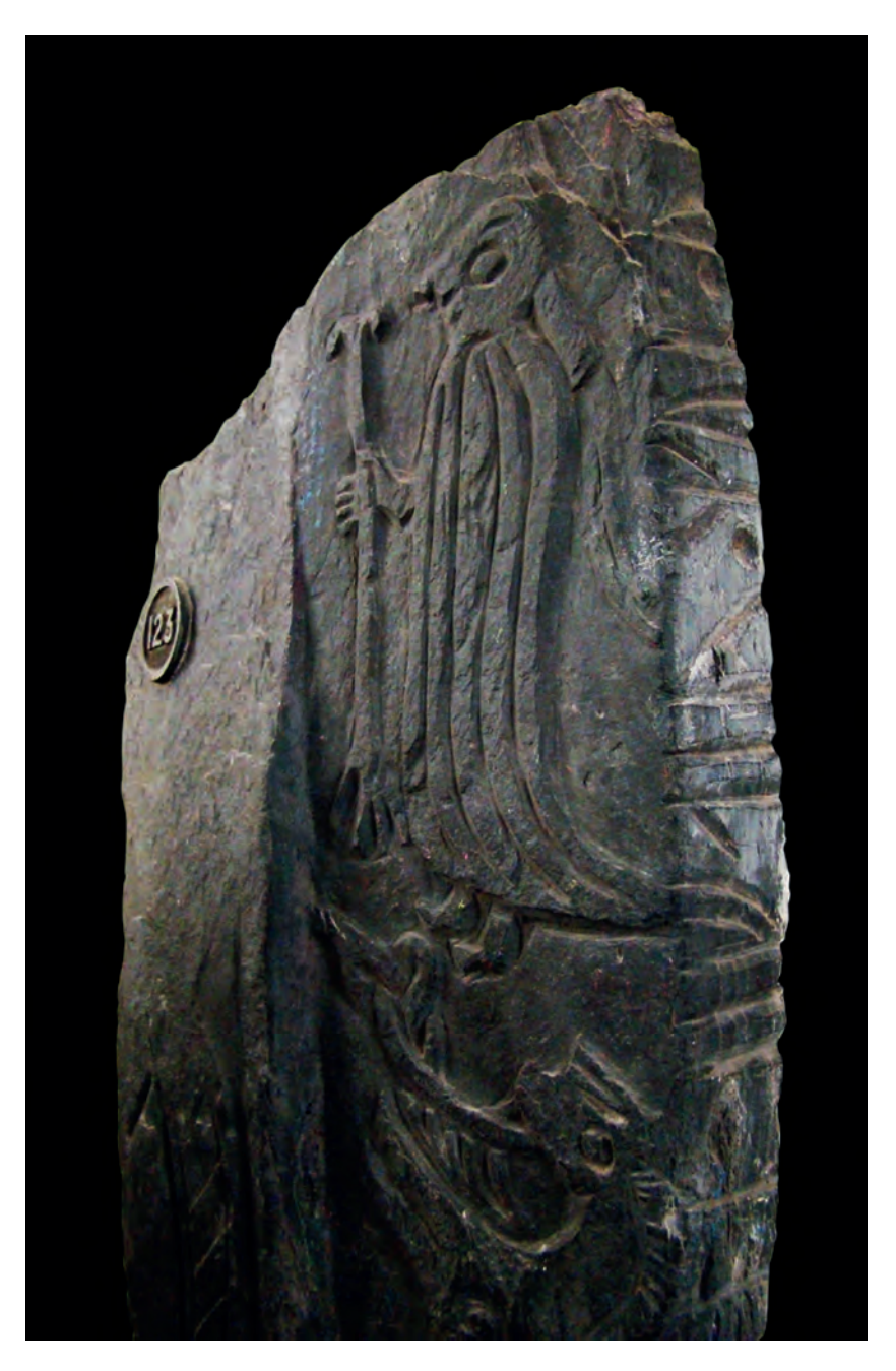
Fig. 8. Michael 123.