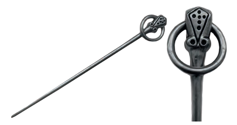
Fig. 12. Replica of the Ballateare ringed-pin by Grzegorz 'Greg' Pilarczyk and Kamil Stachowiak. Commissioned by Leszek Gardeła.