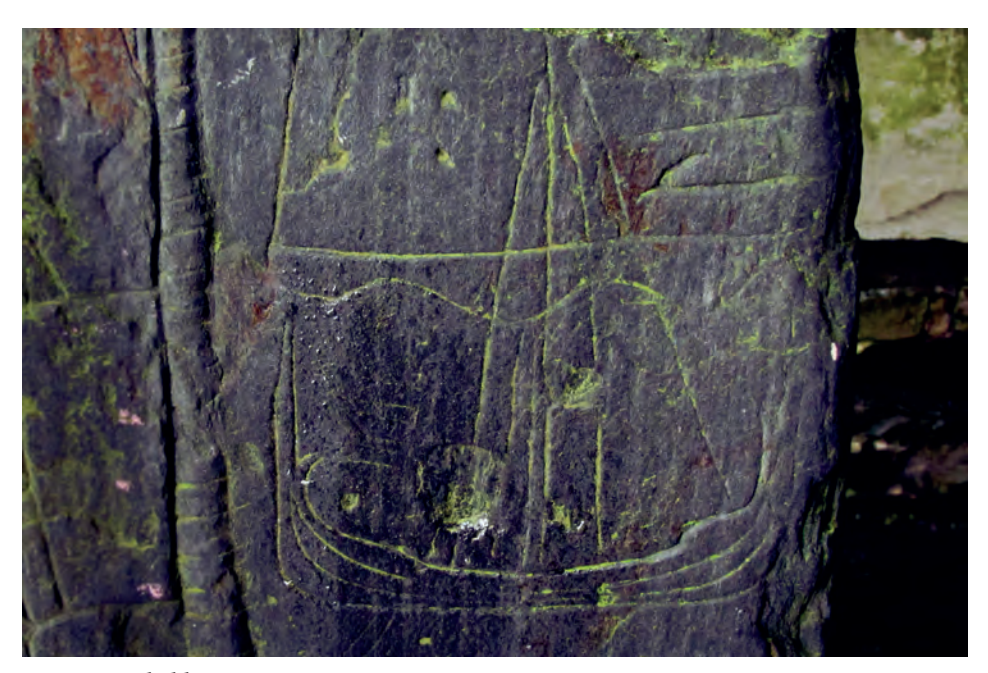
Fig. 6. Maughold 142.

The cultural richness of these stones and their inscriptions is unique to the Isle of Man, and are some of the many reasons that make the Island well worth studying and exploring.