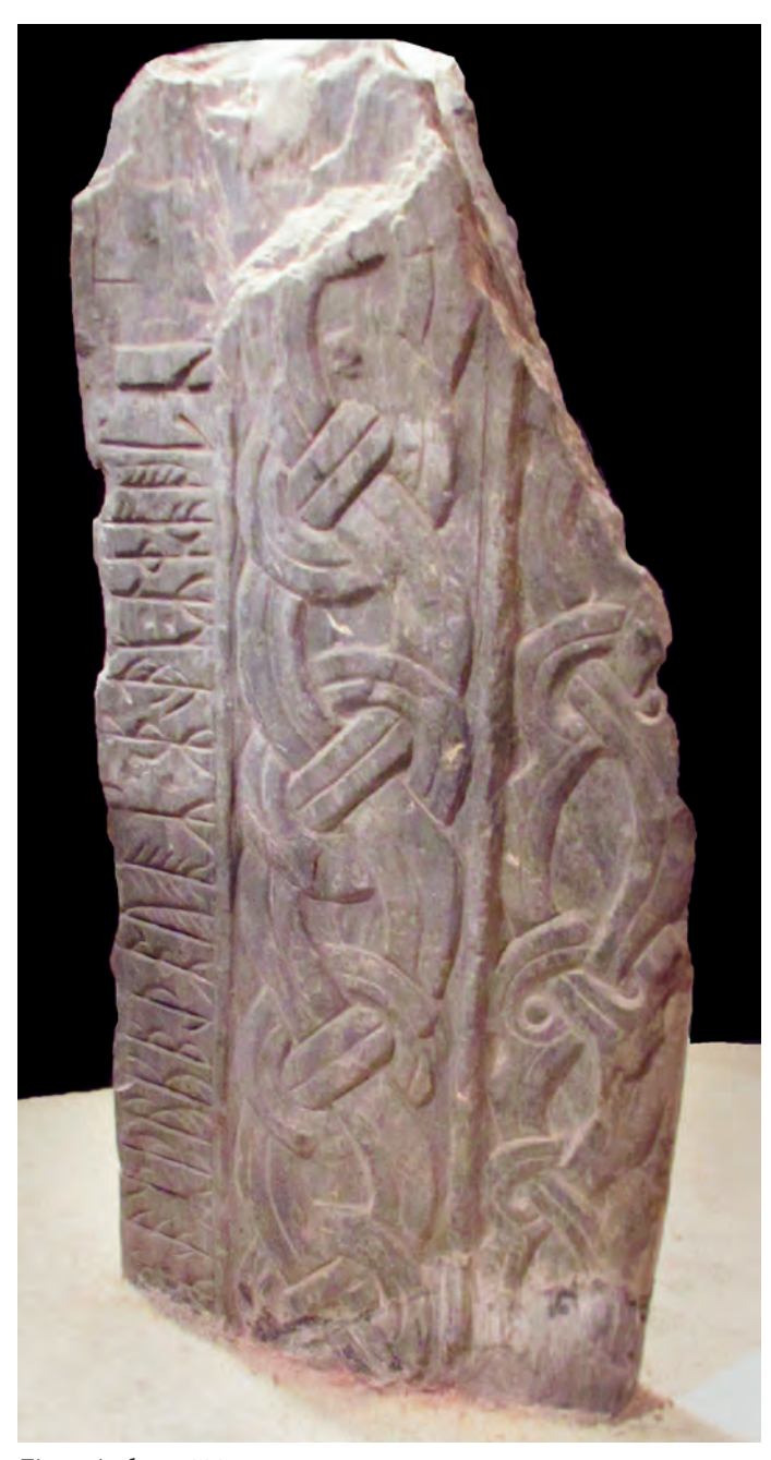
Fig. 5. Andreas 111.