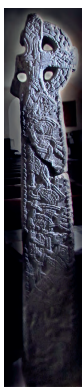
Fig. 1. Braddan 135.