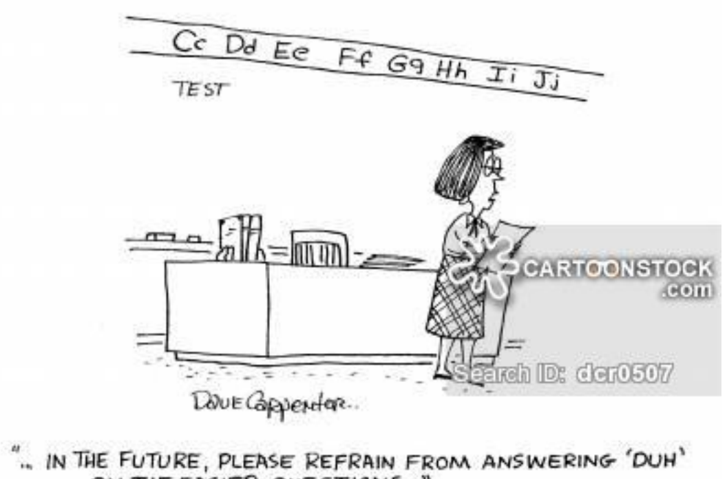
THE EASIER QUESTIONS. "

In this case, the specificity of the word makes it impossible to find an onomatopoeic equivalent in Spanish, and adapting its spelling would produce a word that made no sense whatsoever to Spanish people. The best solution for duh , therefore, would be to translate it as a word with the same meaning, such as "obviamente", "es obvio", "naturalmente", or even "no soy estúpido". In Figure 3 , for instance, the teacher's words could be translated as "De ahora en adelante, por favor, absteneos de contester 'es obvio' a las preguntas más sencillas." This way, we manage to maintain the same meaning and make it understandable for the reader.