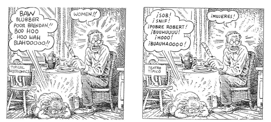
Figure 2: Robert Crumb, My Troubles with Women I, II in Valero Garcés, 2008, p. 242

popular strategy that has also been favoured by the influence of English in comic books is the adaptation of the form in the source language to the spelling of the target language. This already happens between English and Spanish with onomatopoeia like sniff , which are translated as "snif" or "esnif". In Figure 2 , as appears in Valero's article, it can be observed how unusual English onomatopoeic forms like baw blubber have been substituted by other English forms adopted in our language, such as "snif" (2008, 242). In some cases, the influence is so strong that English onomatopoeia end up substituting the Spanish form almost completely. Such is the case of oink , the form used for the sound of pigs, where the Spanish equivalent "ein" has been replaced by the form "oinc", adapted from English<sup>1</sup>.