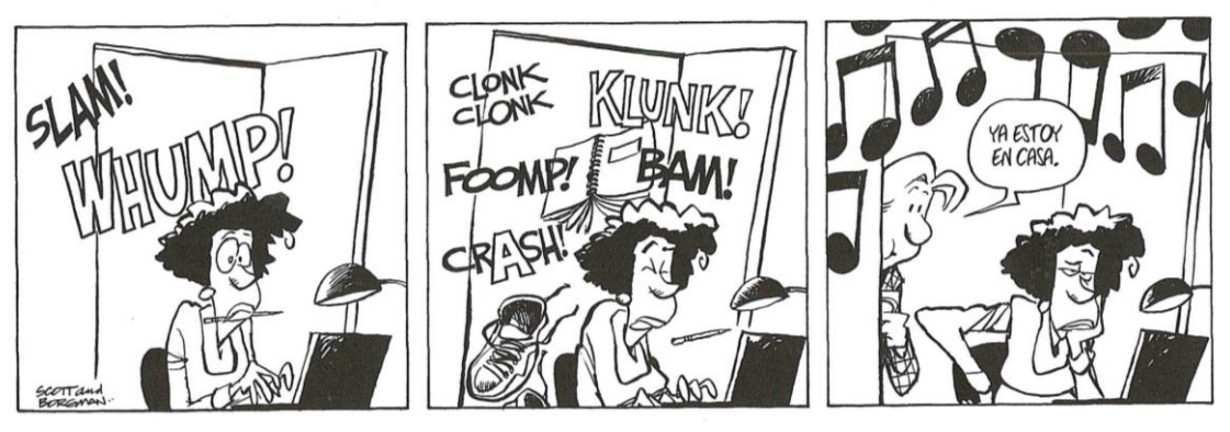
Figure 1: Jim Borgman and Jerry Scott, Zits vol. 3, 2002, p. 16

When the onomatopoeic form is in literary texts, the approach changes completely. According to Valero Garcés, it is easier in English to create nouns and verbs from onomatopoeic forms because English is a more dynamic language (2008, 239) and, therefore, formal texts in English novels, for example, can include onomatopoeia without affecting their tone. In Spanish, however, onomatopoeic forms make the text sound more colloquial. Take, for instance, the moment in Clive Barker's novel Abarat when it says: "She'd no sooner spoken than there was a deep resonant boom in the air, which shook the snow down from all the branches and blossoms in the vicinity" (2006, 20). If the word "boom" were to be translated into Spanish as "bum", the sentence would acquire a colloquial tone that the original is not seeking. Therefore, most Spanish translators would opt for a word like "explosión" or "detonación", since Barker uses the English onomatopoeic form as a noun. The same happens with other forms such as crash, slam and bang, which translators generally render with "choque", "portazo" and "disparo", respectively. Hence, when translating a literary or more formal text, Spanish onomatopoeia should be avoided except in the case of translating a dialogue, a book for children or a piece in which the sound of the words plays an important role.