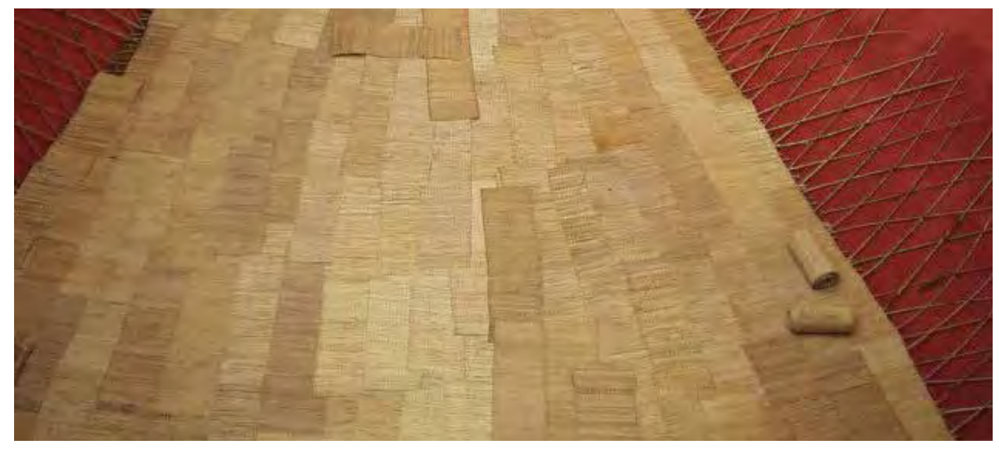
Figure 3.2 | A cargo hold being prepared to transport a consignment of bagged rice. Note the vessel's tank top being lined with cross bamboo sticks and bamboo matting lay atop.