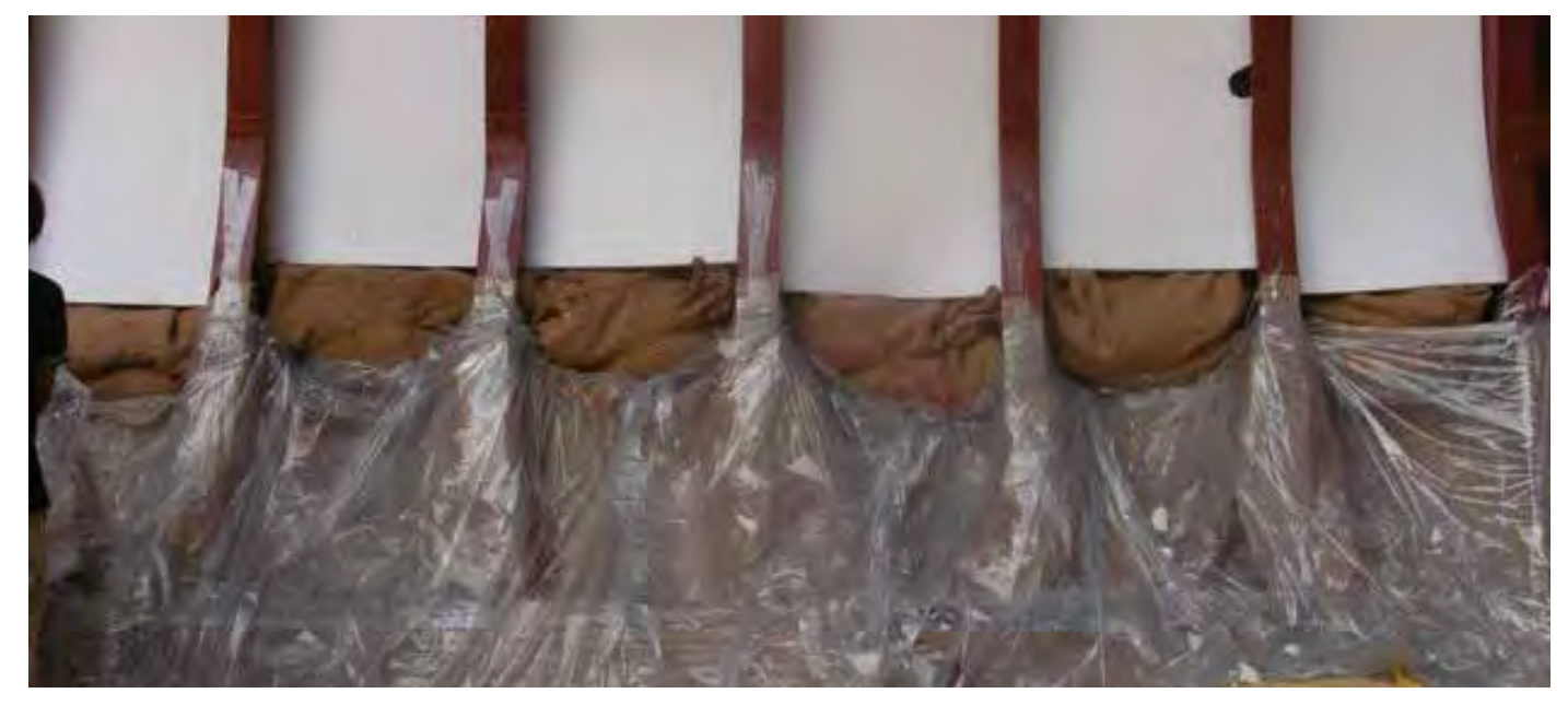
Figure 3.18 | Saw dust in burlap bags is inserted at transition point between sideshell and the top of the hopper tank.