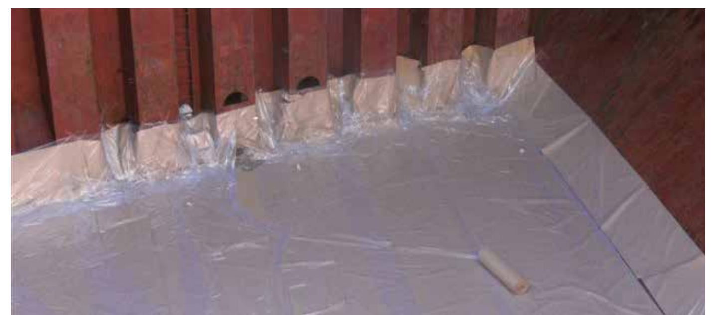
Figure 3.5 I The cargo hold top tank, base of the transverse corrugated bulkhead and base of the hopper tank top have been lined with kraft paper overlaid with clear plastic sheeting.