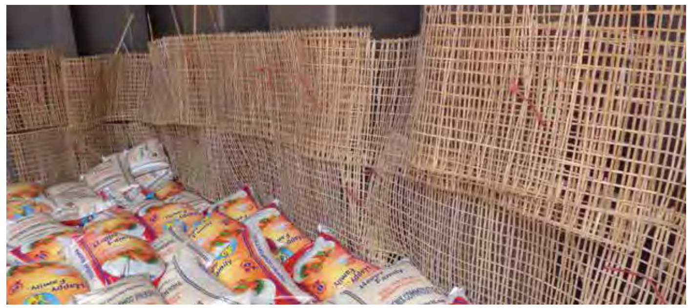
Figure 3.3 | Bamboo mat dunnage placed along a corrugated transverse bulkhead.