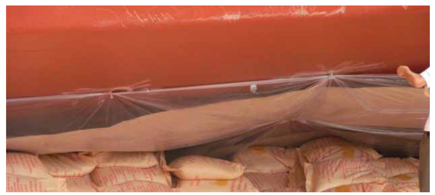
Figure 3.12 | Cargo loaded to the foot of the hatch coamings. Note the kraft paper covered by plastic sheeting on the top sloping tanks.