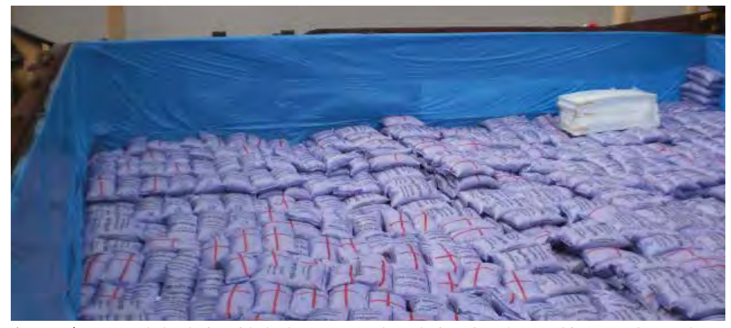
Figure 3.14 I Cargo is stacked to the foot of the hatch coaming. Note the stack of Styrofoam sheets used for insertion between the hatch coaming and plastic sheeting.