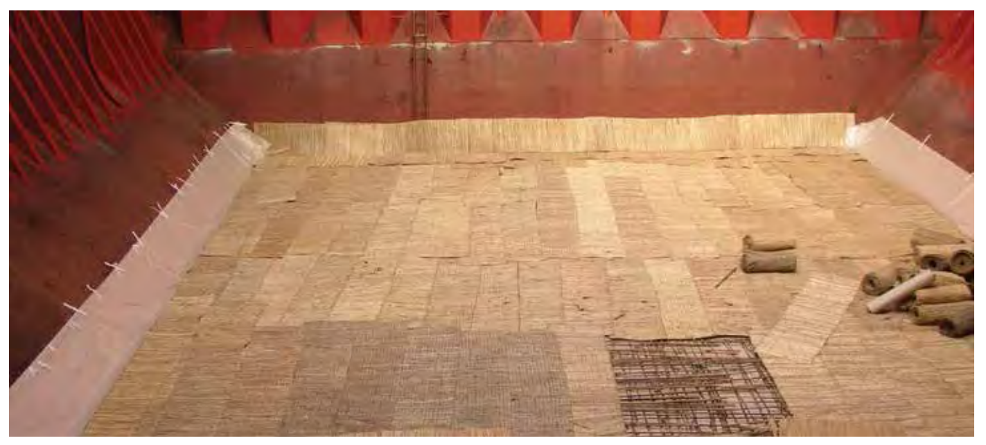
Figure 3.1 An example of a cargo hold being prepared for the transport of bagged rice. Note the vessel's tank top being lined with cross bamboo sticks and bamboo matting lay atop. Kraft paper is used for lining the hopper tanks.