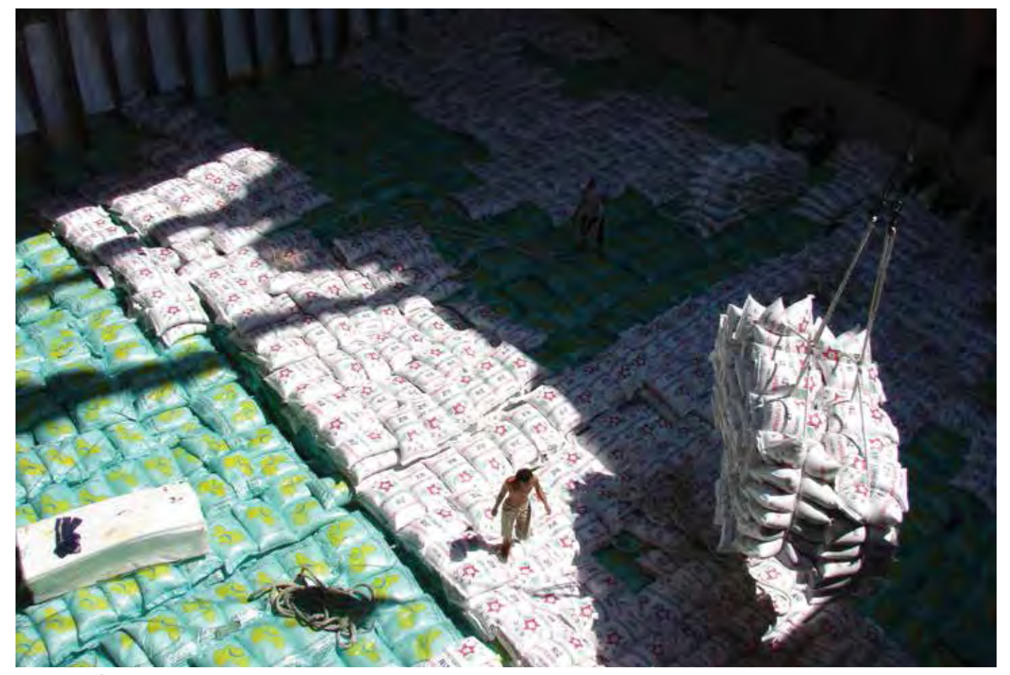
Figure 4.1 I Stevedores loading and stacking bags with ventilation channels between stows. In the background, note the Styrofoam covered by plastic along the sideshells.