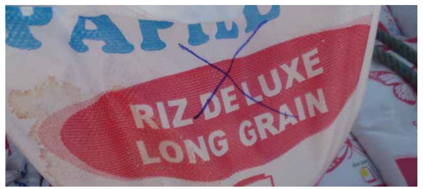
Figure 1.7 | Water damage on a rice bag resulting from the accumulation of condensation.