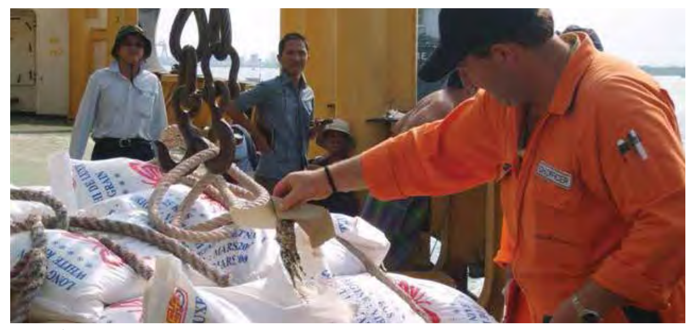
Figure 1.4 | Cargo surveyor removes a rodent from a rice bag.