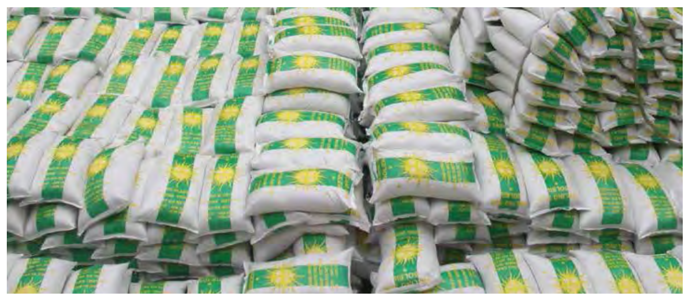
Figure 4.8 I Note in the center foreground of the picture the bags laid across the ventilation channel running left to right interlocking the tiers. This is done so to stabilize the stacks of cargo preventing collapse and shifting of stacks.