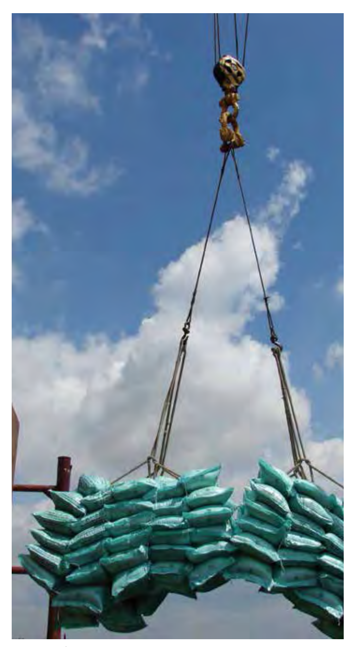
Figure 4.3 I Bundles of rice being hauled overboard to be tallied and placed in the cargo hold.