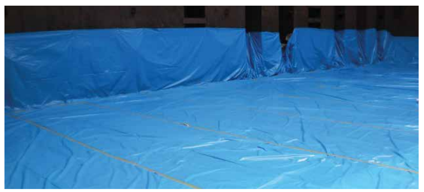
Figure 3.9 | Kraft paper overlaid with plastic sheeting on the tank top and continue vertically along the corrugated transverse bulkhead.