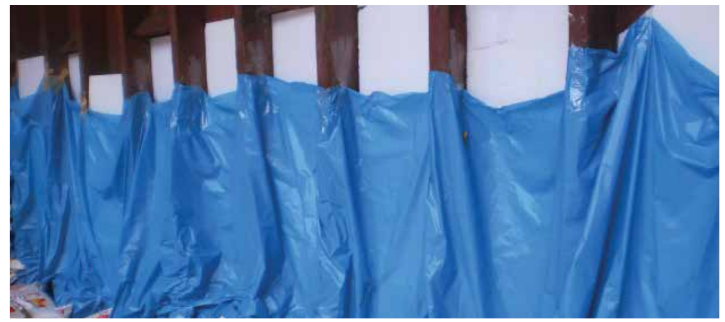
Figure 3.7 | Styrofoam laid between sideshell frames and then overlaid with blue plastic sheeting.