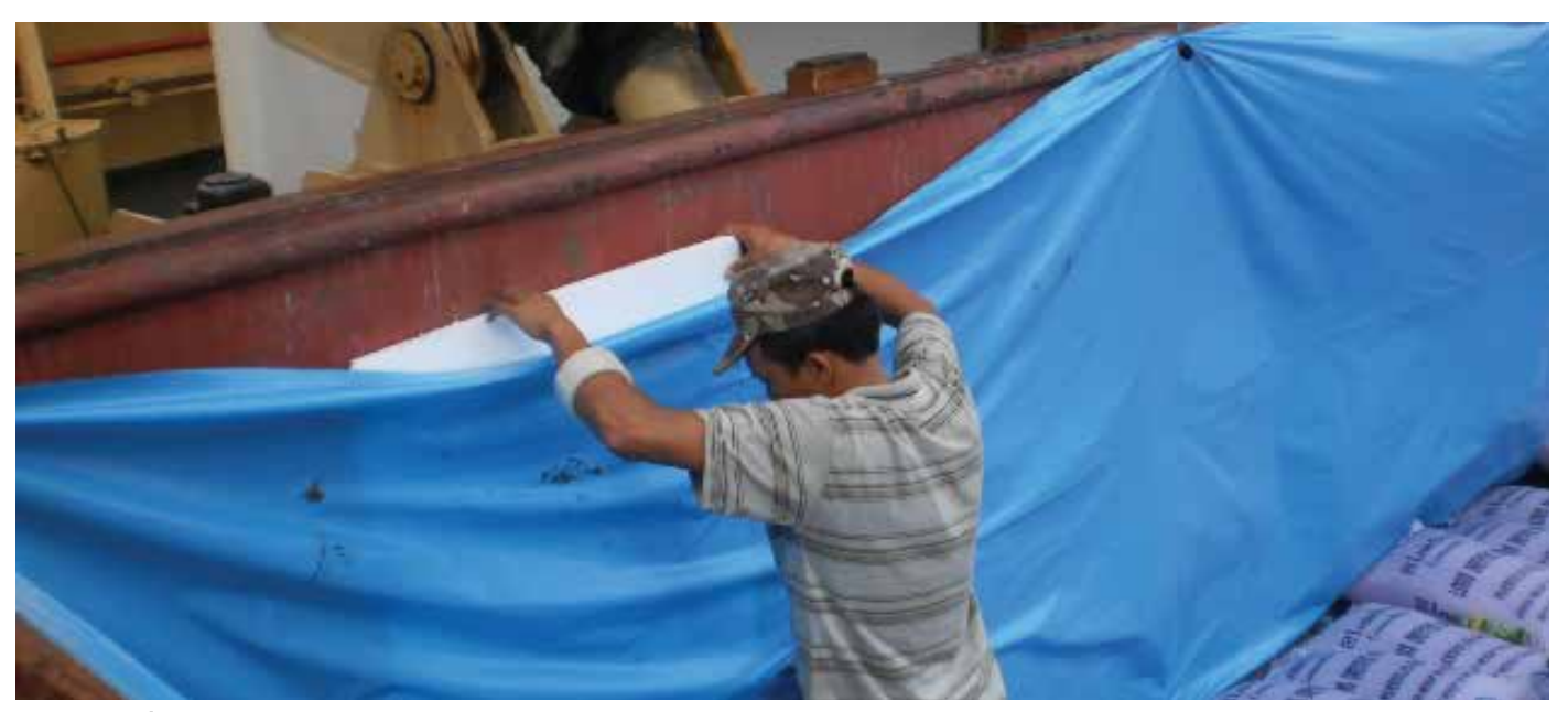
Figure 3.13 | Stevedore inserting Styrofoam sheet between hatch coaming and plastic sheeting.