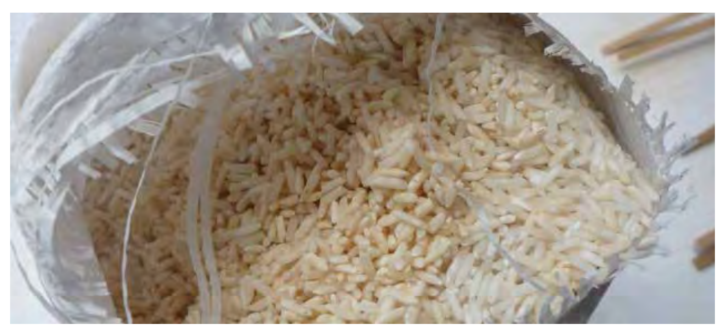
Figure 1.1 | Caked rice as a result of water damage.