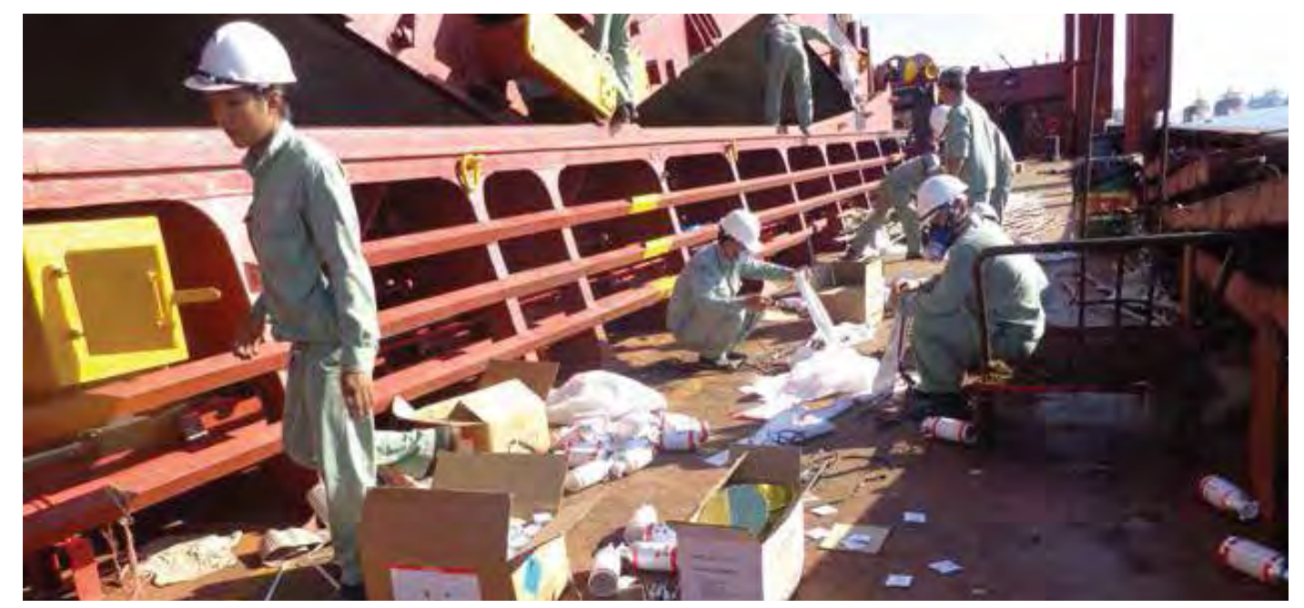
Figure 4.6 | Pesticides used for fumigation being dispersed into cargo holds.