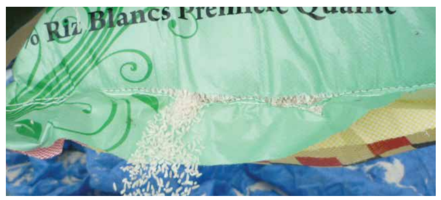
Figure 1.5 | A bag of rice damaged and torn as a result of rough handling.