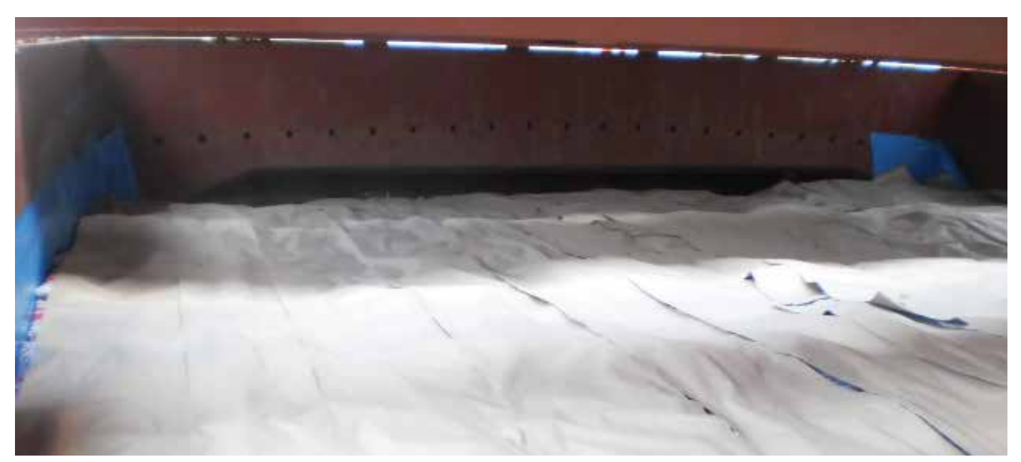
Figure 3.15 I Cargo is loaded to the foot of the hatch coaming and covered with kraft paper. Also note the plastic sheeting protruding out of the sloping wing plates and taped to the hatch coamings.