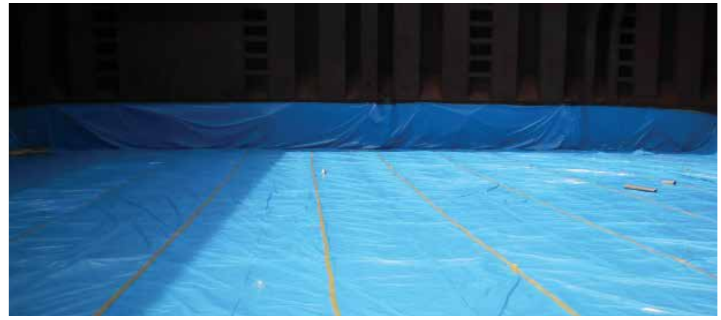
Figure 3.6 I Kraft paper overlaid with plastic sheeting on the tank top. This continued vertically along the corrugated transverse bulkhead in background.