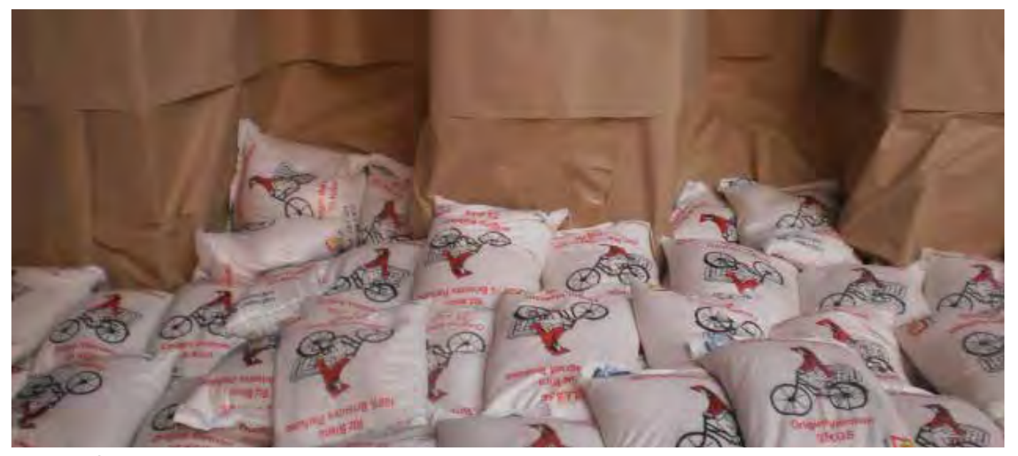
Figure 3.10 | The transverse bulkhead in the background is covered with kraft paper. Note how bags are placed tightly into the bulk head. No space is wasted.