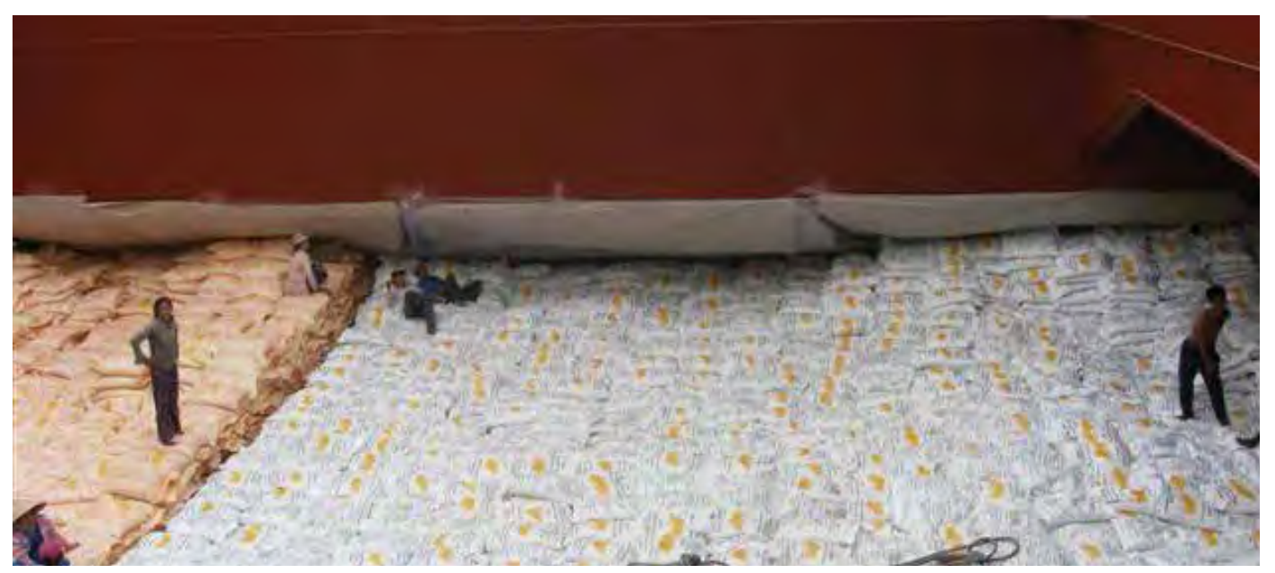
Figure 3.11 | Note the kraft paper covered by plastic/polyethylene sheeting on the top side of the top sloping tanks.