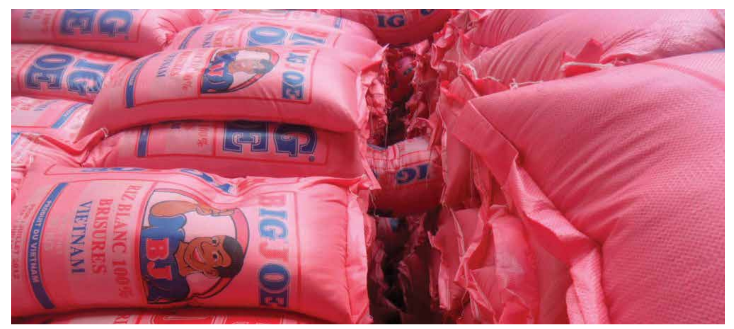
Figure 4.7 I Ventilation channel between stacks of bagged rice. Note that every 5 or 6 tiers, that a rice bag is set across stacks interlocking the tiers. This is done so to stabilize the stacks of cargo preventing collapse and shifting of stacks.