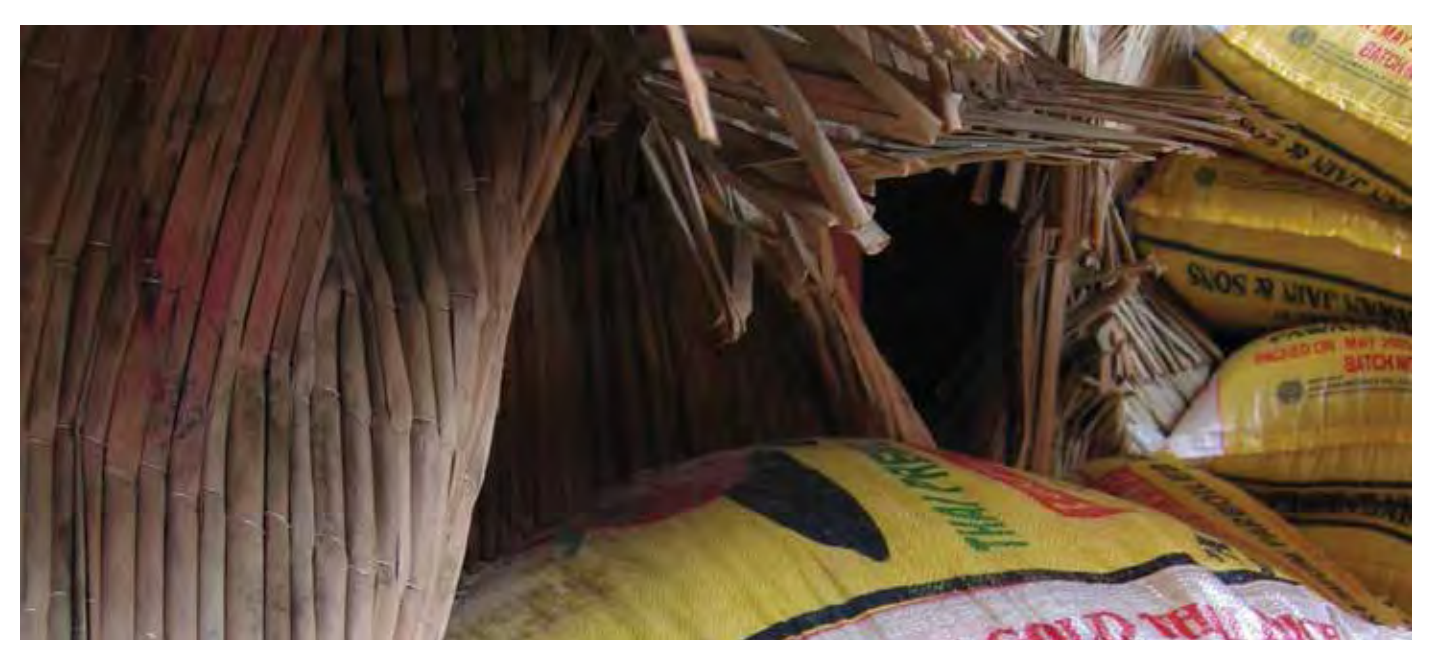
Figure 3.4 I Bamboo mat dunnage placed along the ship sideshell has been stained by ship sweat. The bag adjacent to the dunnage has been stained as a result of the migration of water though the bamboo matting.