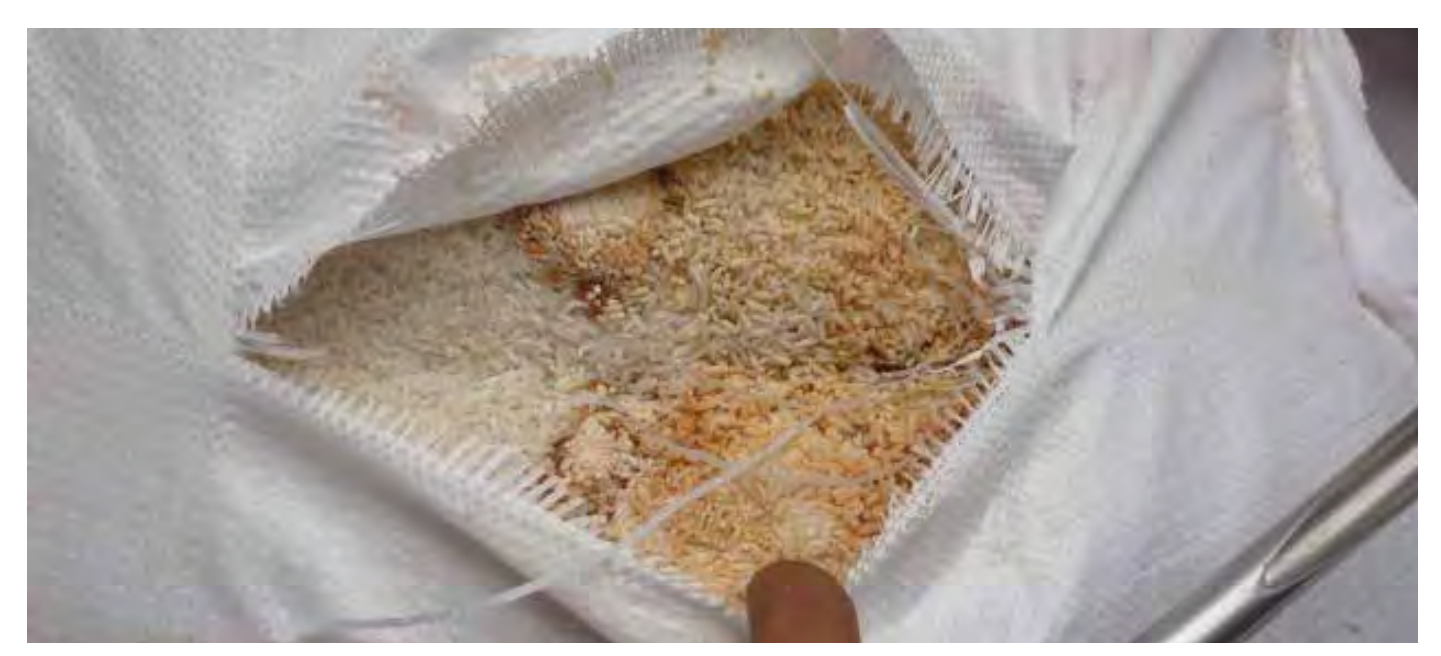
Figure 1.3 | Caked rice as a result of water damage leading to the onset of mold.