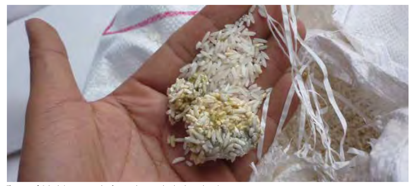
Figure 1.2 | Caked rice as a result of water damage also leads to clumping.