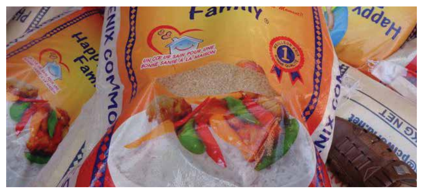
Figure 1.10 | A common means of pilferage is to cut rice bags open while in the cargo hold.