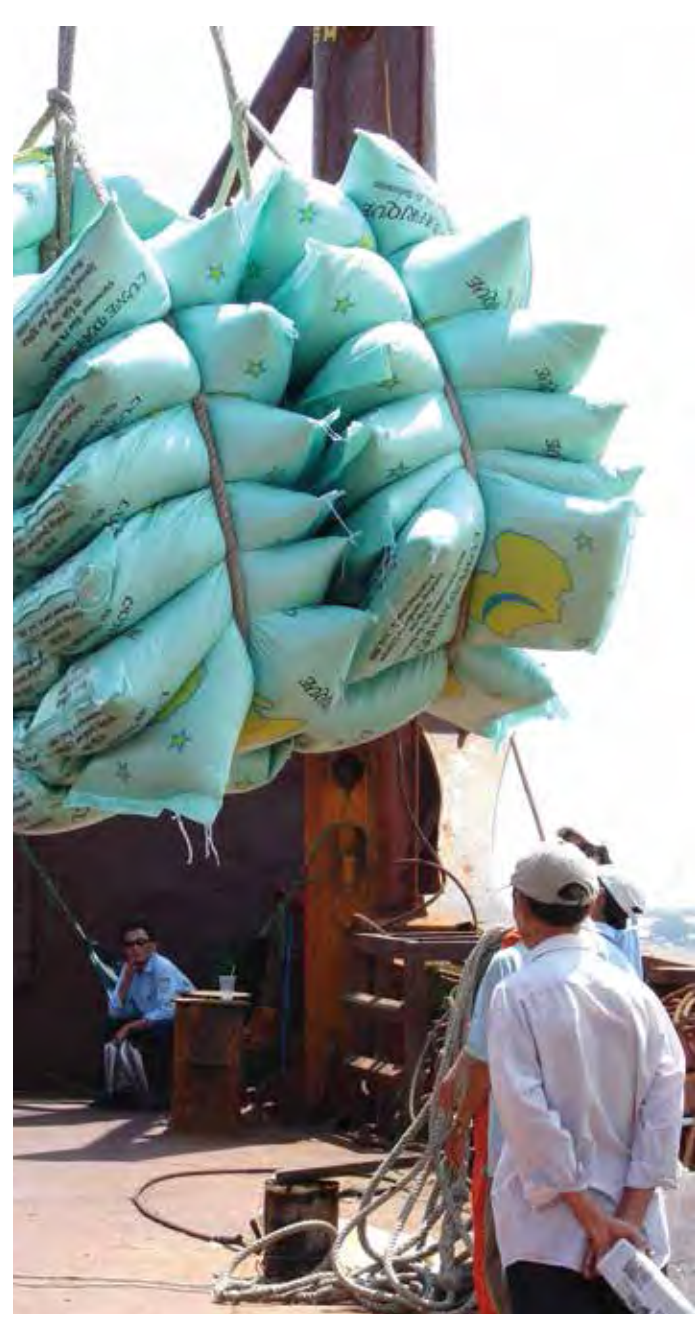
Figure 4.4 I Surveyors tallying a bundle of rice being hauled overboard from a rice barge into the cargo hold.