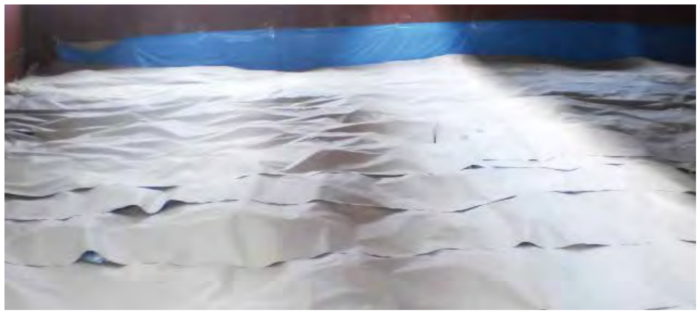
Figure 3.16 | Cargo is loaded to the foot of the hatch coaming and covered with kraft paper.