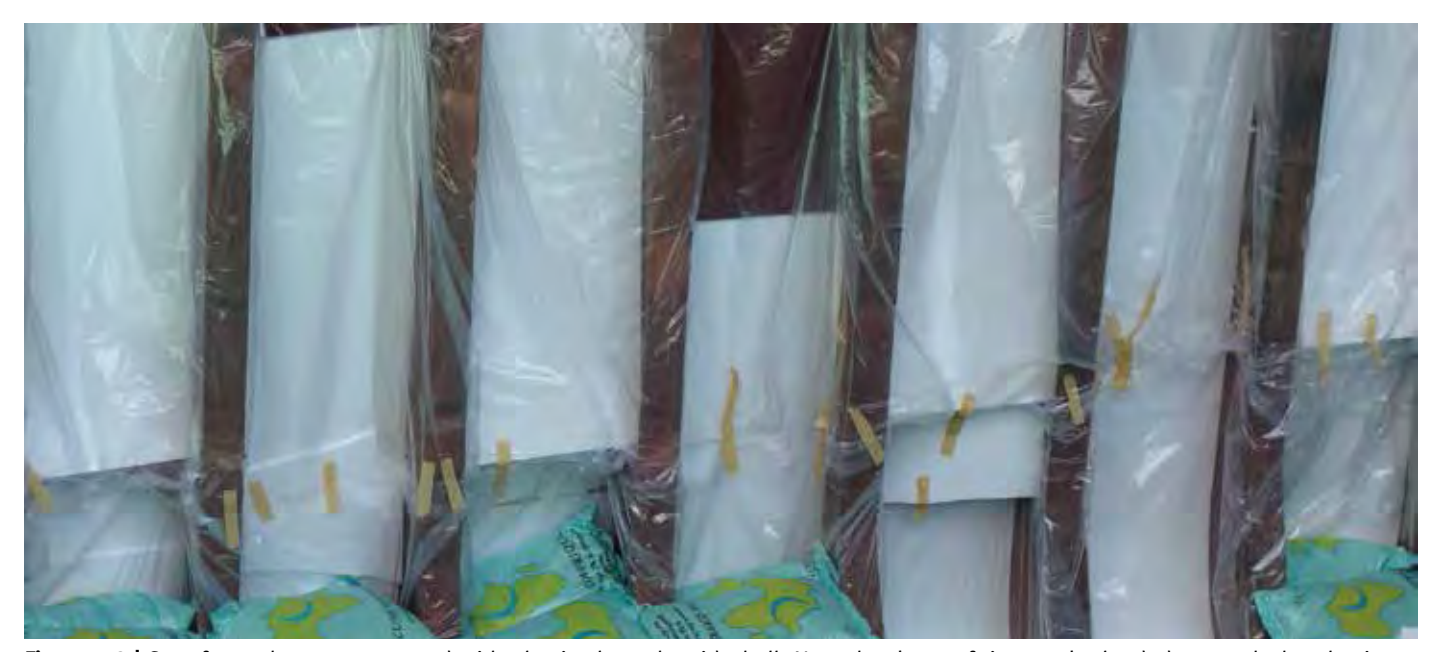
Figure 3.8 l Styrofoam sheets are covered with plastic along the sideshell. Note that bags of rice can be loaded to touch the plastic sheeting so moisture from ship sweat cannot penetrate.