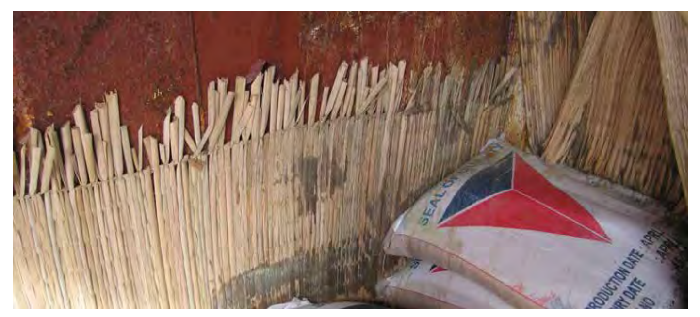
Figure 1.6 I Bamboo mat dunnage along the ship sideshell has been stained through ship sweat. The bag adjacent to the dunnage has been stained through the migration of condensation though the bamboo mat into the bag.