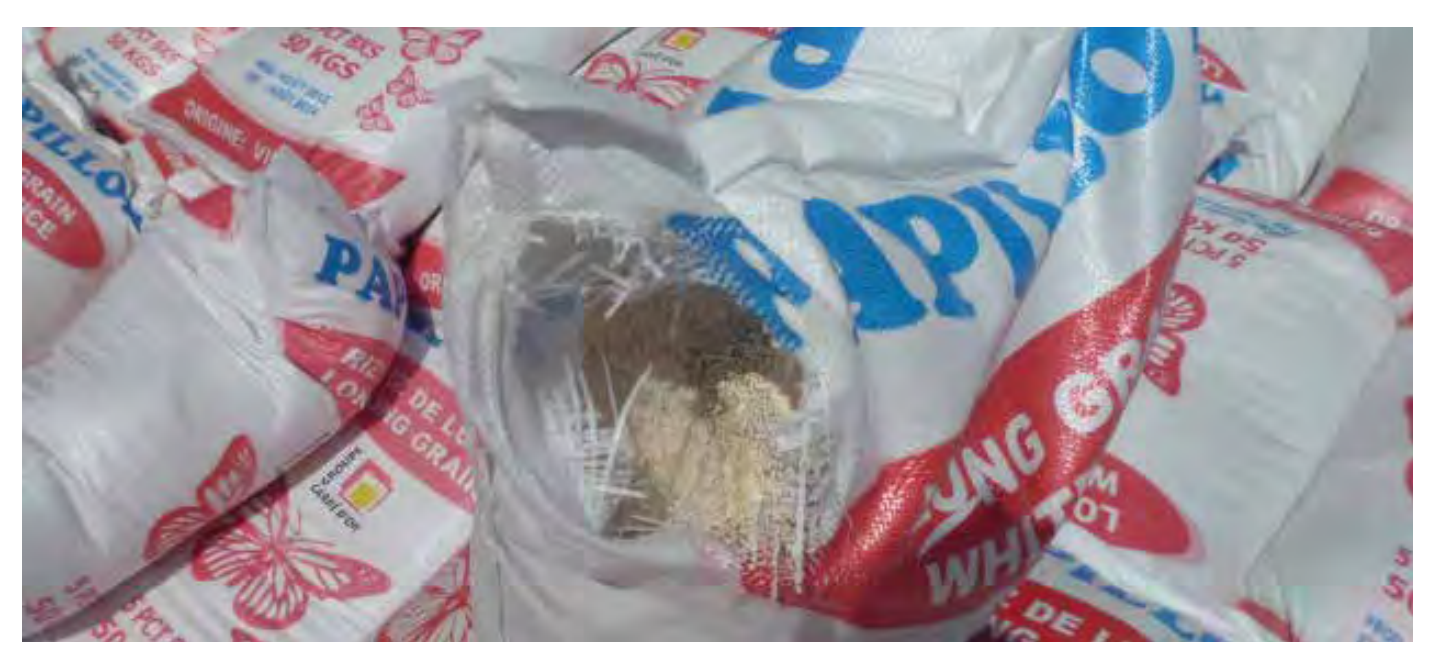
Figure 1.8 | Bags of rice are torn open and pilfered.