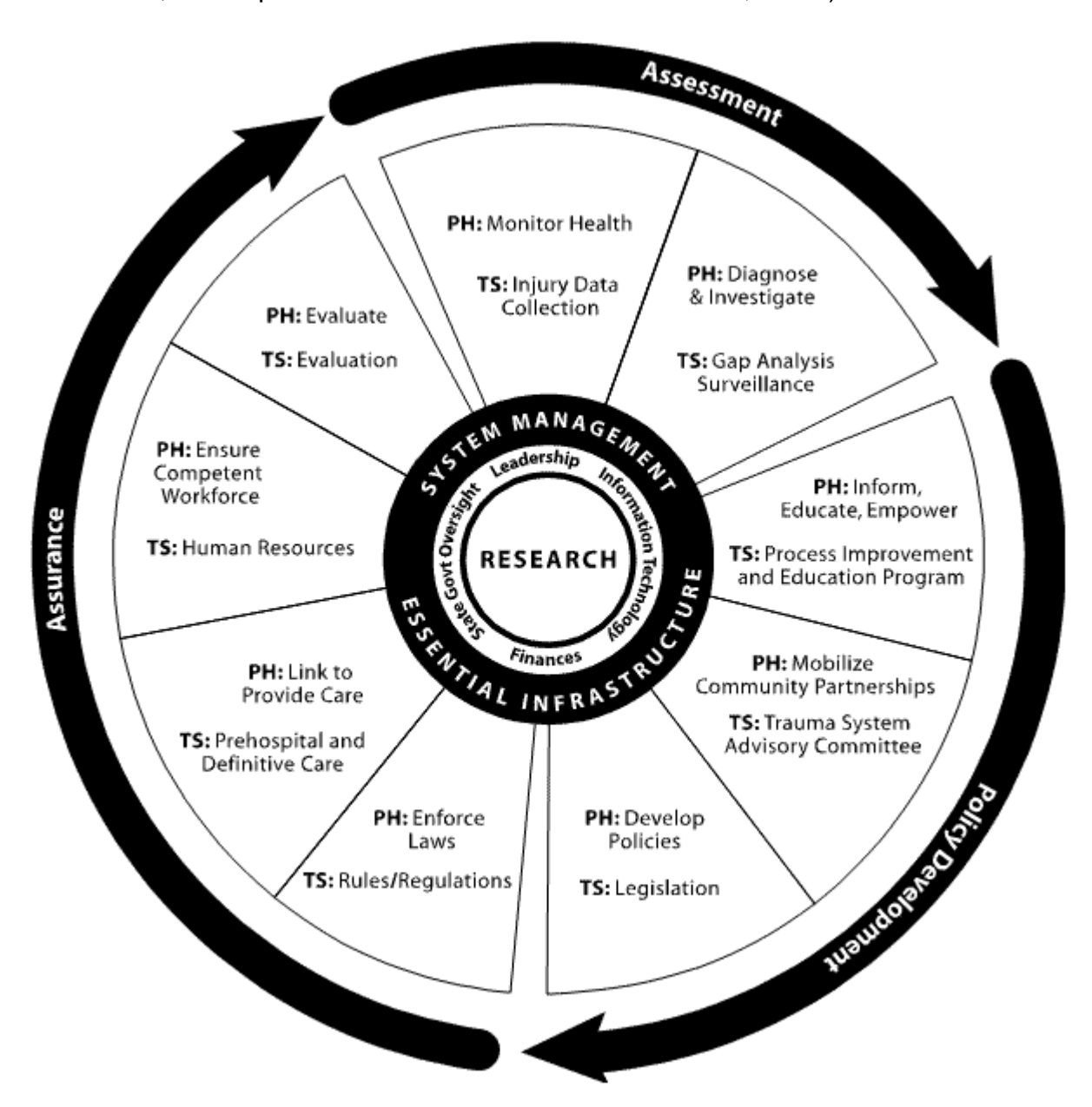
Figure 2. Core functions and essential services of the trauma system integrated with public health. (Reproduced with permission, Model Trauma System Planning and Evaluation , US Department of Human and social Services, 2006.)

The application of the public health paradigm to trauma system development is rooted in the belief that injury can be approached in a way similar to that for other diseases and controlled by appropriate prevention strategies. These strategies may be targeted towards preventing events likely to result in injury (primary prevention), towards minimizing the injurious effects of an event (secondary prevention), or towards reducing the morbidity and mortality associated with injury (tertiary prevention). These goals can only be achieved by developing an administrative and legislative framework that brings