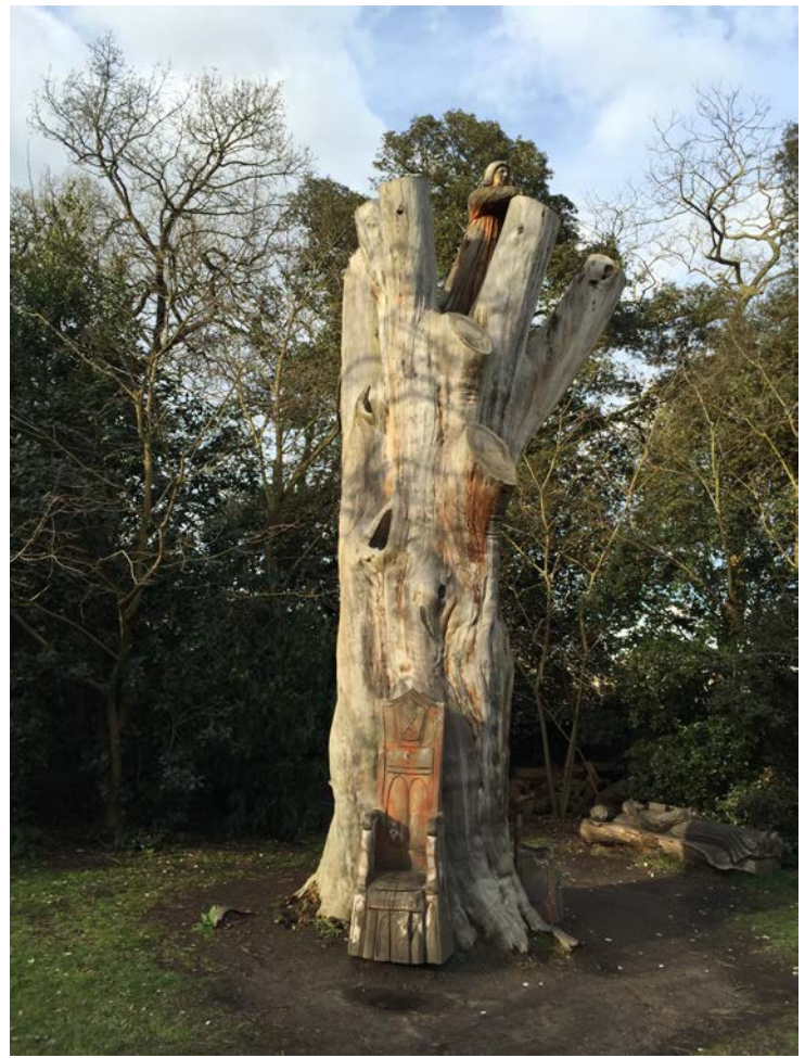
In the park of Fulham Palace

After the visit, follow the shore of the Thames, left side, and go to Hammersmith, more precisely to Hammersmith Road at number 153.