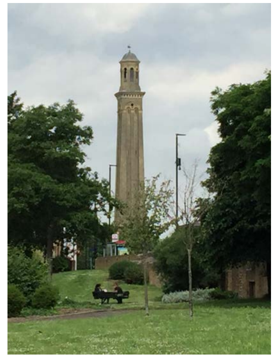
London Museum of Water and Steam

Before Key Bridge you find the Museum of Water and Stream, London in 1850.