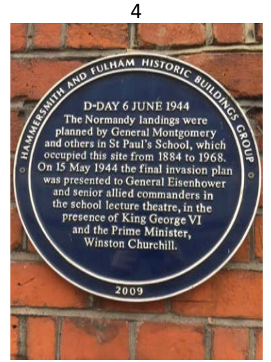
Plate outside Hammersmith Rd 153