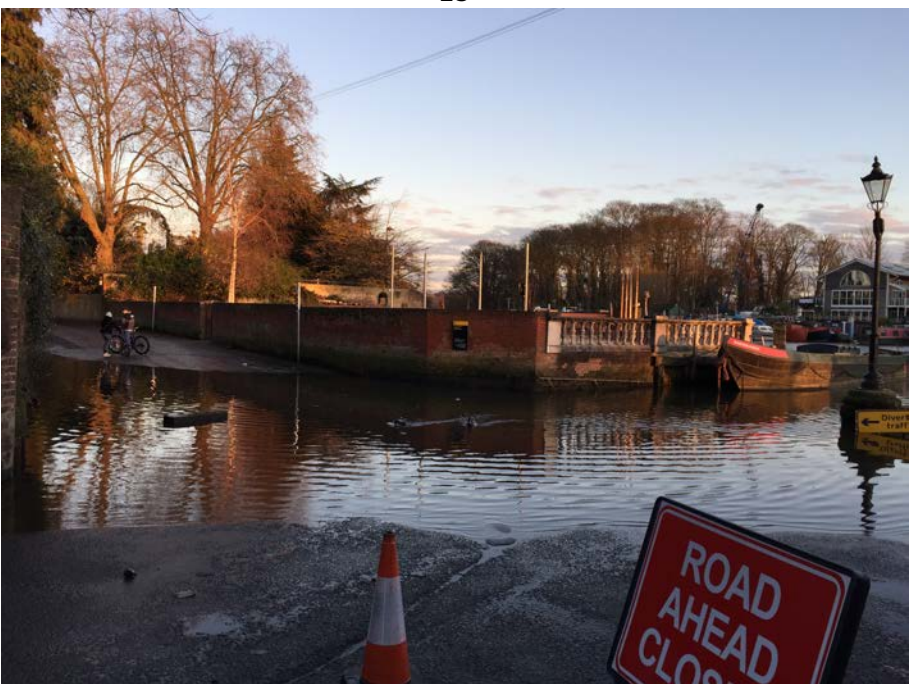
Overflowing of the Thames

From Twickenham you can visit Eel Pie Island. The bridge is just in the center of the town.