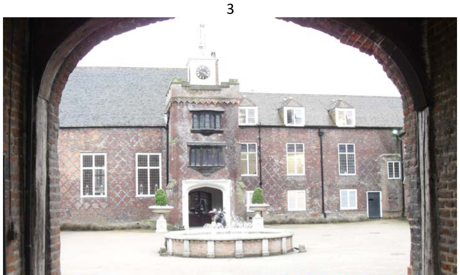
The residence of the bishop of London until 1973, Fulham Palace