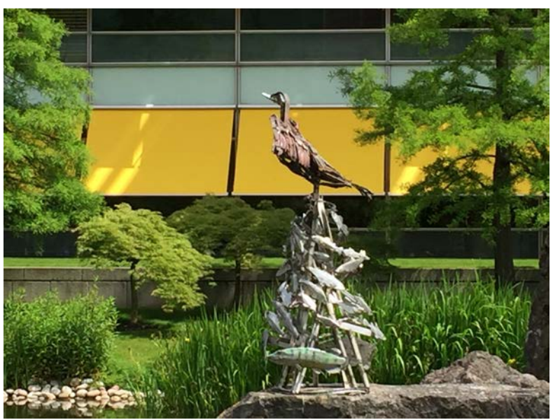
New building style in Chiswick

After Chiswick centre, go to a trafficked main road, called Great West Road until you arrive to the entrance of Gunnersbury Park.