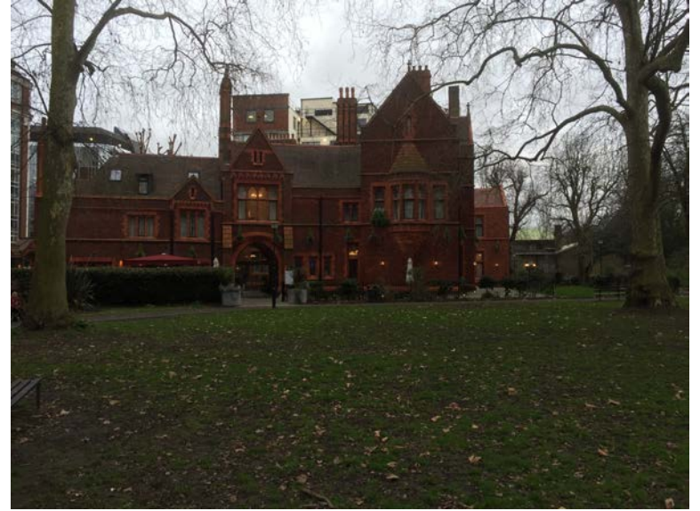
The school where the secret meeting was held in 1944.

Another historical information about Hammersmith Rd is, that the road it part of The Trafalgar Way.