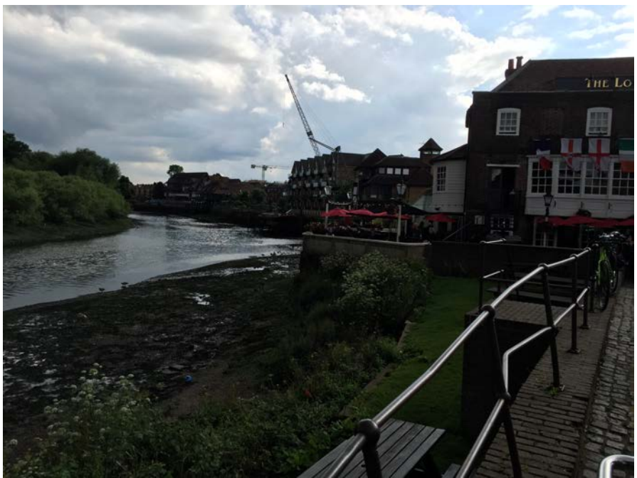
The Thames towards Twickenham

After Syon, continue towards Twickenham, the capital of Rugby.