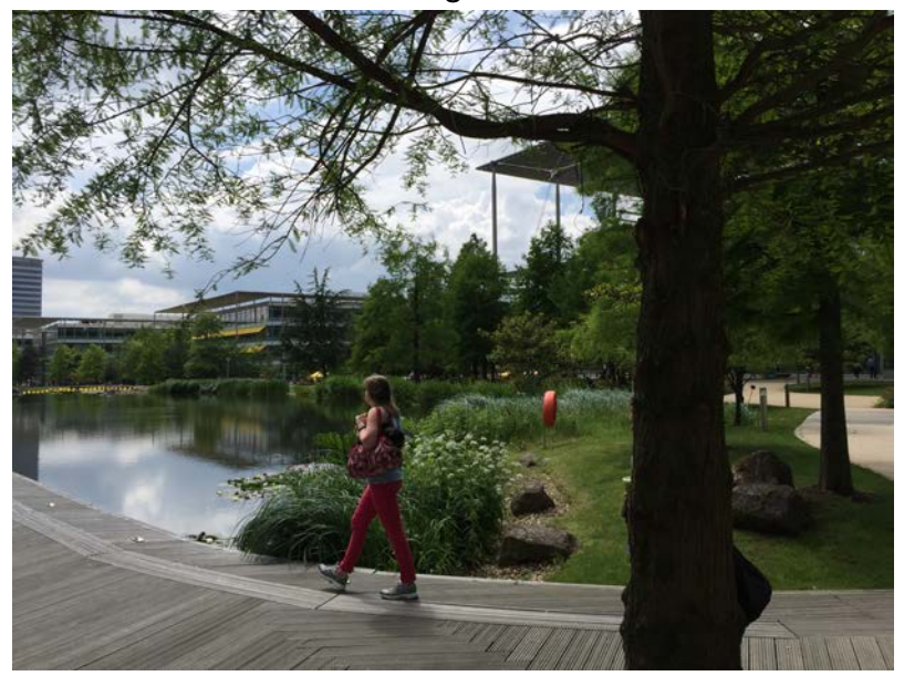
In the center of Chiswick, new style