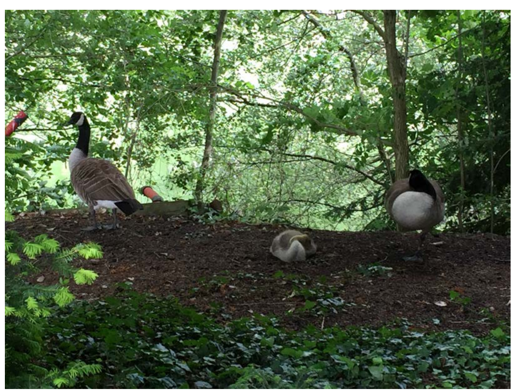
inside Gunnersbury Park Gunhers