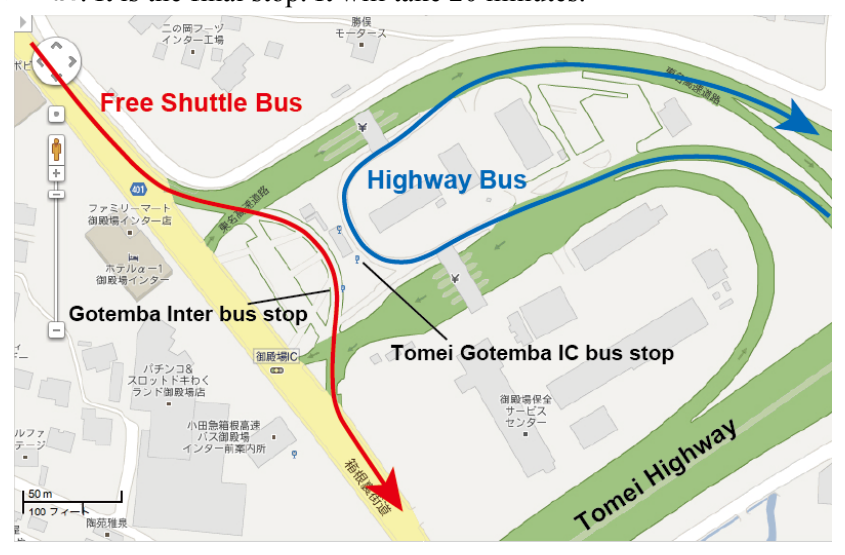
Shuttle bus timetable

about once an hour and the final one leaves JR Mishima station at 21:00. Get off on the Kogen Hotel stop or 高原ホテル前. It is the final stop. It will take 20 minutes.