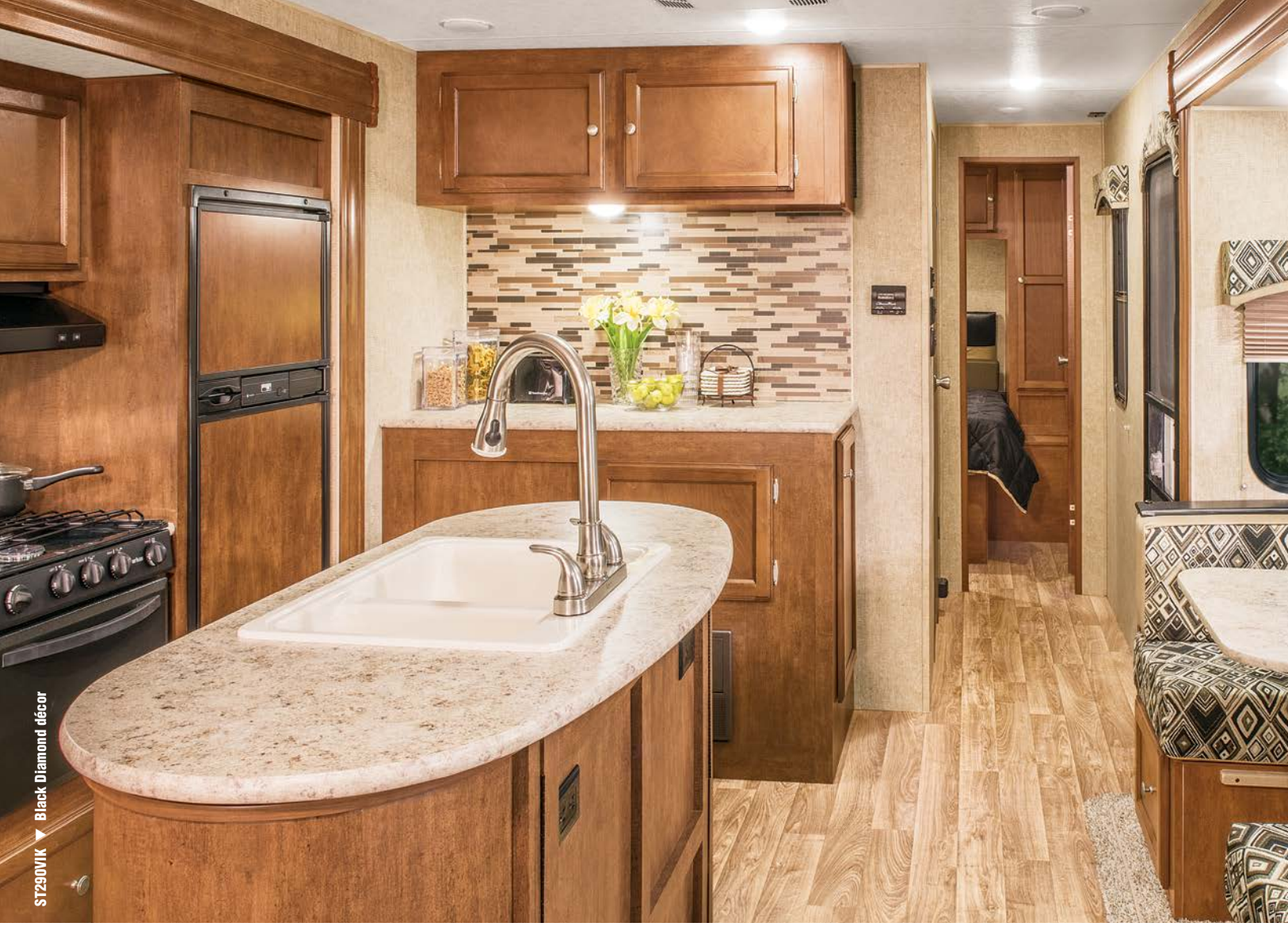
The 290VIK includes a hutch for today's coffeemakers and other appliances. All SportTreks include a microwave with turntable, 6.3 cubic foot refrigerator and a three-burner range with oven.