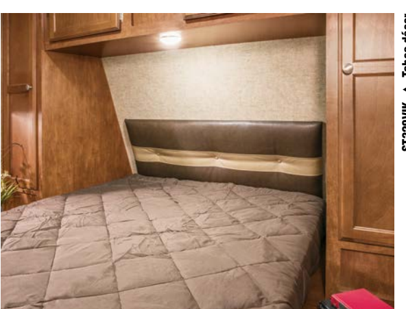
Bedrooms include designer padded headboards, generous storage, overhead reading light and reversible comforter