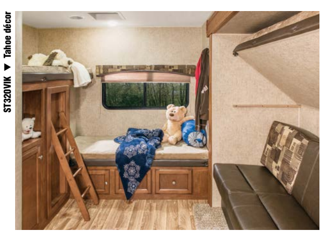
Your kids will love the 320VIK's bunkroom with daybed and plush teddy bear bunkmats, along with the sofa and flip-down bunk.