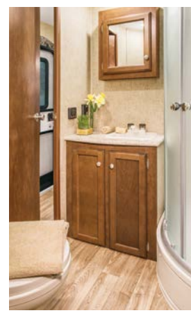
High-end radius glass shower doors, large linen closet, and the 290VIK offers access from both the bedroom and hallway.