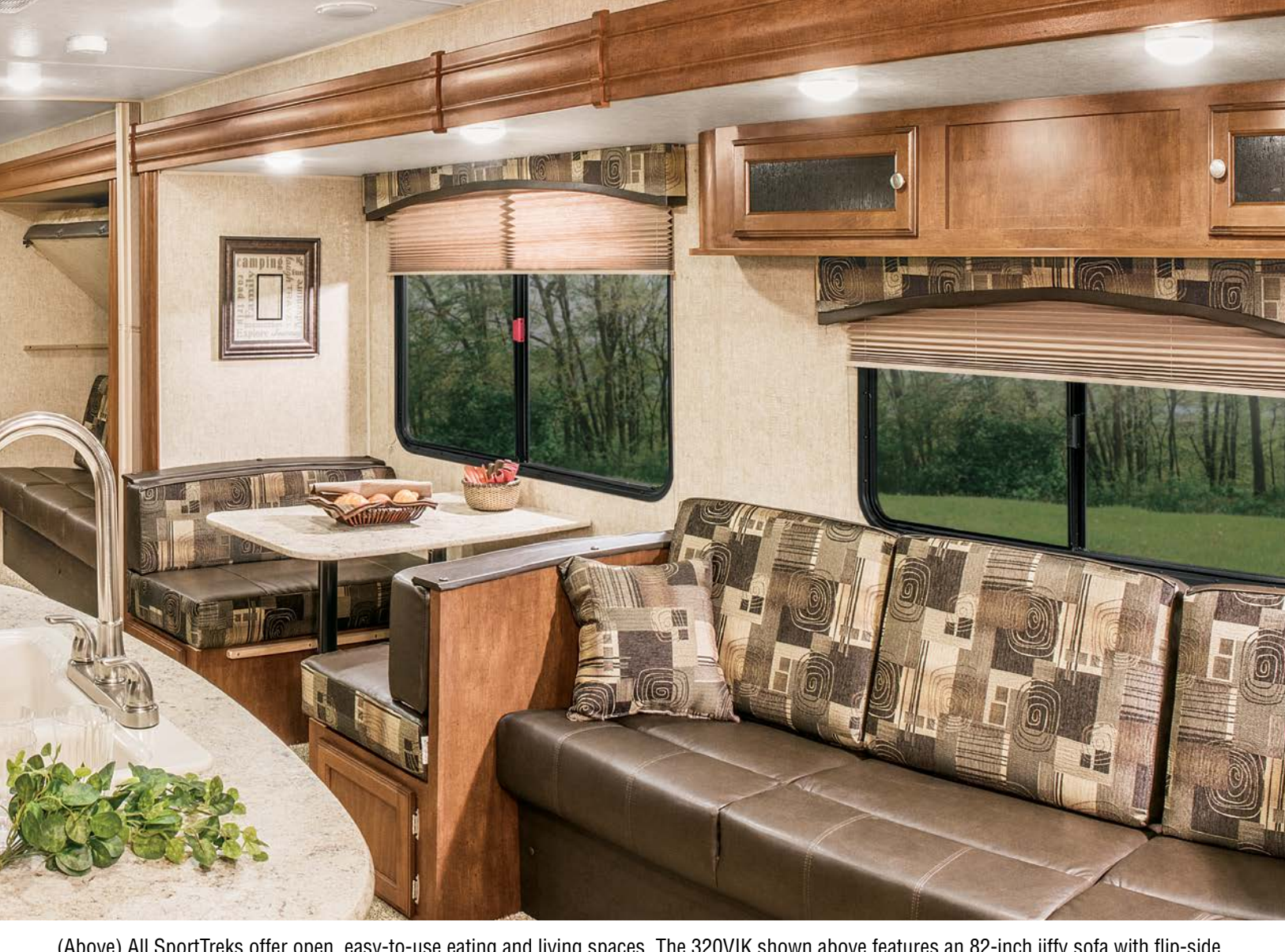
(Above) All SportTreks offer open, easy-to-use eating and living spaces. The 320VIK shown above features an 82-inch jiffy sofa with flip-side reversible cushions and comfy dinette.