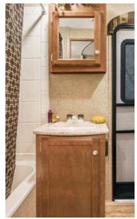
The 320VIK offers an easy-access rear exterior door – keeps kids (and husbands) from tracking through the entire coach.