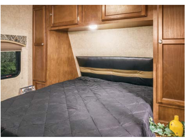
Bedrooms are designed with an eye toward comfort and function, and include a Sleep Tight® memory foam mattress, Extend-a-Bed® body pillow, solid wood nightstands, under-bed storage with gas struts, generous overhead cabinets, TV and satellite connections and hard valances with nightshades.