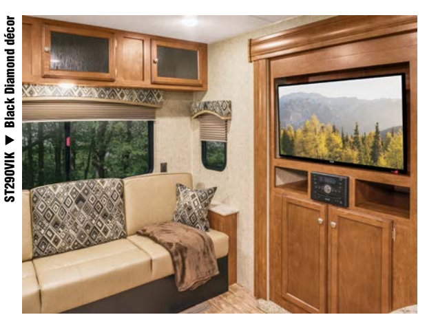
The entertainment package includes a 40-inch LED ROKU-ready TV in most models, as well as a DVD/CD/Stereo with Bluetooth.