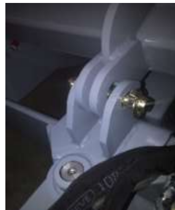
Safety Pin for Transport