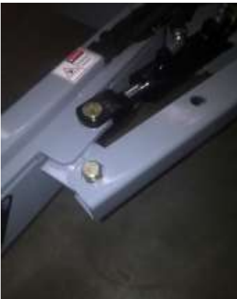
Safety Brace for Transport

Lever 10- Rear Driver Side Blade- (Lower and raise Blade)