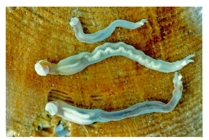
Fig. 1: Shipworm at three maturity stages.

In several cases it was impossible to ascribe a structural component the determined tree species. However, Liphschitz and Pulak assume that in the Bronze Age planking was usually made from Lebanon Cedar. In wrecks dated to a later period they found mostly pine species, which were also mainly used for planking, for example the species Pinus brutia and P. nigra that are found in the Eastern Mediterranean. Between the Bronze Age and the age of the Ottoman Empire, these kinds of wood were supplemented by oak species ( Quercus cerris and Q. coccifera ). Other wrecks discovered later confirm the frequent use of oak and pine wood around the Mediterranean<sup>6</sup>.