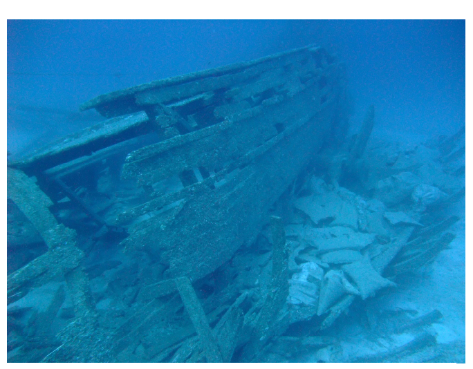
Fig. 2: Partial view of the wreck Uluburun III.

Currently, some 70 kinds of shipworms are known within the family of Teredinidae; they are found mostly in coastal regions at temperate and tropical latitudes. In German, the misleading term "Schiffsbohrwurm" (literally ",ship boring worm") is quite common because of the worm-like elongation of their body and their frequent occurrence on sailing ships in the past; the English equivalent "shipworm" may have contributed to the frequent use of "Schiffsbohrwurm" even in scientific publications. As а matter of fact. Teredinidae are molluscs with a long, stretched body that bore into the wood and,