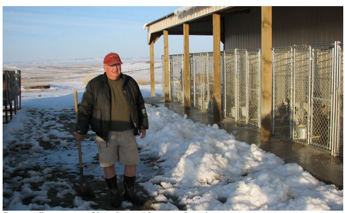
See you all next year - Oh and remember your boots!