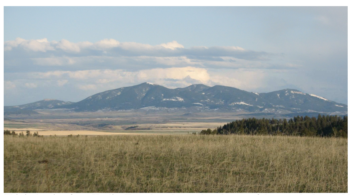
This is the view from Hyalite Kennels and even though most of the snow had melted by afternoon of the second day the view is still fantastic. Combine the view with two days of great folks, great food, and great dogs and it is a trip to remember.

The UKC pointing dog trails are designed to become the finest "Breeder's Stake" in North America. The game is played on foot, like we hunt, in venues large enough for a continuous course to best identify the finest hunting pointers. Unlike hunt tests where every dog can win this is a competitive trial and only the best dog on that day gets a blue ribbon and only a dog that has multiple best days can be championed.