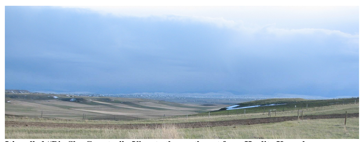
It's called "Big Sky Country" - View to the southwest from Hyalite Kennel.