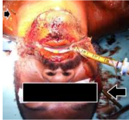
Fig. 1: Demonstrating Spear gun trajectory. Fish gun spear (Black arrows).

The left side of neck had evidence of localized surgical emphysema around the exit wound of the spear. The patient had no signs of neurovascular or other aerodigestive injuries. He had a CT Angiogram which demonstrated the course of the spear spanning infratemporal, transoropharyngeal and transcervical regions (Figures 2 and 3). There was associated surgical emphysema and no obvious significant vascular injury. The CTA views interpretation were however obscured by artefactual beams from the spear itself. A multidisciplinary team approach was undertaken comprising ENT (primary surgical team), Maxillofacial and Anaesthesia teams.