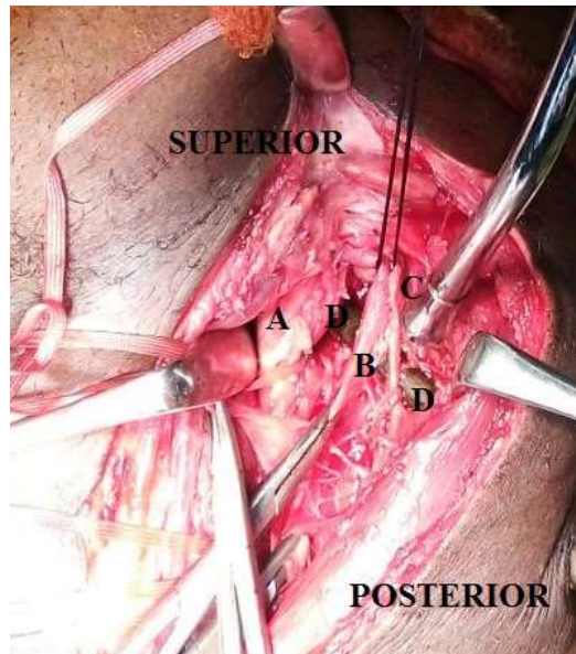
Fig. 4: Demonstrating intraoperative neck findings. A-proximal internal and external carotid arteries B- transected IJV C-Spinal Accessory D-fish spear gun.

Intraoperative findings revealed the spear spanning the infratemporal and oropharyngeal regions as previously described. In the neck, it passed posterior to the proximal internal and external carotid arteries and then through the internal jugular vein (IJV). There was no associated bleeding or haematoma as the spear had tamponaded the IJV transection injury. The spear then passed posterior to the left Spinal accessory nerve and exited the neck posterior to left sternocleidomastoid muscle (Figure 4). The IJV was ligated and the barbed end of the fish gun spear was pulled out the neck under direct vision with no significant sequelae (Figure 5). The oropharyngeal injury was repaired primarily and the maxillofacial injuries addressed electively. He was discharged five days postoperatively with no complications and last follow-up at three months was unremarkable.