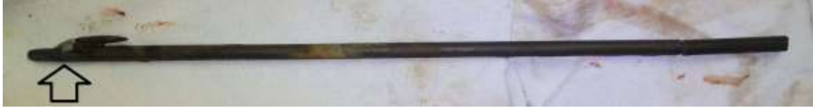
Fig. 5: demonstrating fish gun spear. Barbed end (open arrow)