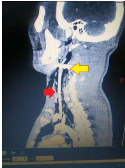
Fig. 3: demonstrating sagittal view of spear posterior relation to left common carotid artery Red arrow-common carotid artery Yellow arrow- spear