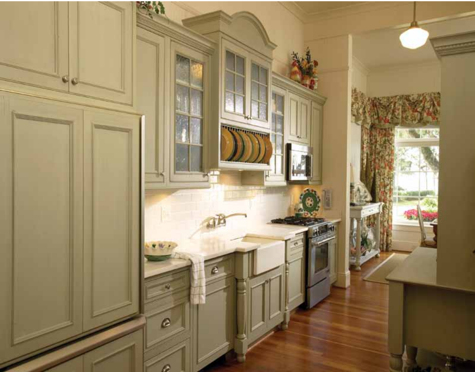
THE DISTRESSED 'MINT JULEP' FINISH, SEEDY GLASS DOORS, ARCHED PEDIMENT, AND FARMHOUSE SINK WITH TURNPOSTS GIVE THIS GUEST COTTAGE KITCHEN THE TIME-WORN LOOK FITTING A CENTURY OLD HOME.