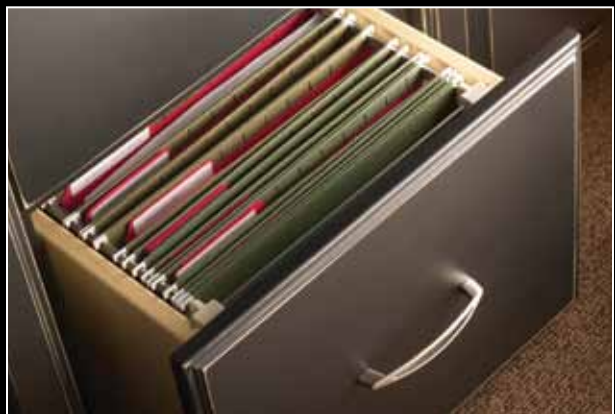
INTEGRATED FILING SYSTEM