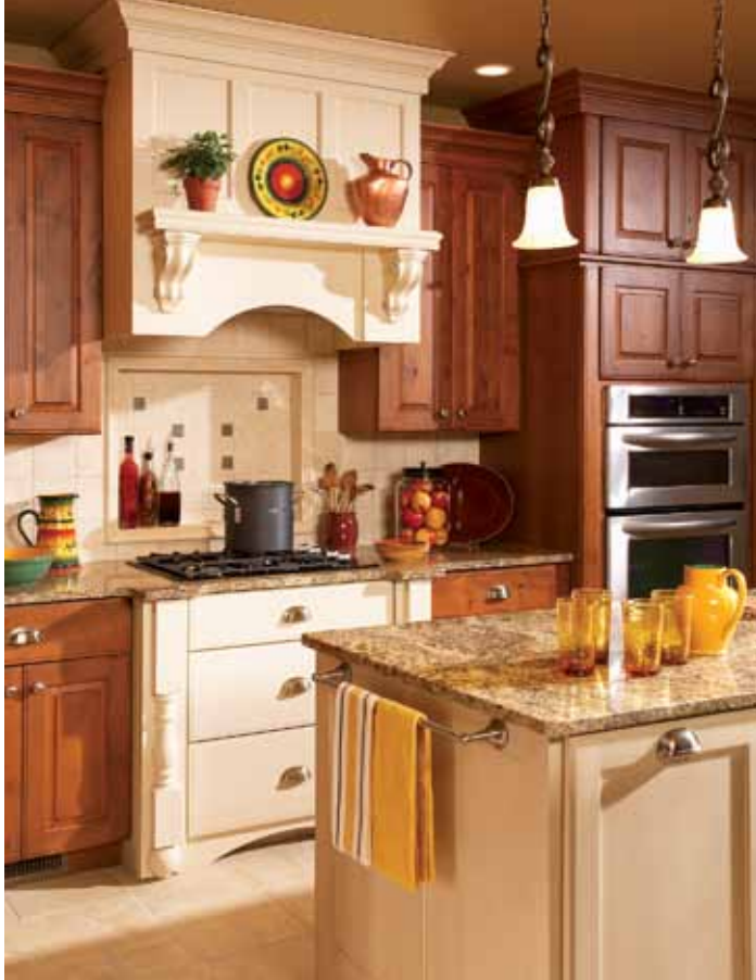
ISLAND AND HOOD, FOCAL POINTS OF THE KITCHEN, FEATURE SEABROOK DOOR STYLE, SLAB DRAWER STYLE, STANDARD HIP PROFILE, MAPLE IN VINTAGE VANILLA ENAMEL WITH MATTE SHEEN, D-EDGE PROFILE.

(OPPOSITE PAGE) WOODHARBOR EXTERIOR DOOR IS OF A MATCHING WOOD SPECIES AND FINISH.