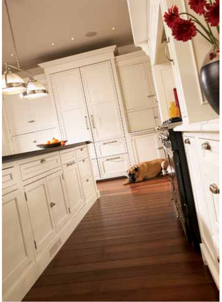
KITCHEN CABINETRY FEATURES MADISON DOOR STYLE, STANDARD HIP PROFILE, MANOR FLAT DRAWER FRONT, COASTAL WHITE ENAMEL, A-EDGE PROFILE, FLUSH INSET STYLING.