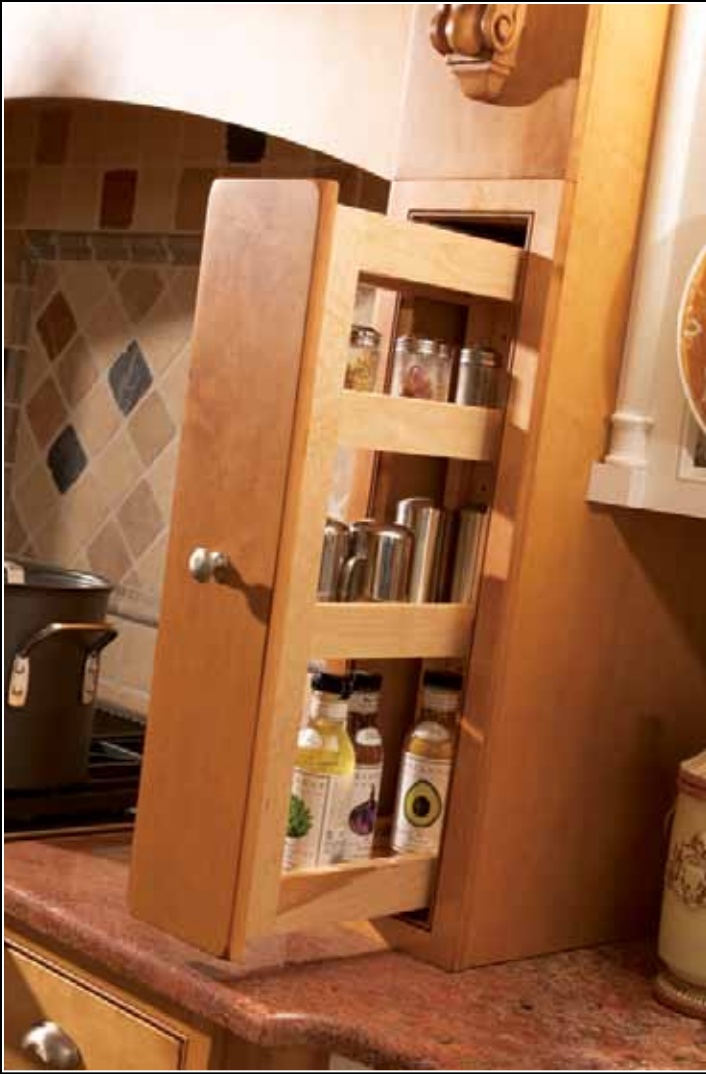
MANTEL PULL OUT PANTRY