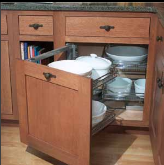
BLIND CORNER MULTI-STORAGE