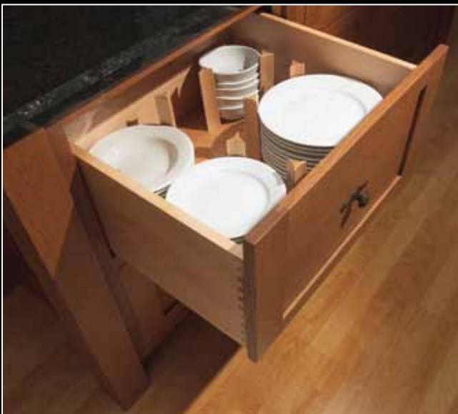
DISH DRAWER ORGANIZER