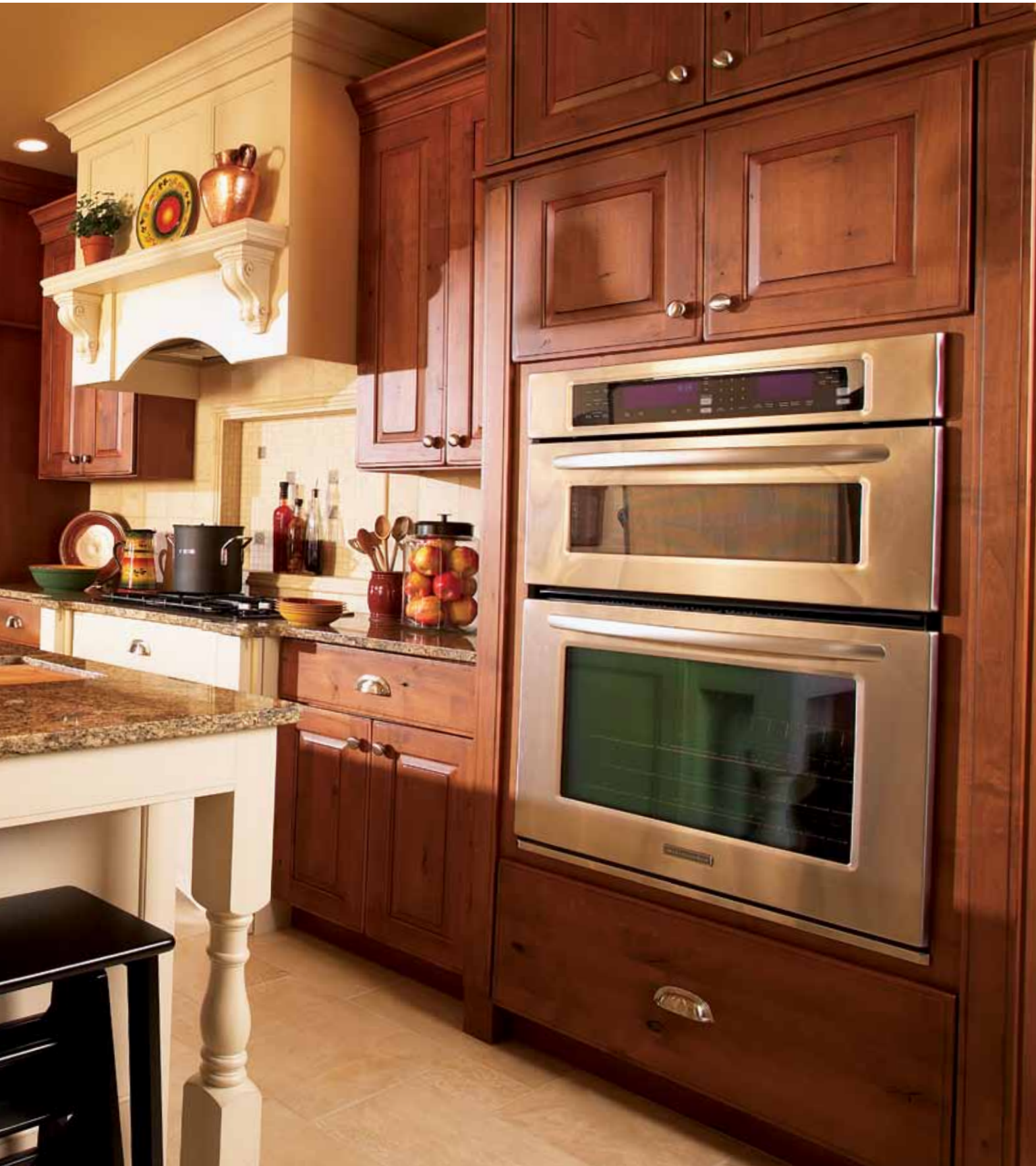
THE CARROLL HOME FEATURES THE ARTFUL CONTRAST OF PAINTED AND STAINED WOOD. IN THE KITCHEN, THEY CHOSE WATERBURY DOOR STYLE, STANDARD HIP PROFILE, SLAB DRAWER STYLE, KNOTTY ALDER IN RUSTIC PEBBLE MATTE FINISH, D-EDGE PROFILE.