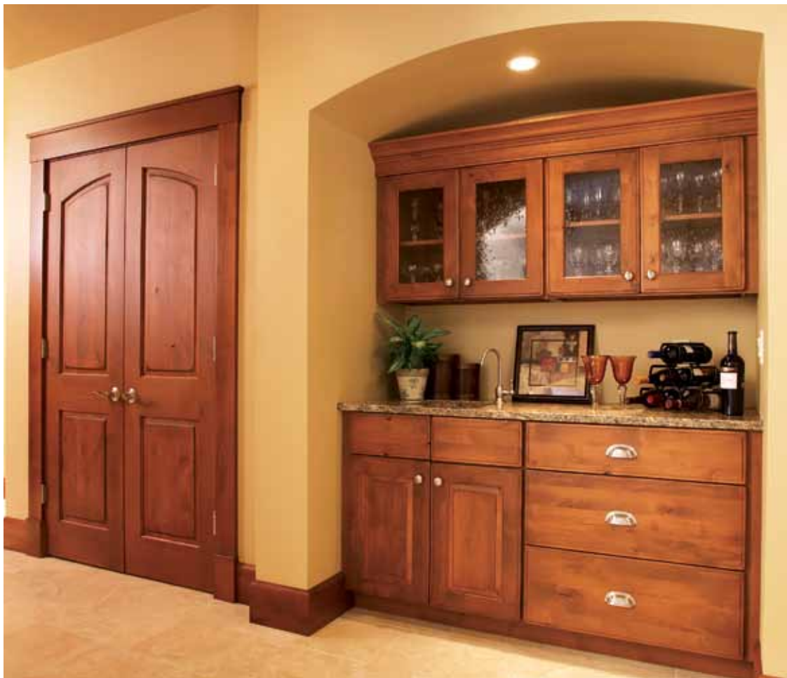
THE SERVING BAR USES PORTLAND DOOR STYLE, SLAB DRAWER FRONT, STANDARD HIP PROFILE, KNOTTY ALDER IN RUSTIC PEBBLE FINISH WITH MATTE SHEEN, C-EDGE PROFILE.

THE MATCHING DOUBLE DOORS ARE OF THE SAME WOOD SPECIES AND FINISH.