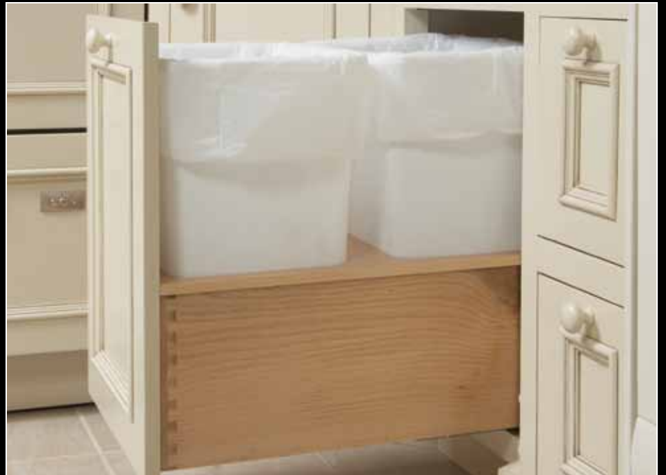
DOUBLE ROLL-OUT WASTE