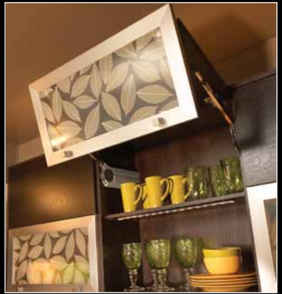
BI-FOLD FLIP UP LIFT SYSTEM