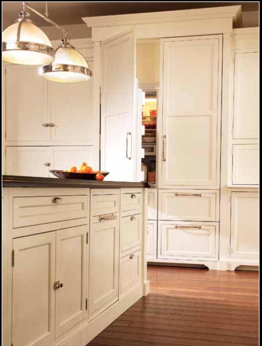
INTEGRATED APPLIANCE PANELS