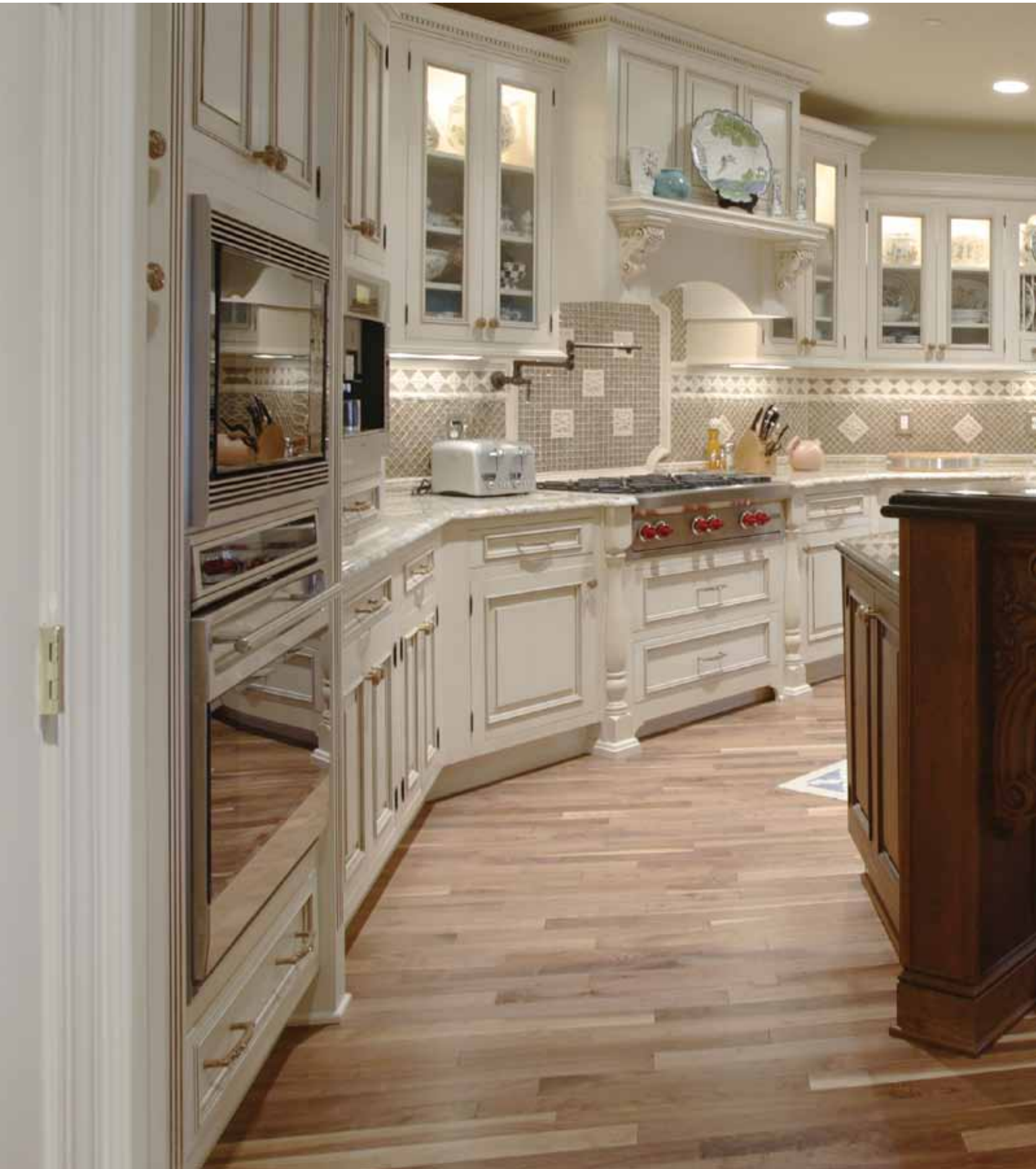
Stunning home on the river