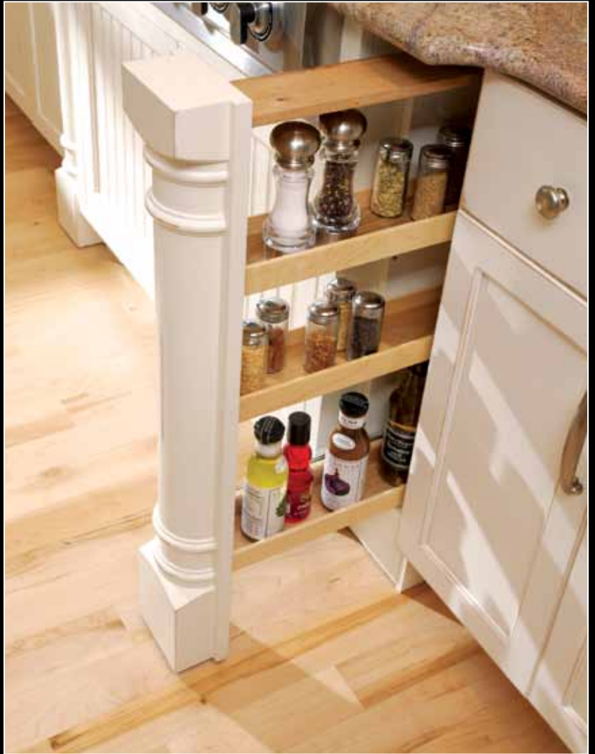
BASE PULL-OUT COLUMN