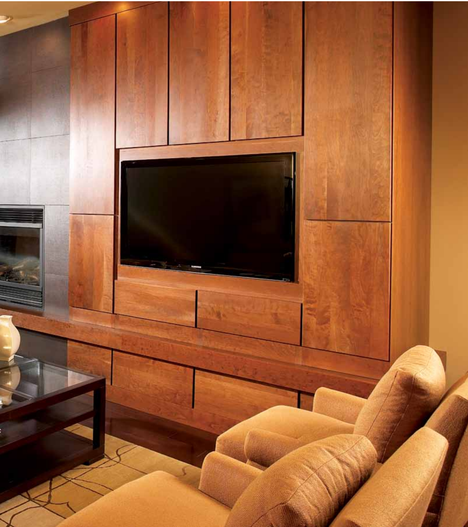
THE OUVERSONS BROUGHT THEIR LOVE FOR SUN AND WATER TO THEIR CONDO ON THE LAKE. MANY ACCENT PIECES WERE PURCHASED IN FLORIDA, WHERE THEIR WINTER HOME IS LOCATED. THE ENTERTAINMENT ROOM FEATURES CABINETRY WITH CAMERON DOOR STYLE, SLAB DRAWER FRONT, CHERRY IN WALNUT WITH SATIN SHEEN, A-EDGE PROFILE.