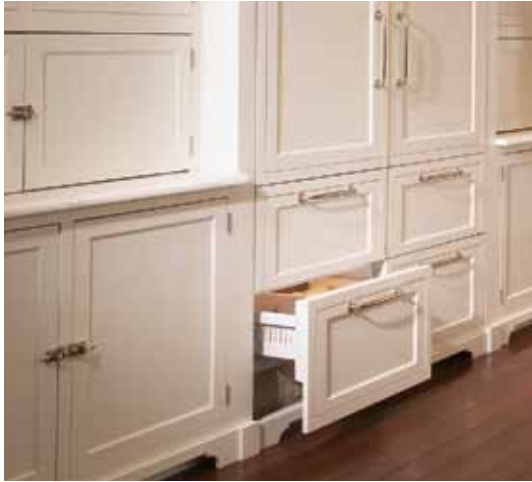
THE DRUMMS TOOK ADVANTAGE OF WOODHARBOR'S MANY OPTIONS, INCLUDING INTEGRATED APPLIANCE PANELS, MAKING THE FREEZER DRAWERS DISAPPEAR INTO THE CABINET WHEN CLOSED.