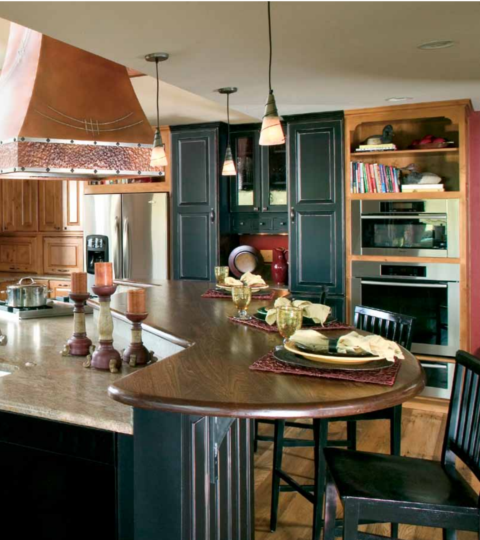
THE RODWIN HOME USES A PLEASING AND UNIQUE COMBINATION OF WOOD AND PAINTABLE SURFACES. A WORTHY PERSONALITY FOR A COLORADO HIDEAWAY. THE KITCHEN FEATURES WATERBURY DOOR STYLE, MANOR RAISED DRAWER FRONT, STANDARD HIP PROFILE, KNOTTY ALDER IN HONEY FINISH WITH COFFEE GLAZE, C-EDGE PROFILE.