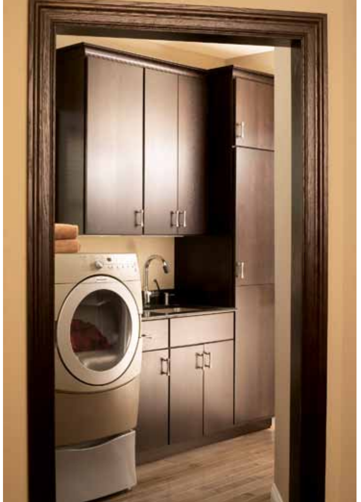
HIS KITCHEN CABINERY FEATURES CAMERON DOOR STYLE, SLAB DRAWER FRONT, QUARTER SAWN WHITE OAK IN ESPRESSO FINISH WITH SATIN SHEEN, A-EDGE PROFILE.