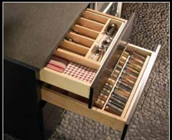
CUTLERY TRAY/SPICE TRAY