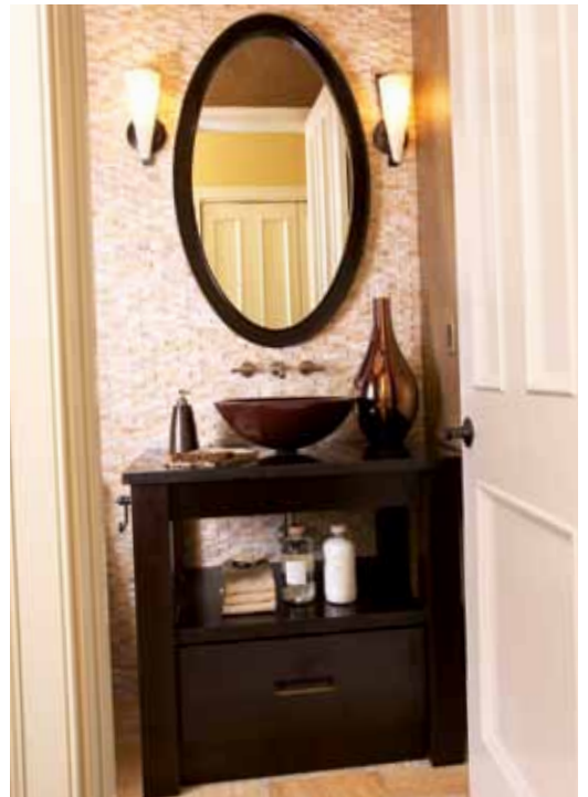
CABINETS IN THE MASTER BATH AND POWDER BATH FEATURE CAMERON DOOR STYLE, SLAB DRAWER FRONT, CHERRY IN ESPRESSO FINISH WITH SATIN SHEEN, A-EDGE PROFILE.