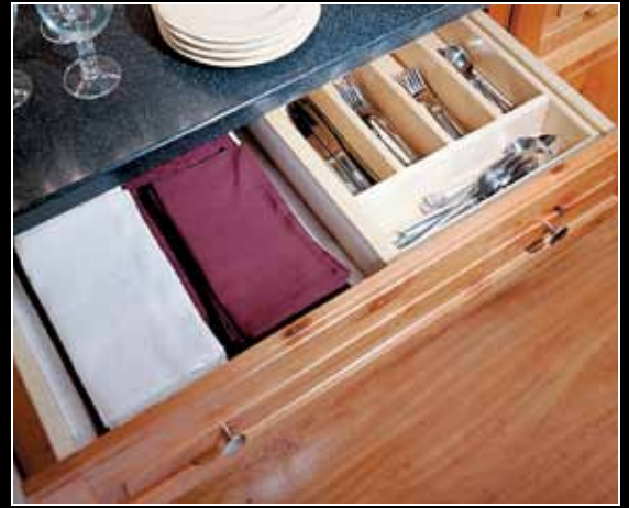
WOOD CUTLERY TRAY