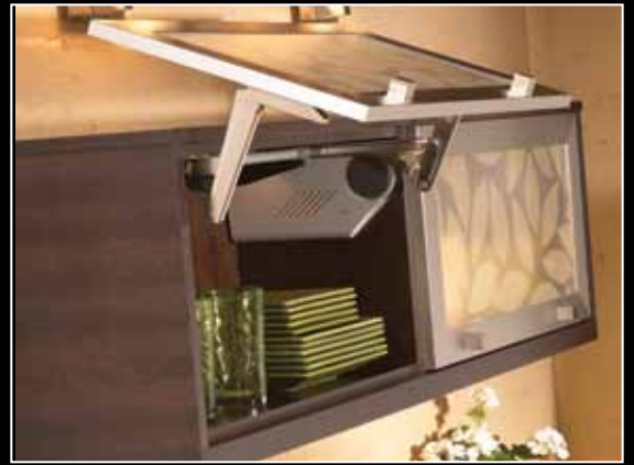
UP AND OVER LIFT SYSTEM