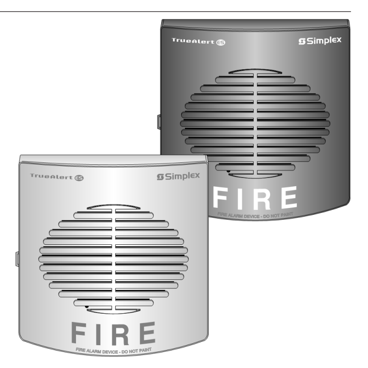
Figure 1: TrueAlert ES Addressable Horns are Available in Red with White Lettering and White with Red Lettering

TrueAlert ES addressable horns are individually addressed audible notification appliances that receive power, supervision, and control signals from a Simplex fire alarm control panel providing IDNAC Signaling Line Circuits (SLCs). See TrueAlert ES Horn LEGACY Compatibility Reference for more information.