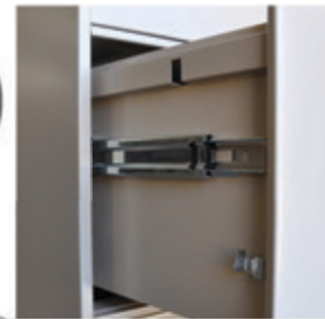
Steel Ball Bearing Suspension