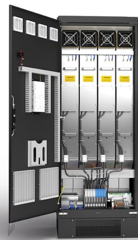
TESVOLT PCS with four inverter modules (IPUs)