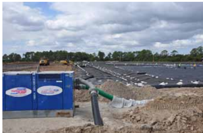
Dewatering pumps operating during cell construction as the leachate collection trench is constructed at the Lee/Hendry County Regional Solid Waste Disposal Facility Ash Monofill Expansion (October 2014).

liner above groundwater and create the grades required for drainage. Construction costs at facilities with