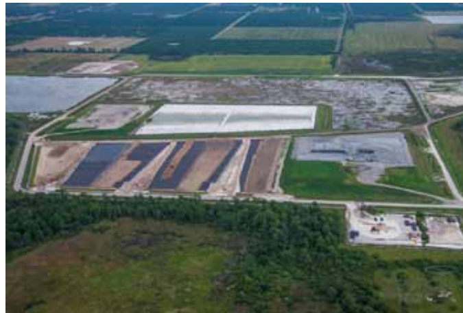
The Lee/Hendry County Regional Solid Waste Disposal Facility Ash Monofill Expansion was constructed with the leachate collection trenches below the water table (October 2014).

Inward gradient landfills require additional evaluation and design considerations than an above-grade