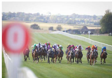
The Curragh Racing Post

The Curragh S. for 2-year-olds in late August will carry Group 3 status for the first time.