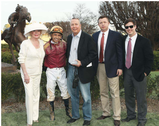
The winning connections of Far Right