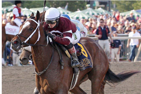
Untapable wins Cotillion

“It seemed odd to me that we’re running on holiday Mondays and not on Sundays when people are off,” he said. “It allows us to run on days when people are off, so they can come and bet on the live product. You should be open.