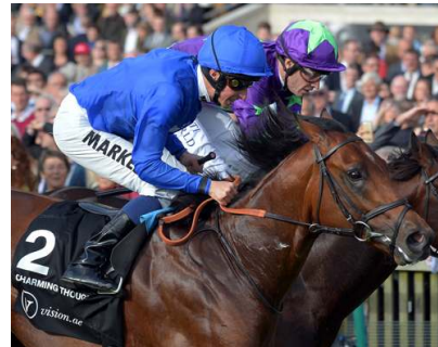
Charming Thought, winner of the 2014 Middle Park Racing Post