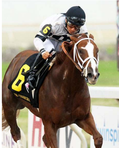
Take Charge

Since then this champion sire has notched up 25 winners at Grade I level, 20 at Grade II and 32 at Grade III in the Northern Hemisphere. Of these 25 Grade I winners, Take Charge Brandi ranks alongside Carpe Diem, Creative Cause, First Samurai, Intense Focus and Shamardal as one of six Grade I juvenile winners, but this isn't simply a story of a son of Storm Cat being a powerful influence for precocity. Of the other 19, seven gained their first Grade I success as 3-year-olds, five as 4-year-olds, five as 5-year-olds and two as 6-year-olds. In other words, good Giant's Causeways come along at virtually every age.