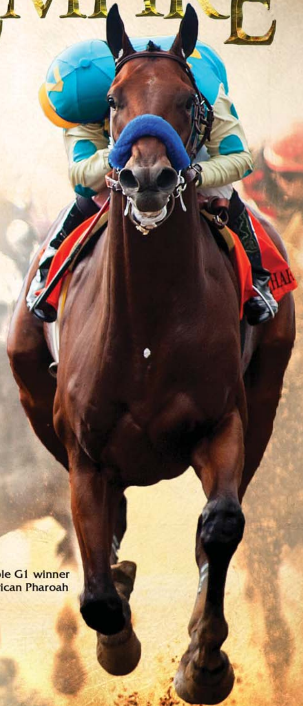
Multiple G1 winner American Pharoah

Congratulations to owner & breeder Zayat Stables