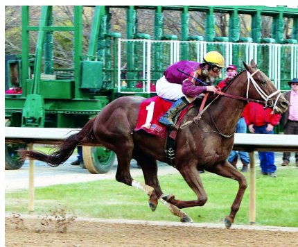
Far Right Coady Photography