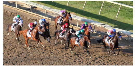
Bayern leads star-packed field in Pennsylvania Derby

Monmouth and Delaware have condensed days. With the horses and horsemen we have in Maryland we want to expand on that.”