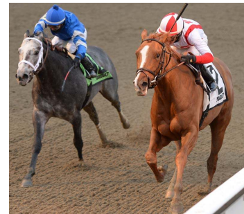
Leave the Light On holds off Frosted in Remsen.