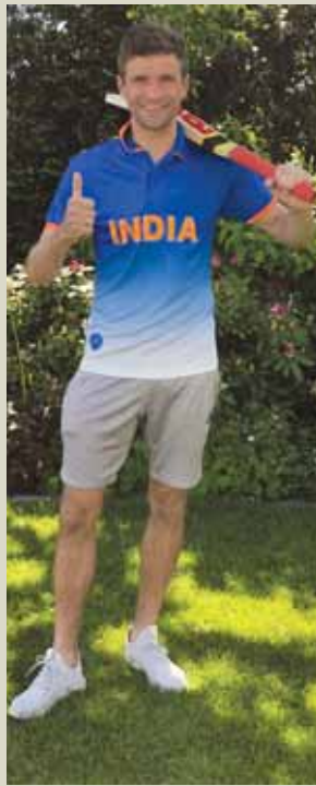
Bayern Munich and Germany forward Thomas Mueller posted a picture of him wearing an Indian cricket shirt and holding a bat on his twitter account yesterday.

"Especially I cross my fingers for @imVkohli, the captain of the Indian team. He's a fan of @DFB_Team and supported it multiple times in the past #Cricket #GermanyCheersForIndia."