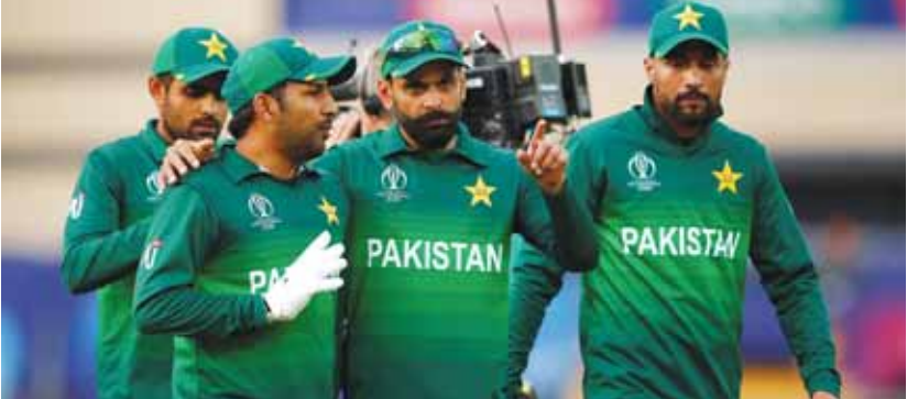
Pakistan skipper Sarfaraz Ahmed (Second left) and Mohamed Hafeez are deep in discussion after the victory over England in the World Cup yesterday.

On that occasion, Pakistan were bowled out for just 105, but they proved a much tougher against England and Hafeez put that down to the whole squad sticking together and producing their best at key moments.