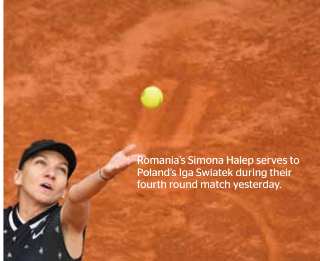
Romania's Simona Halep serves to Poland's Iga Swiatek during their fourth round match yesterday.

Japanese seventh seed Nishikori came back from 1-4 and 3-5 down in the final set to beat Benoit Paire of France and set-up a quarter-final clash on Tuesday against defending champion Rafael Nadal.