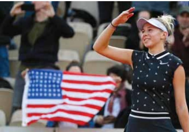
Amanda Anisimova of the US reacts after winning her fourth round match against Spain's Aliona Bolsova.

Halep reached her fourth French Open quarter-final with