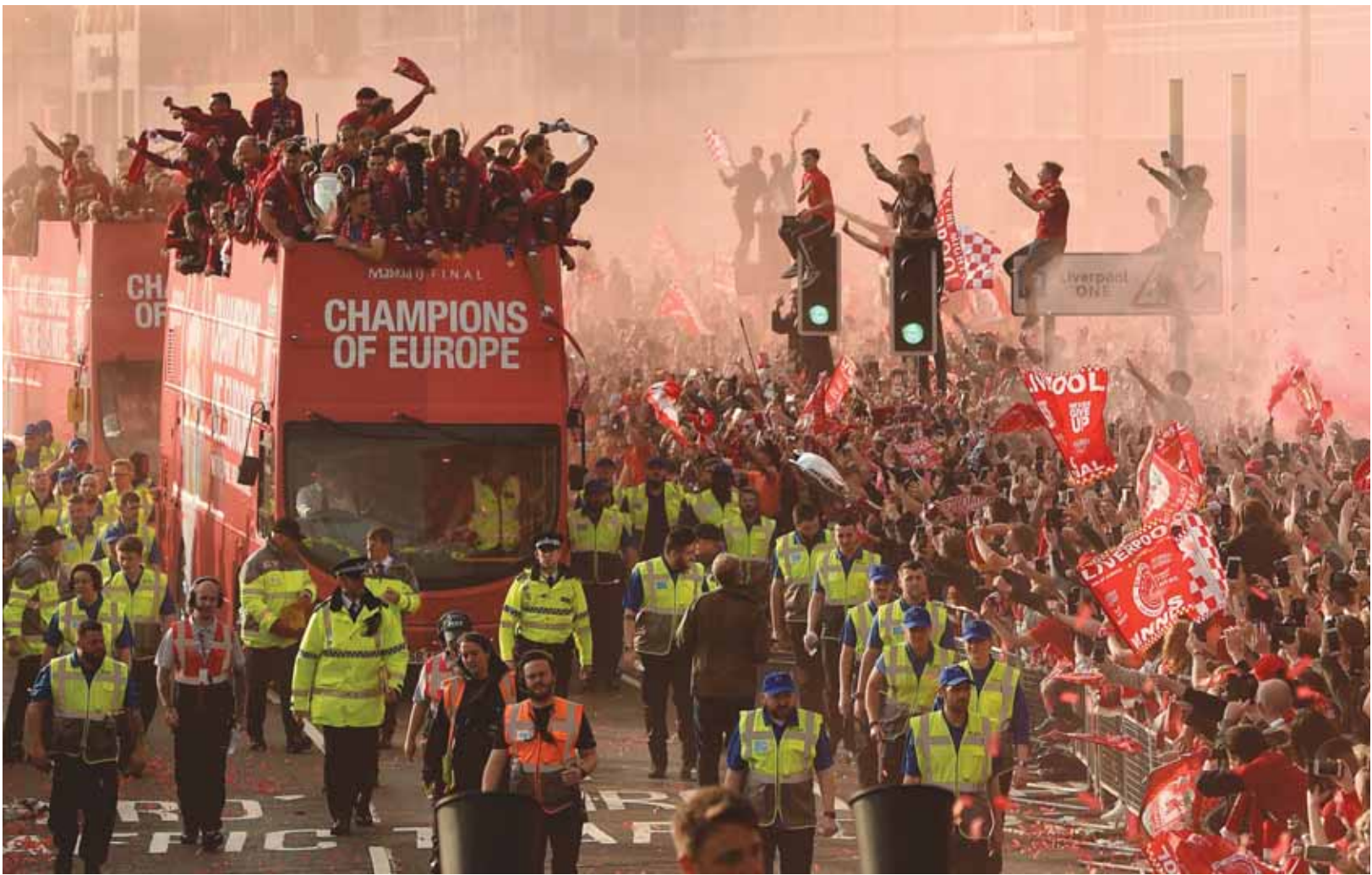
Fans line the streets to see the Liverpool team take part in an open-top bus parade around Liverpool on Sunday, after winning Champions League title.

flicting messages in the run-up to the Champions League final. While Spurs face immediate challenges to make the leap to Premier League contenders, Liverpool and their coach Jurgen Klopp appear to stand a good chance of dethroning City and winning their first Premier League title for 29 years next season. Liverpool lost out to City by a single point in a thrilling race this season.