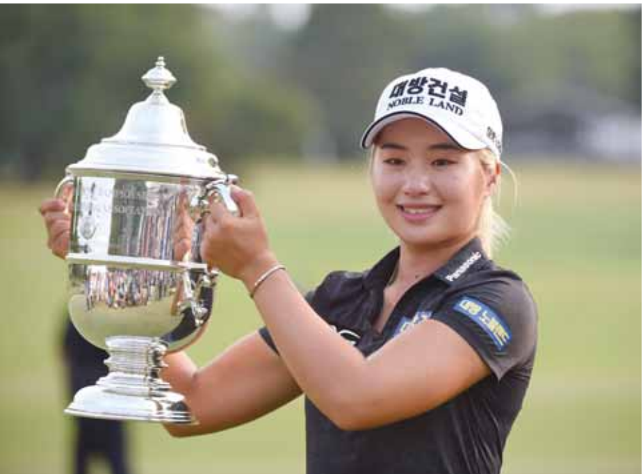
South Korea's Jeongeun Lee6 holds the trophy after winning the US Women's Open at Country Club of Charleston.