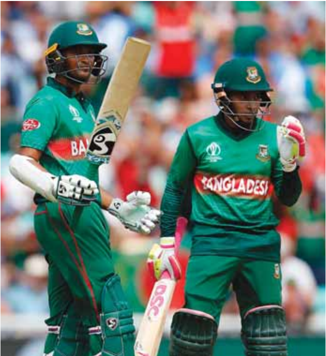
Bangladesh's Shakib Al Hasan (left) and Mushfiqu Rahim put on 142 for the third wicket against South Africa.

Shakib Al Hasan revelled in his formidable double act with Mushfiqu Rahim after Bangladesh secured a 21-run victory in their World Cup opener against South Africa on Sunday.