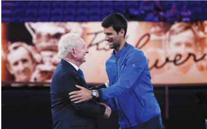
File picture of Novak Djokovic with Rod Laver during the Australian Open.