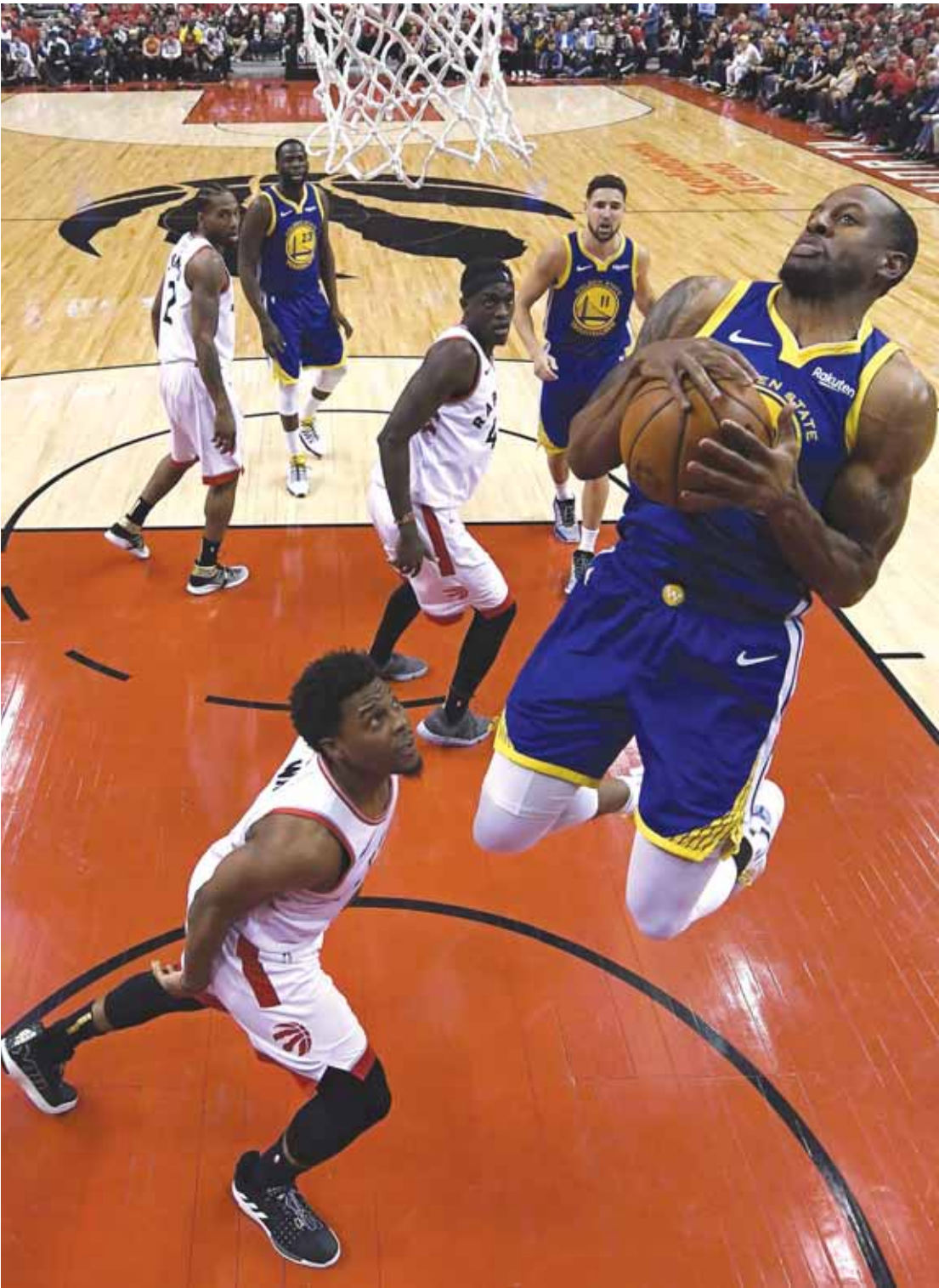
Andre Iguodala of the Golden State Warriors goes to the basket against the Toronto Raptors during game two of the 2019 NBA Finals at Scotiabank Arena in Toronto.