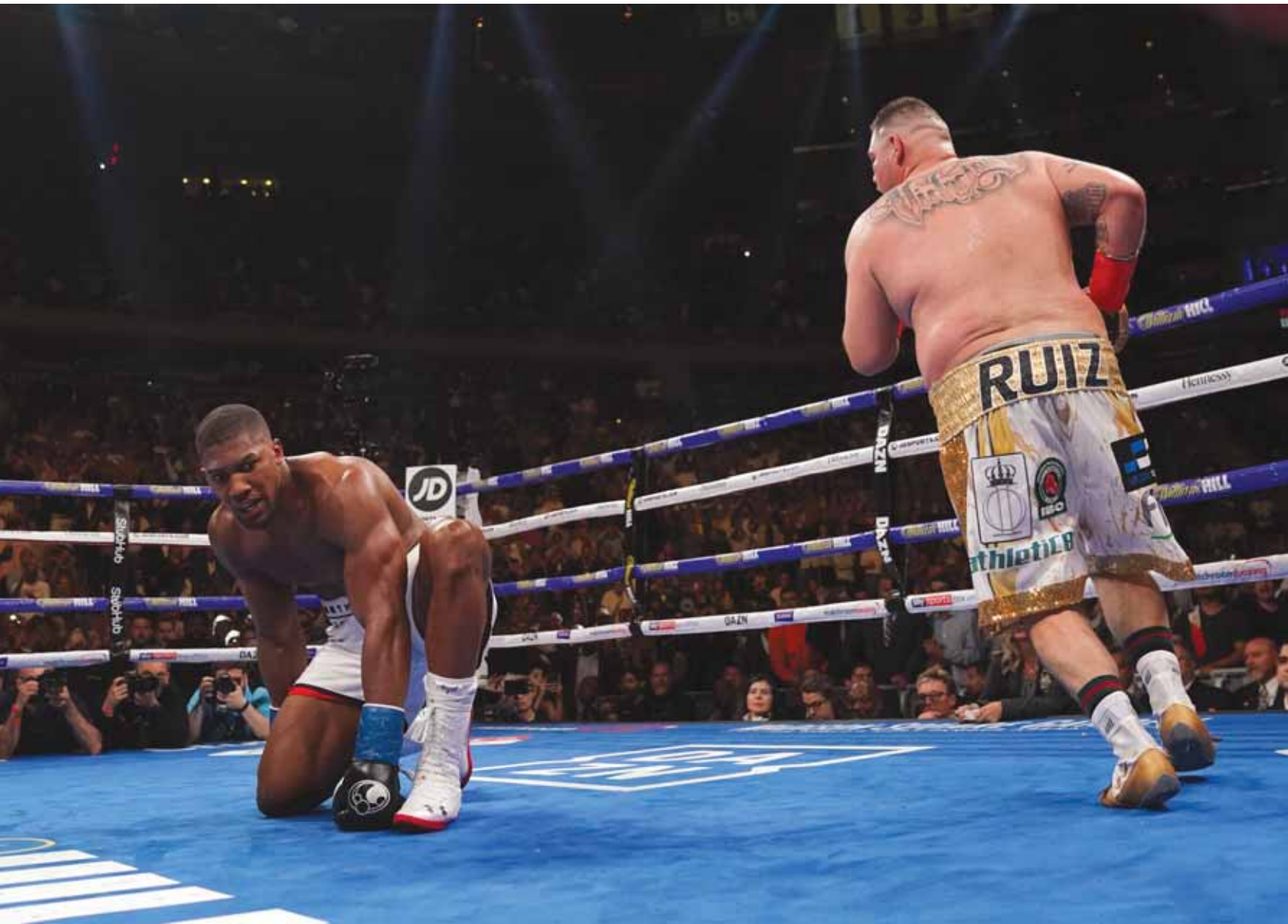
England’s Anthony Joshua kneels after being knocked down by USA’s Andy Ruiz (right) in the 7th round to win by TKO during their 12-round IBF, WBA, WBO & IBO World Heavyweight Championship fight at Madison Square Garden in New York.

‘I think he’s finished. It’s not just the defeat, anybody can get defeated, but the nature of it’