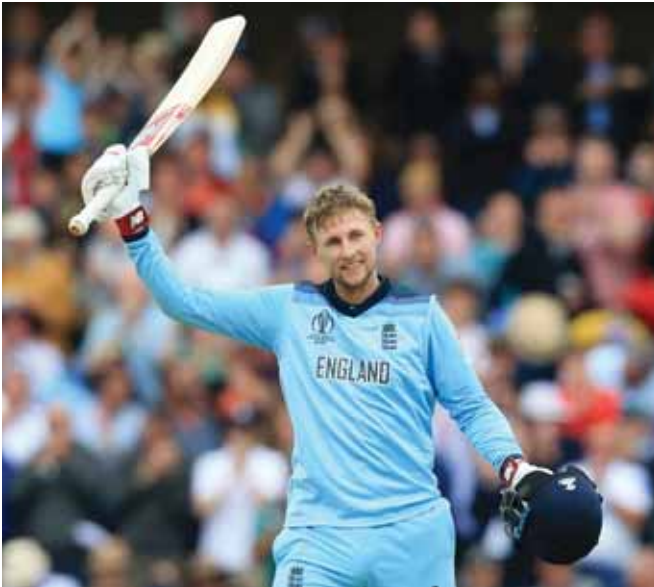
England's Joe Root celebrates after reaching his century against Pakistan yesterday, but his effort went in vain as his team fell short of the target by 14 runs.

Babar completed a run-a-ball fifty while Hafeez pressed on after being dropped on 14 when Roy floored a sitter at mid-off.