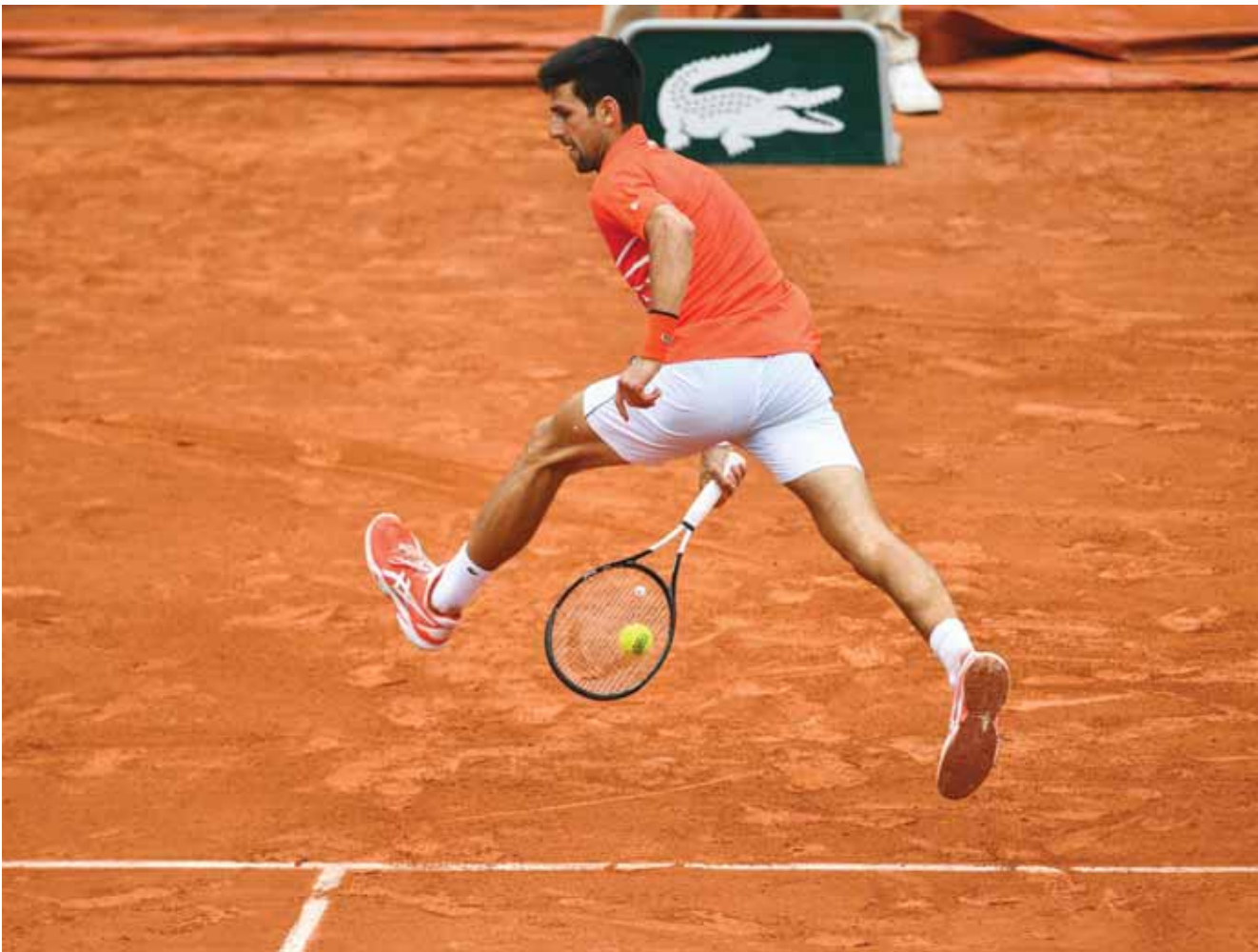
Serbia's Novak Djokovic returns the ball to Germany's Jan-Lennard Struff during their fourth round match at the French Open in Paris yesterday.

Nishikori won 6-2, 6-7 (8/10), 6-2, 6-7 (8/10), 7-5 in a shade under four hours to reach his third last-eight match at the French Open.