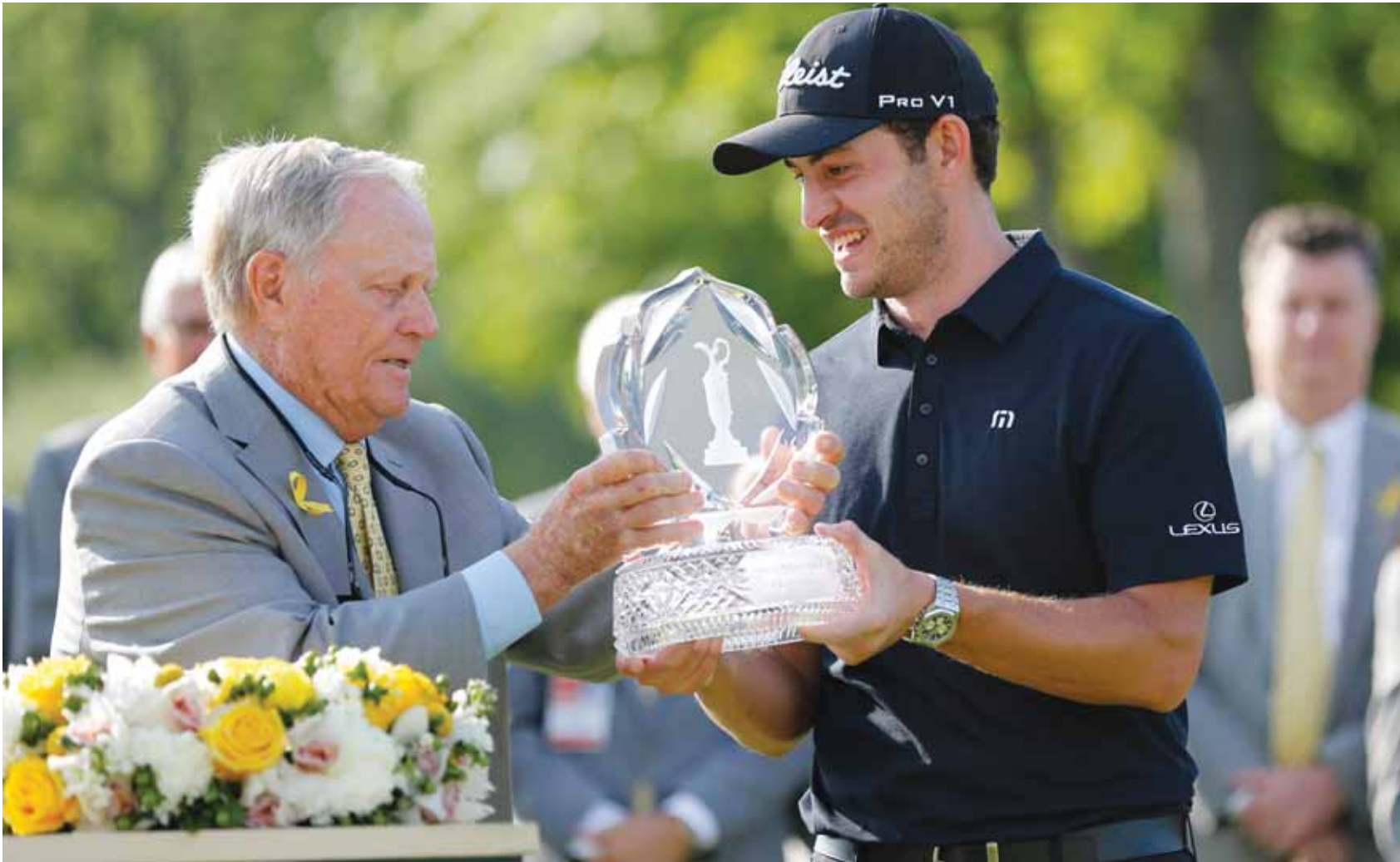
Winner of the Memorial tournament Patrick Cantlay receives the trophy from golf legend Jack Nicklaus at Muirfield Village Golf Club on Sunday.

‘That’s why you’re there and I definitely felt like that today. I felt at ease’