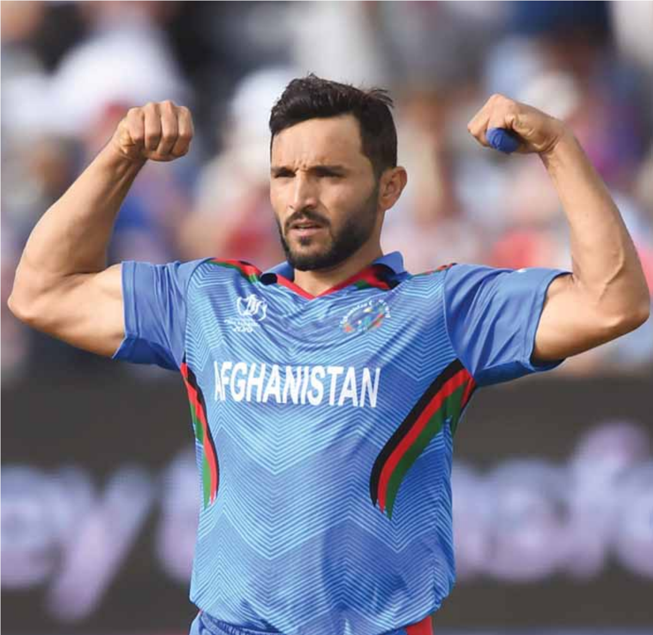
Captain Gulbadin Naib's Afghanistan were given a harsh lesson by holders Australia, who cruised to a seven-wicket win on Saturday.

Naib also declared pace bowler Hamid Hassan fit to face Sri Lanka. "Hassan was hit by the ball (in the last game) but he's feeling well," he said.