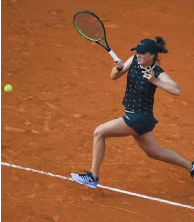
Poland's Iga Swiatek returns the ball to Romania's Simona Halep.