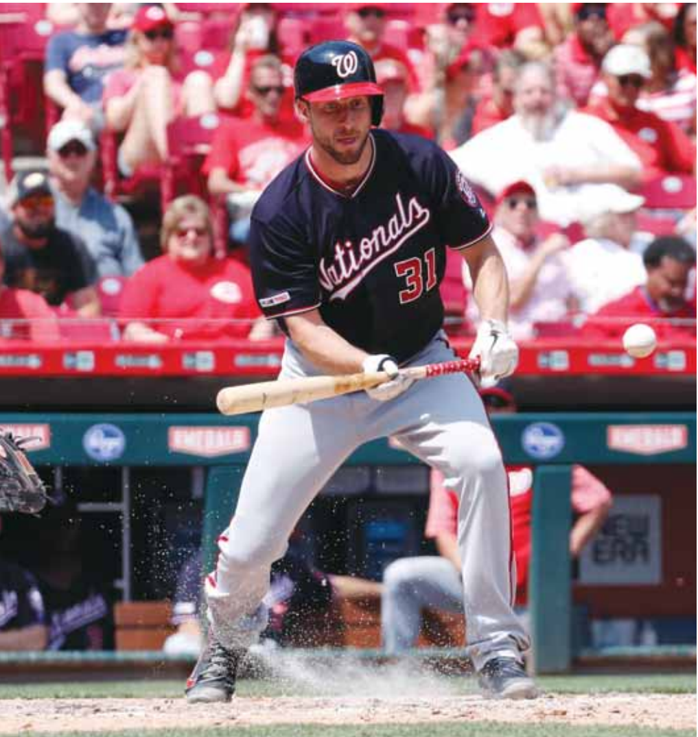
Washington Nationals starting pitcher Max Scherzer bunts against the Cincinnati Reds during the seventh inning at Great American Ball Park.