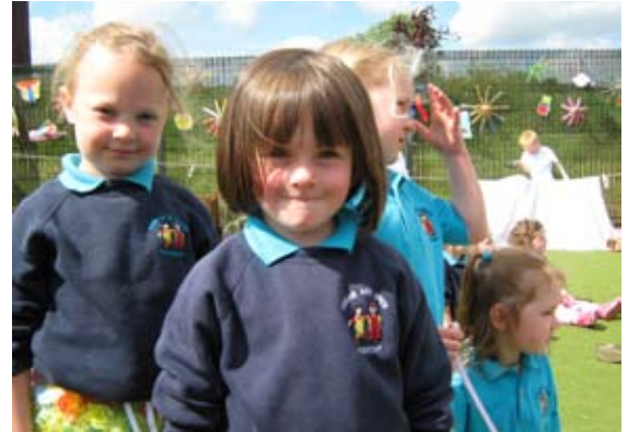
Preschoolers in Drumquin, Northern Ireland

The first day of the conference included a tour of Sugar & Spice, a preschool in Drumquin located outside of