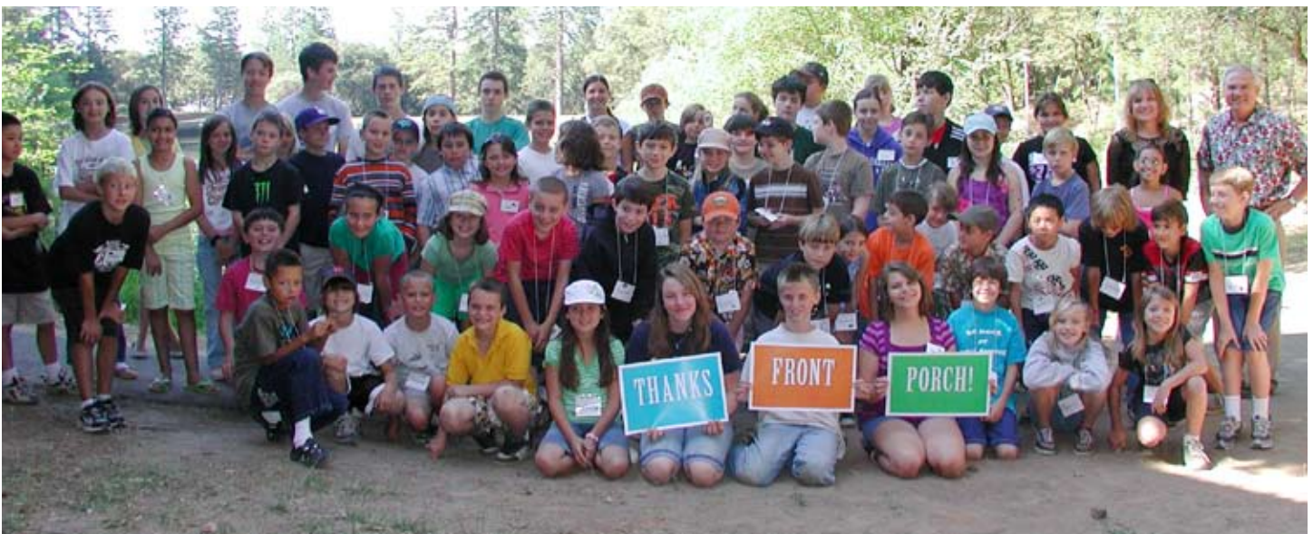
Students take a moment to thank Front Porch for its generous sponsorship