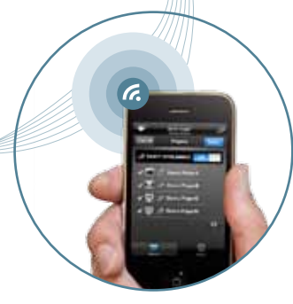
Network Audio Remote App for Android or iOS devices