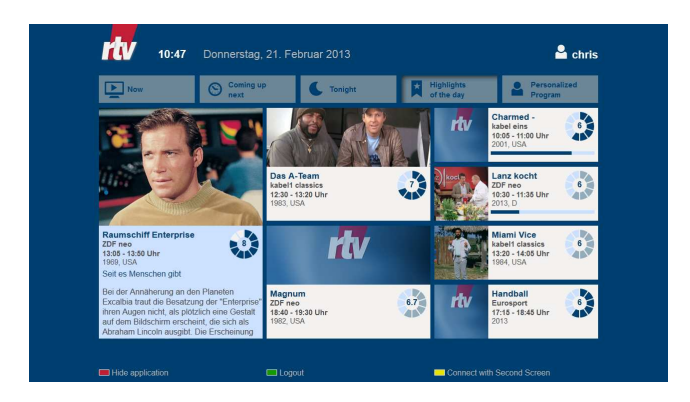
Figure 1: TV Predictor Menu

The TV Predictor Menu will open when users press the red button on their remote control. As shown in figure 1 there is a main navigation on the top of the screen. The part below is used to display the contents of the current section – in this case the program highlights of the current day.