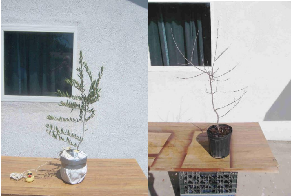
Figure 3. Live olive tree and same tree after submergence under water for 3 months. From experiment by Charles Munroe III.

On that basis, when a dove brought an olive twig with fresh leaves to Noah on the ark (Genesis 8:11), the whole world cannot have been submerged under water during the flood. Otherwise, all olive trees would have been killed in 6 months of their submergence under the flood waters. Therefore, the flood must have been local in southern Mesopotamia with some land (say 100 feet above water) was present on which olive trees must have been growing and from which an olive tree with such a twig with fresh leaves could have been obtained by the dove. (Collins 2017)