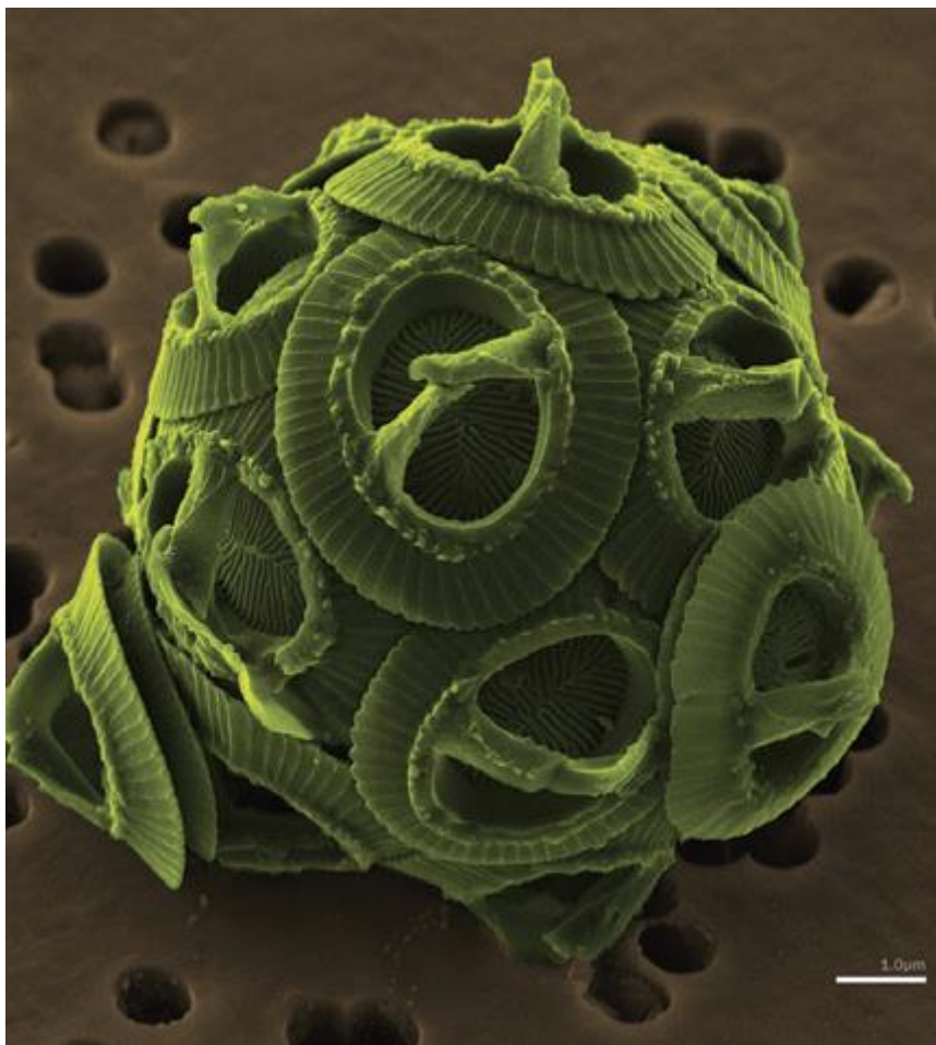
Figure 1. Coccoliths in chalk.

require sunlight and must float close to the ocean surface to get energy from the sun ( Figure 1 ).