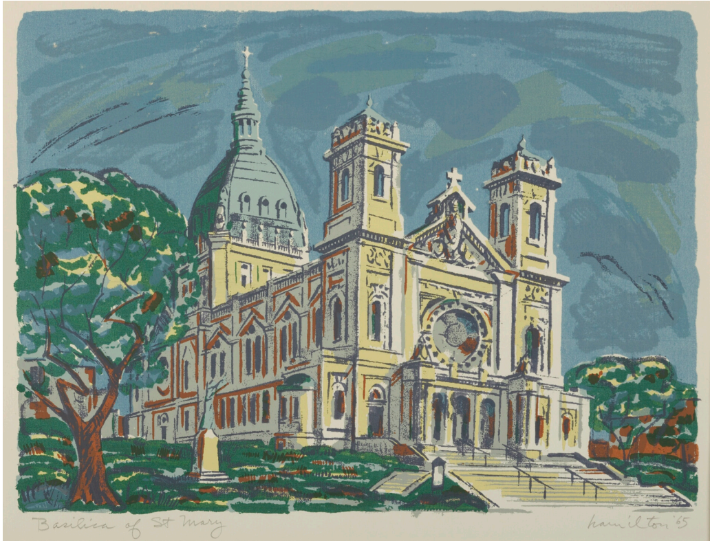
The Basilica of Saint Mary