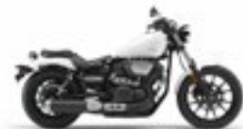
STANDARD BLUISH WHITE