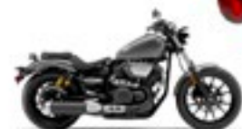
R-SPEC MATTE METALLIC GRAY