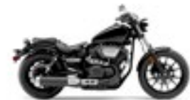
STANDARD METALLIC BLACK