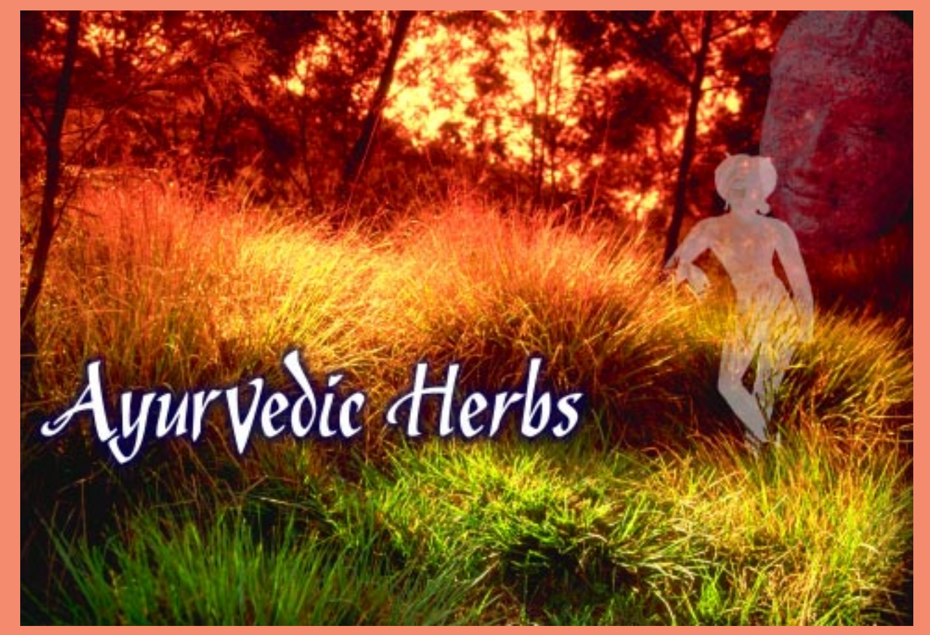
Photo: "The Holy Grass of the Orchid-filled Hills" of the Nilgiri Plateau, South India, a primal grasslands in which these original grass species allow herbs and flowers to grow between their clumps unlike modern carpet grass in lawns. Grass orchids grow here, unique in the world, among the herbs at an altitude of 6,000 feet.