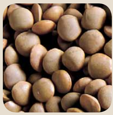
Lentils 'Crimson': reddish-brown seed coat; red cotyledon