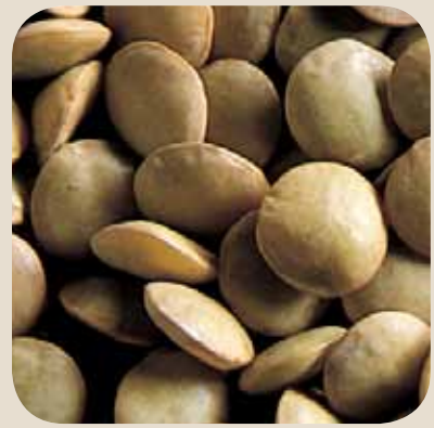
Lentils 'Large Green': bright green seed coat; yellow cotyledon