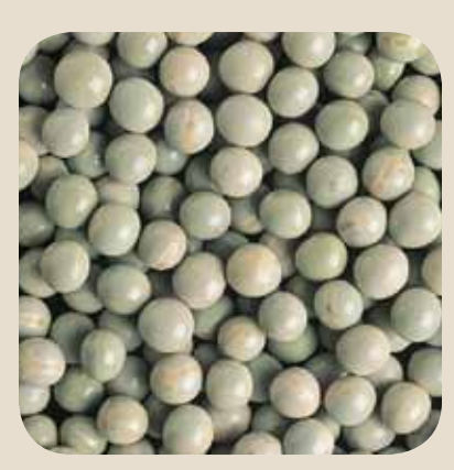
Dry Green Peas 'Cruiser': light green seed coat; dark green cotyledon