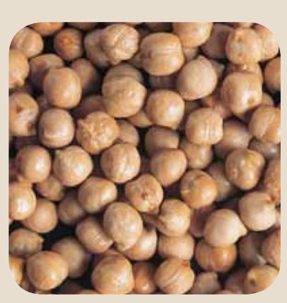
Chickpeas 'Kabuli type': small caliber; creamy-white seed coat; yellow cotyledon