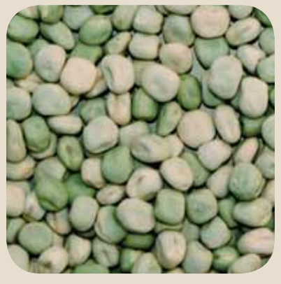
Marrowfat Peas: light green seed coat; dark green cotyledon