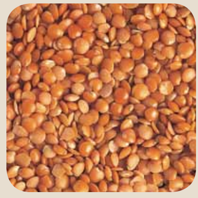
Lentils 'Crimson': decorticated; red cotyledon