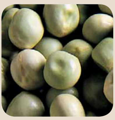
Dry Green Peas 'Columbia': light green seed coat; dark green cotyledon