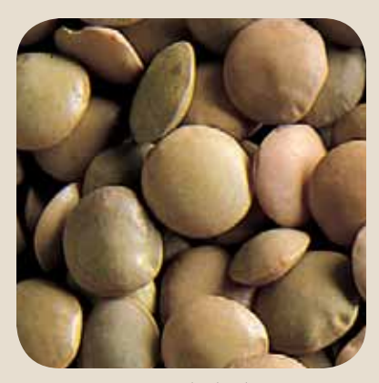
Lentils 'Regular': light brown, mottled seed coat; yellow cotyledon