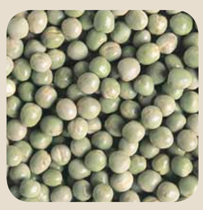
Winter Peas: light green seed coat; dark green cotyledon