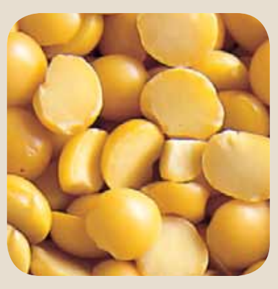
Yellow Split Peas: light yellow seed coat; deep yellow cotyledon