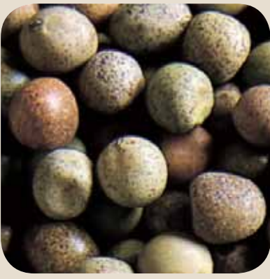
Austrian Winter Peas: mottled dark green/brown seed coat; yellow cotyledon

Lentils 'Eston': tan to green seed coat; yellow cotyledon