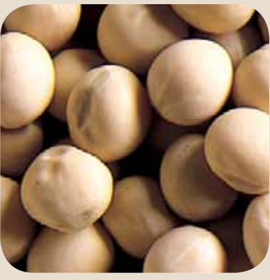
Dry Yellow Peas: light yellow seed coat; deep yellow cotyledon

Lentils 'Eston': tan to green seed coat; yellow cotyledon