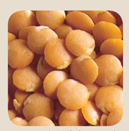
Lentils 'Red Chief': light tan seed coat; red cotyledon