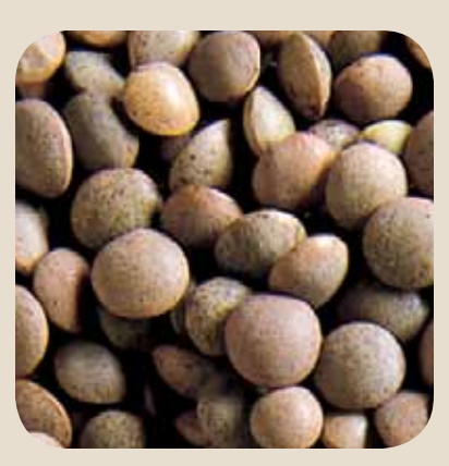
Lentils 'Pardina': speckled grey/ brown seed coat; yellow cotyledon