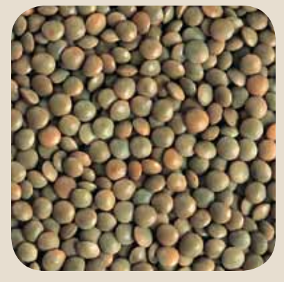
Winter Lentils: light to dark brown seed coat; red cotyledon