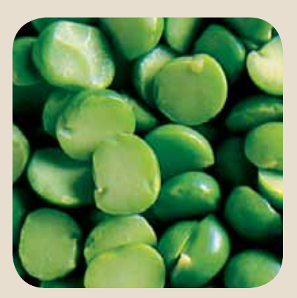
Green Split Peas: light green seed coat; dark green cotyledon