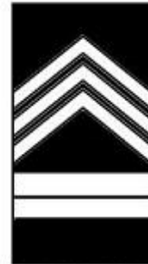
CADET SERGEANT FIRST CLASS