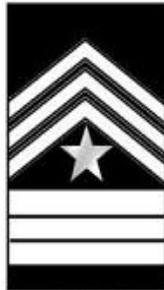
CADET SERGEANT MAJOR