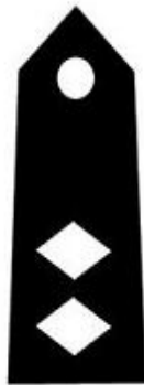
CADET LIEUTENANT COLONEL