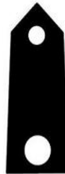
CADET SECOND LIEUTENANT