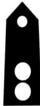
CADET FIRST LIEUTENANT