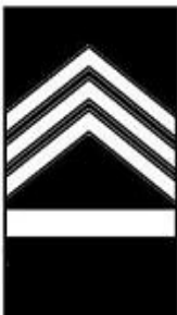
CADET STAFF SERGEANT