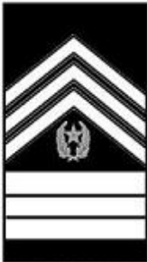
CADET COMMAND SERGEANT MAJOR