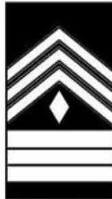
CADET FIRST SERGEANT