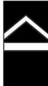
CADET PRIVATE FIRST CLASS