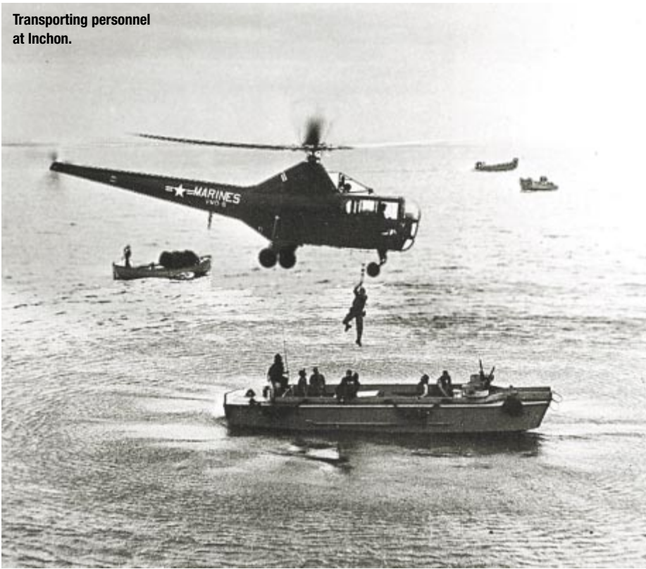
Transporting personnel at Inchon.