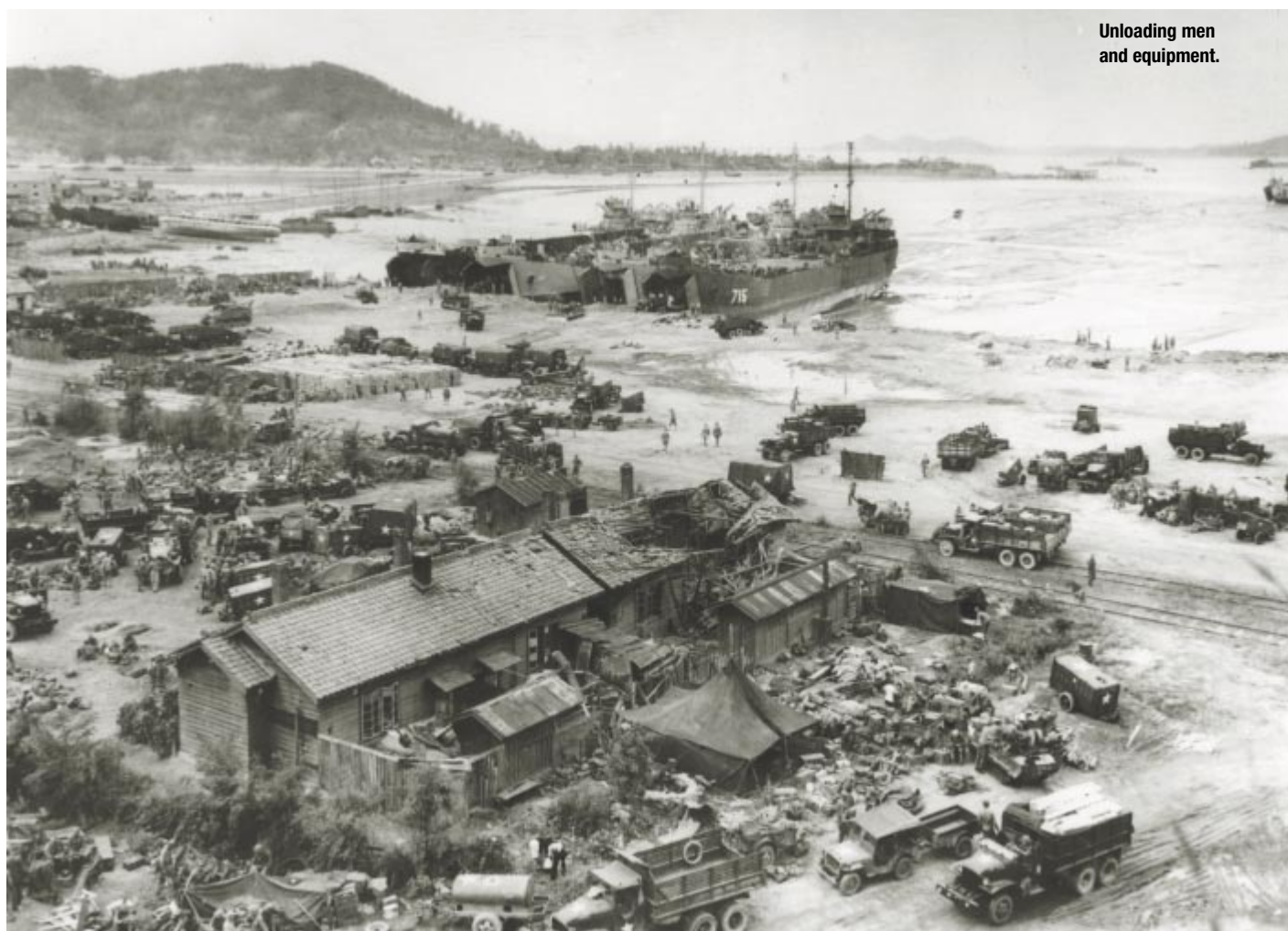
Naval Historical Center