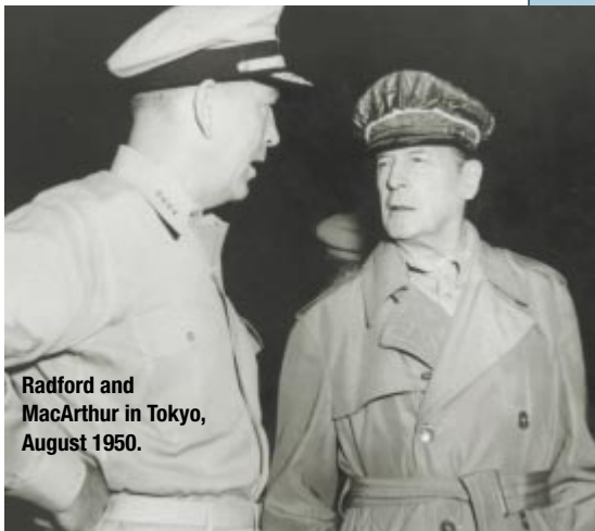
Radford and MacArthur in Tokyo, August 1950.

A believer in reconnaissance, MacArthur embarked key members of his staff on June 29 in his aircraft, Bataan , and flew to Suwon, 20 miles south of Seoul, where Ambassador John Muccio had fled with remnants of the U.S. mission. He then travelled by jeep to the Han River to observe South Korean forces in retreat and North Korean forces in action. He found that morale was not sufficient to the challenge. He mourned "I've seen many retreating Korean soldiers during this trip, all with guns and ammunition at their side and all smiling and I've not seen a single wounded man.