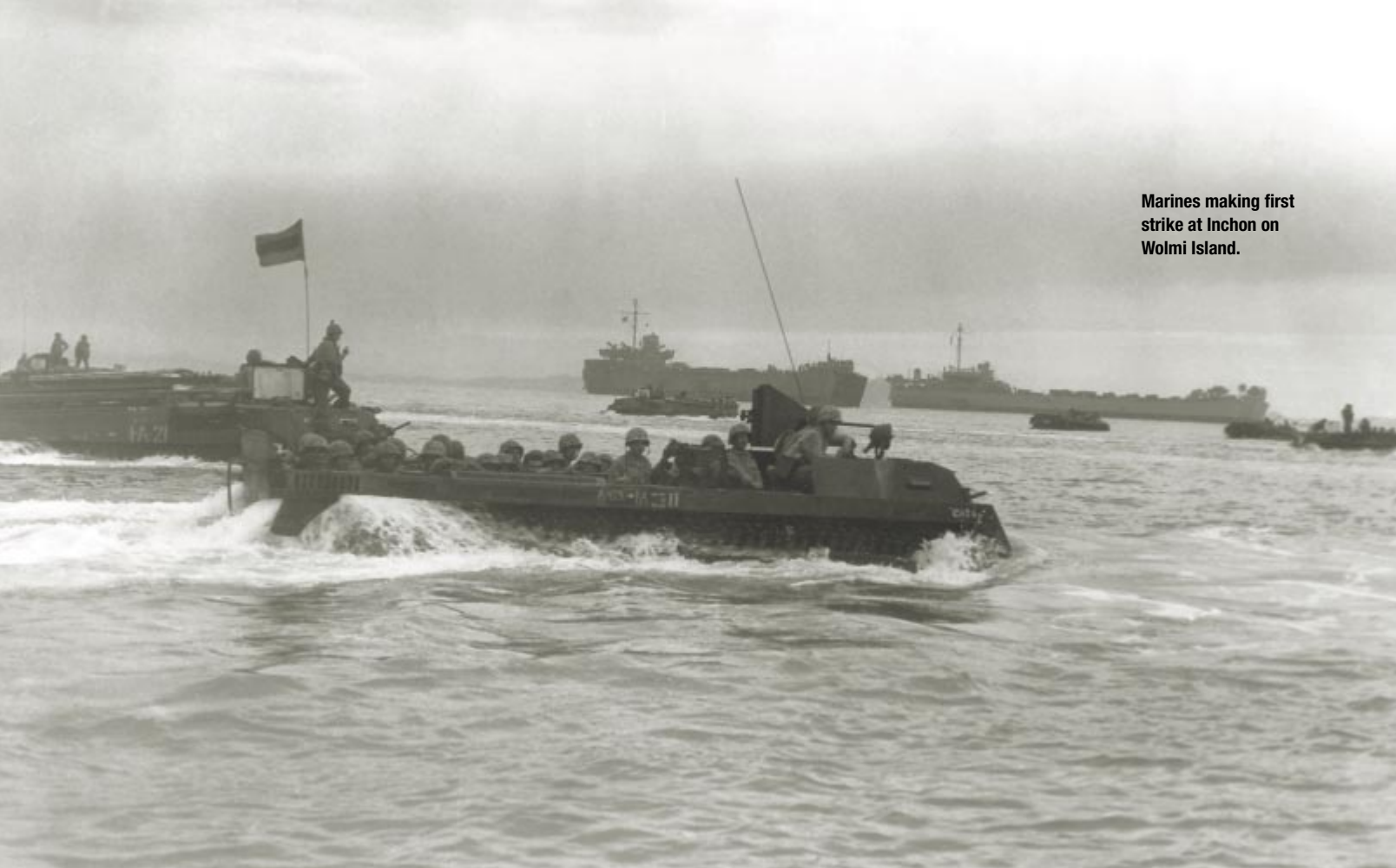
Marines making first strike at Inchon on Wolmi Island.