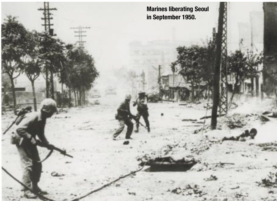
Marines liberating Seoul in September 1950.