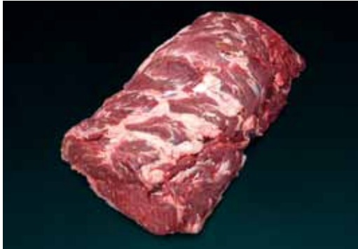
CHUCK EYE LOG

Typically less lean cuts prepared using boiling water