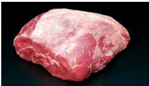
TOP SIRLOIN BUTT, CENTER-CUT, BONELESS, CAP OFF