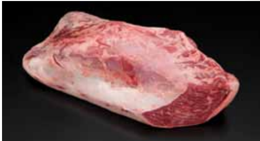
OUTSIDE ROUND (FLAT)