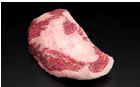
BRISKET, POINT CUT, BONELESS