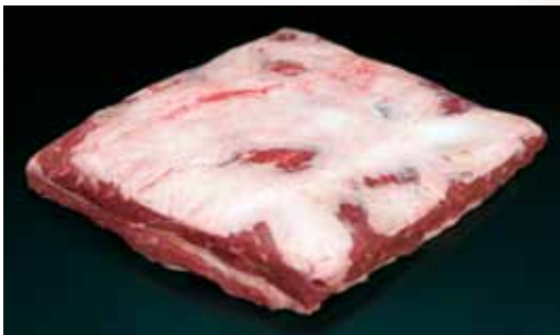
PLATE (EXPORT), KARUBI PLATE