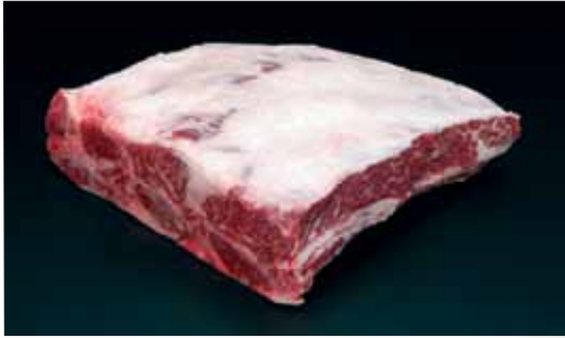
SHORT RIBS, BONE IN

Typically high marbled cuts prepared using high heat grilling