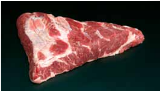
CHUCK SHORT RIBS, BONELESS