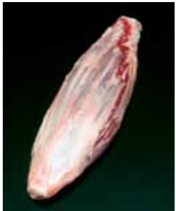
OUTSIDE ROUND, HEEL