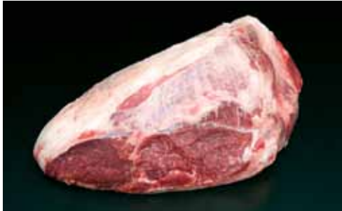
CHUCK SHOULDER CLOD HEART

Ideal for fajita grilling and stir fry, roasts and stews/curries