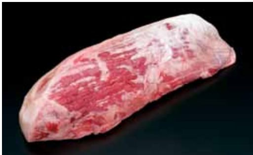
EYE OF ROUND