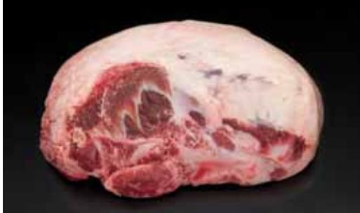
TOP ROUND (INSIDE)

Typically lean cuts prepared using high heat grilling or roasting