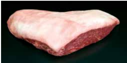
TOP SIRLOIN CAP, FAT ON